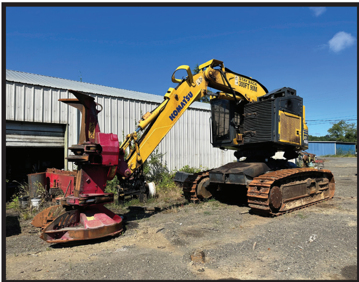
2016 KOMATSU XT460L-3 (NEEDS REPAIR)