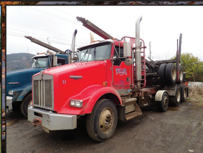
1999 KENWORTH T800