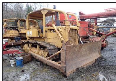
1969 CAT D6C

PLEASE SEE AUCTION CATALOG FOR COMPLETE TERMS AND CONDITIONS