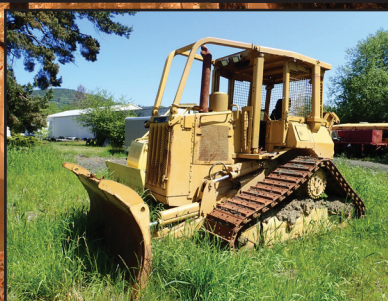
1993 CAT D4H