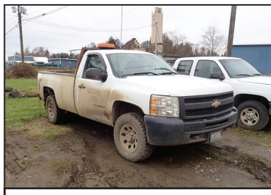
2011 CHEV 1500 SILVERADO