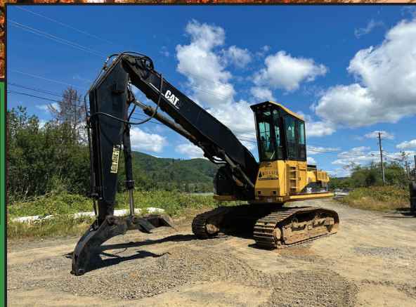
2007 CAT 325D FM (NO GRAPPLE)