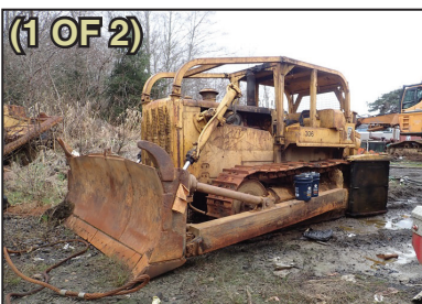
1970 & 1971 CAT D8H