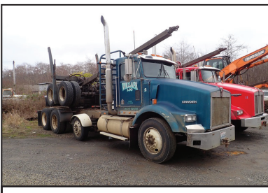
1993 KENWORTH T800