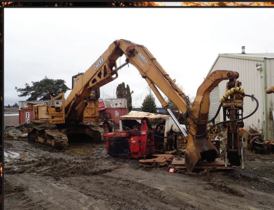
1999 JOHN DEERE 330LC