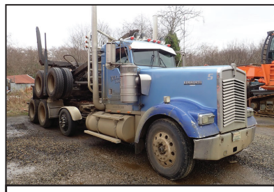
1999 KENWORTH W900B