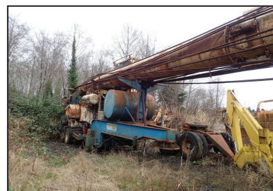
1976 SKAGIT T109