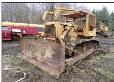
1978 CAT D7G