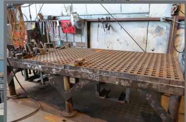
5' X 10' X 3-1/2" ACORN TABLE