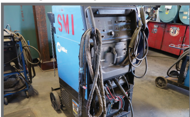
MILLER SYNCROWAVE 350LX

MISC VALVES, FITTINGS, FLANGES, SHEETS, PLUGS, SHOP SUPPLIES, BINS, HARDWARE, WELDING SUPPLIES, SAWHORSES, RACKS, PIPE, I-BEAM, TOOLS, TOOLING, INSPECTION EQUIPMENT, SHEET CLAMPS, CHAIN HOIST, STANDS, STEEL INVENTORY, LADDERS, GASKETS, RIGGING, FANS, 4' SLIP ROLLS, OXY/ACET CART, (3) TRACK CUTTERS, JOB BOXES, SOFT STRAPS, POWER BOXES, OXY/ACET HOSES, HEAVY POWER CORDS, SPIDER BOXES, FIRE HOSE, (2) ROD OVENS AND MUCH MORE!