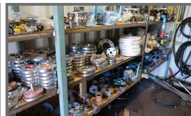
MISC VALVES, FITTINGS & FLANGES