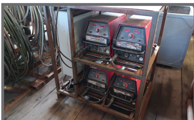
LINCOLN INVERTEC V350-PRO