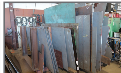
ASSORTED SHEET GOODS