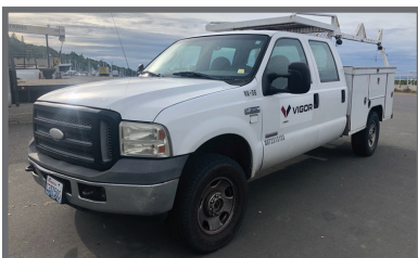
2005 FORD F350