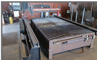
KOIKE PLP 1500