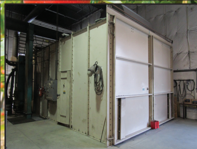
CLEMCO MOD/JOB 2517