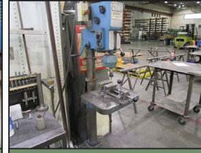
ABROGA TYPE A2508