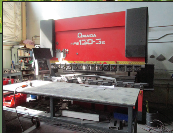
AMADA HFE 130-3S