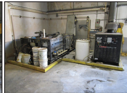
LANDA DELTA 1000