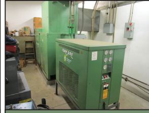
SULLAIR 16B-75H EES