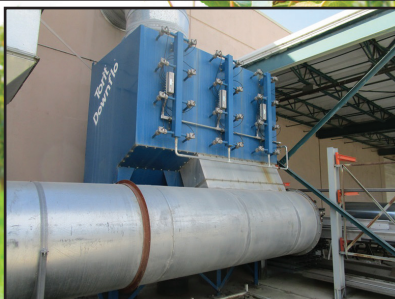
DONALDSON TORIT DOWNFLO