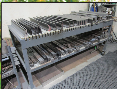
LARGE ASSORTMENT OF BRAKE DIES