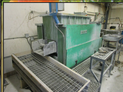
ALMCO TYPE V-17