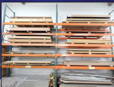
(6) SECTIONS OF PALLET RACKING