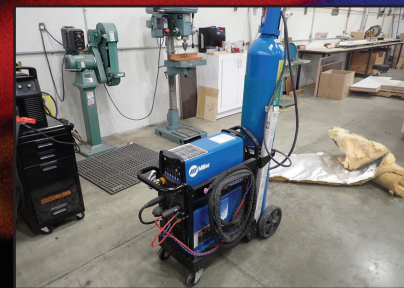
MILLER DYNASTY 210