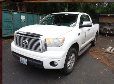
2013 TOYOTA TUNDRA LIMITED CREW MAX