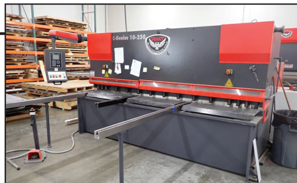
2018 REVOLUTION MACHINE TOOLS RMT C-GENIUS 10-25

Location: 7877 S. 180th St., Kent, WA 98032