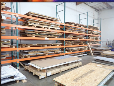
ASSORTED STAINLESS, ALUMINUM & STEEL