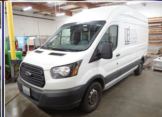
2018 FORD TRANSIT 250