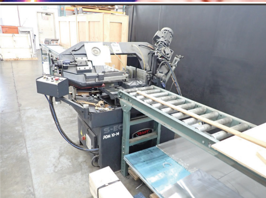
2018 REVOLUTION MACHINE TOOLS S-ECO PDM 10.14