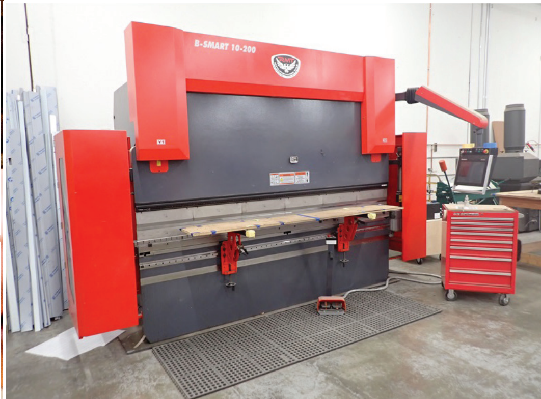
2018 REVOLUTION MACHINE TOOLS RMT B-SMART 10-200