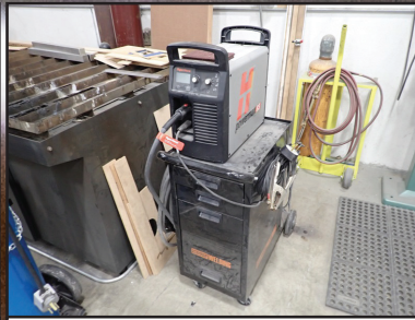
HYPERTHERM POWERMAX 85