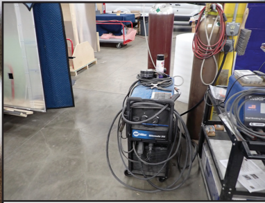
MILLER MILLERMATIC 252