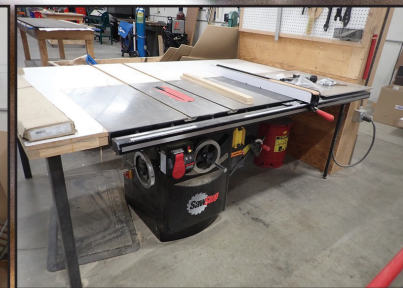
2018 SAWSTOP ICS53230