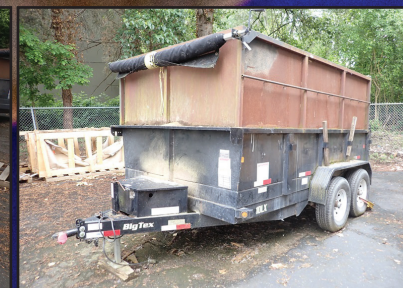
2014 BIG TEX 10LX

FOR MORE INFORMATION GO TO MURPHYAUCTION.COM • PHONE 425.486.1246