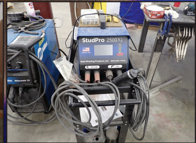
STUD WELDING PRODUCTS STUDPRO 2500XI