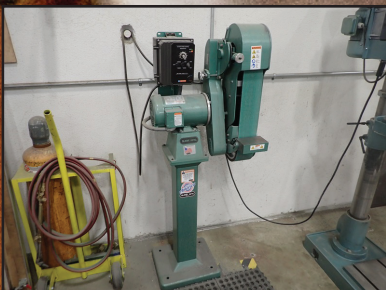
BURR KING 980