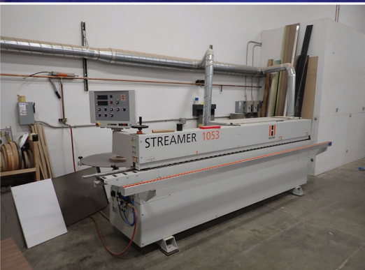
2017 HOLZHER STREAMER 1053