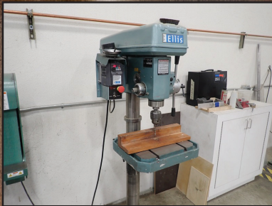
2018 ELLIS 9400