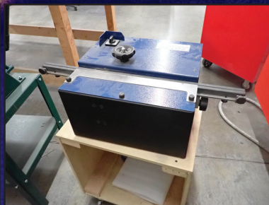
PROEDGE FINISHING EF-11