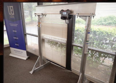
(5) UEI ALUMINUM PORTABLE GANTRY CRANES