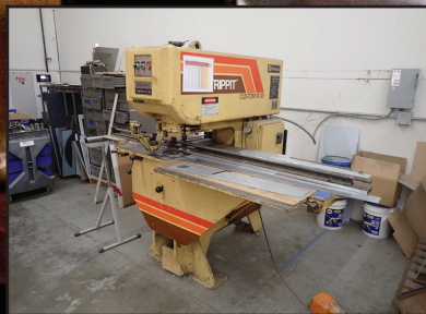
STRIPPIT CUSTOM 18/130