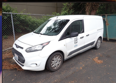
2015 FORD TRANSIT CONNECT XLT