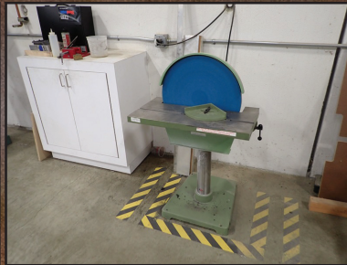
2018 CONQUEST DG203