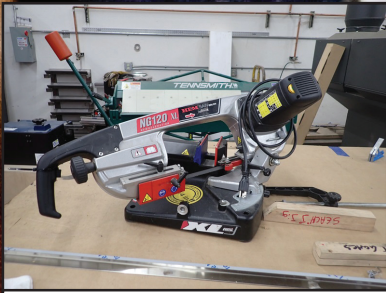
HEM SAW NG120XL