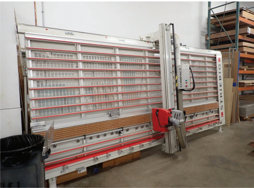
2018 STRIEBIG COMPACT 507