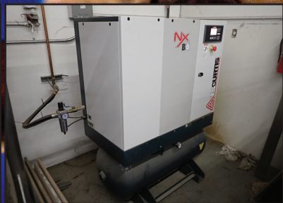
FS CURTIS NXB6