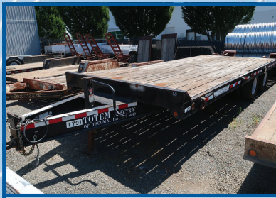
2008 TOWMASTER T20