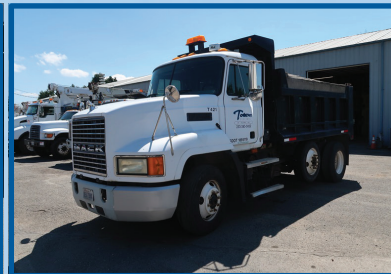
2000 MACK CH612