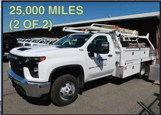
25,000 MILES (2 OF 2) 2020 CHEV 3500HD