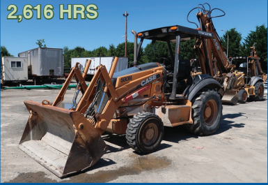
2006 CASE 580M SERIES 2