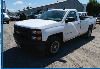
2015 CHEV SILVERADO 1500