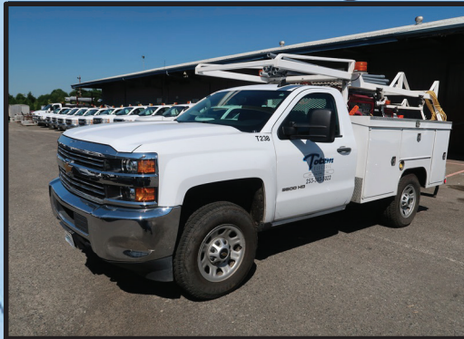
2016 CHEV 3500HD