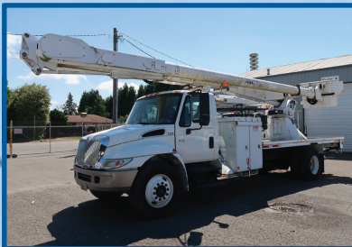
2006 INTERNATIONAL 4300