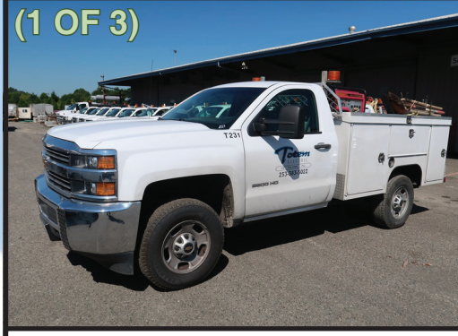
2015 CHEV 2500HD