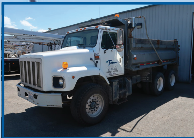
2002 INTERNATIONAL 2674