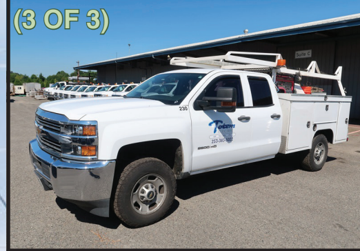
2015 CHEV 2500HD