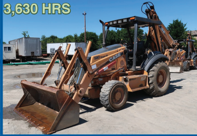
2006 CASE 580