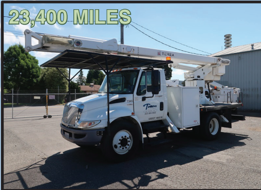
23,400 MILES 2009 INTERNATIONAL DURASTAR