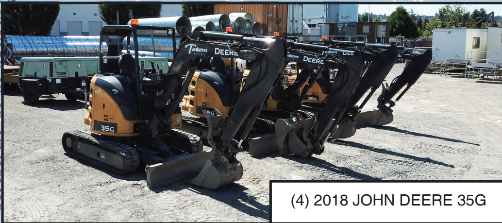
(4) 2018 JOHN DEERE 35G