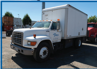
1996 FORD F800 SAW TRUCK