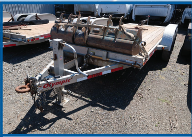
2019 OLYMPIC OM14-2E