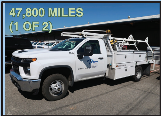
47,800 MILES (1 OF 2) 2020 CHEV 3500HD