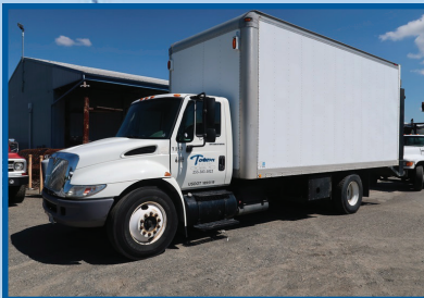
2005 INTERNATIONAL 4300 SAW TRUCK