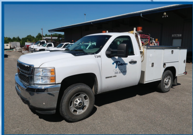
2014 CHEV 2500HD