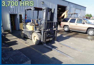
2006 DAEWOO G50C-2