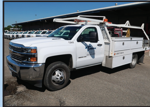
2016 CHEV 3500HD