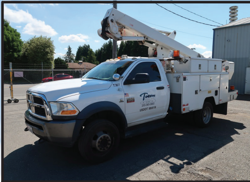
2011 RAM 5500