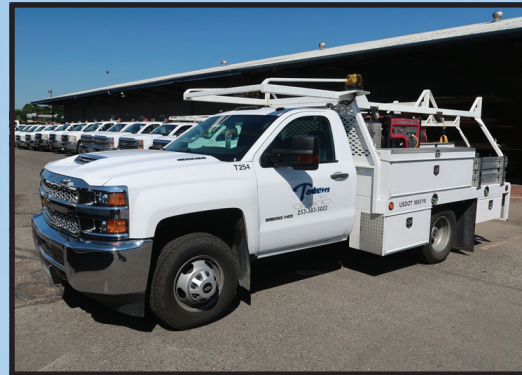
2019 CHEV 3500HD