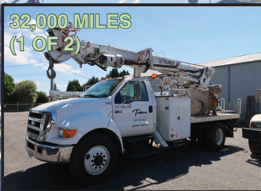
32,000 MILES (1 OF 2) 2007 FORD F750