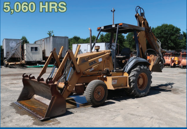
1998 CASE 580L SERIES 2