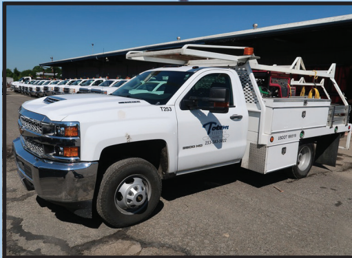
2019 CHEV 3500HD