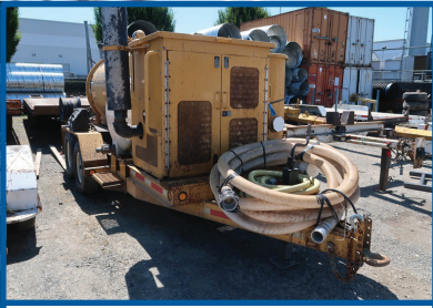
2000 VERMEER E550