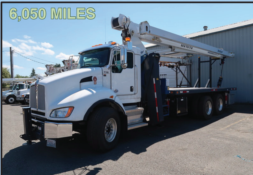
2019 KENWORTH T440