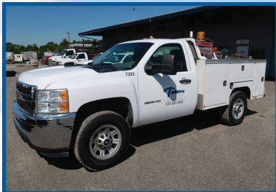
2013 CHEV 3500HD