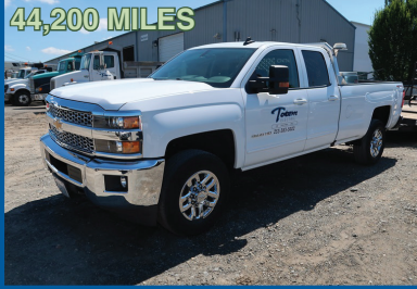
2019 CHEV 2500HD