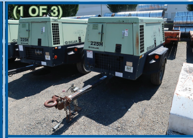
2008 SULLAIR 225H