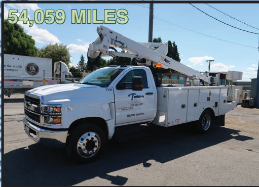
54,059 MILES 2019 CHEV SILVERADO 6500HD