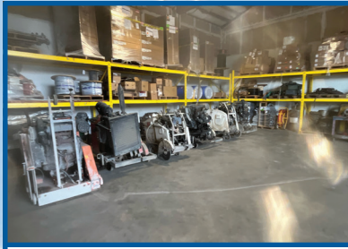
ASSORTED CONCRETE SAWS