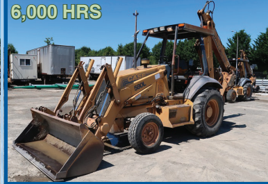
1999 CASE 580L