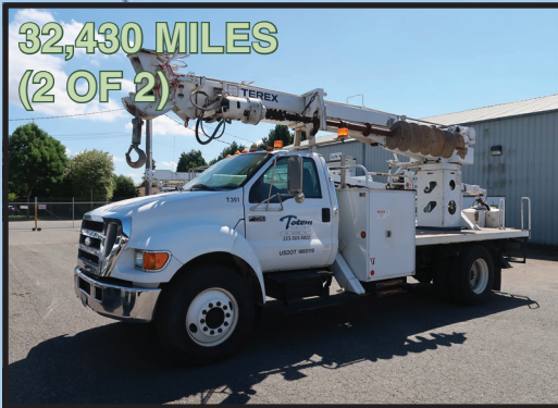
2007 FORD F750