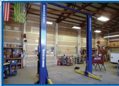
2016 BENDPAK XPR-12CL