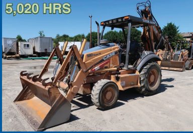
2004 CASE 580 SUPER M