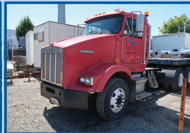
2000 KENWORTH T800B