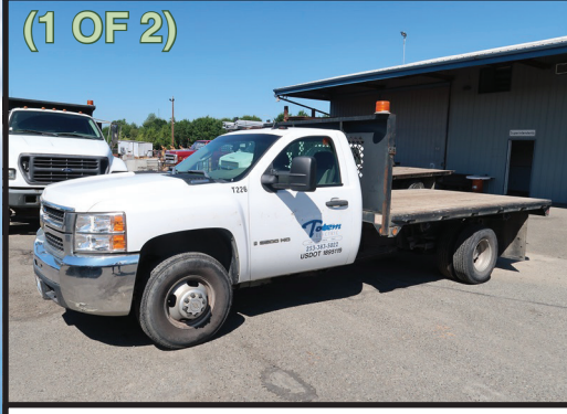
2007 CHEV 3500HD