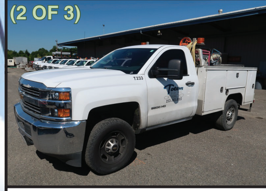
2015 CHEV 2500HD