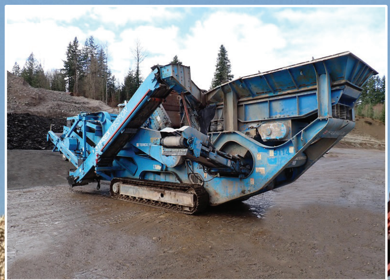
2006 TEREX PEGSON 4242SR