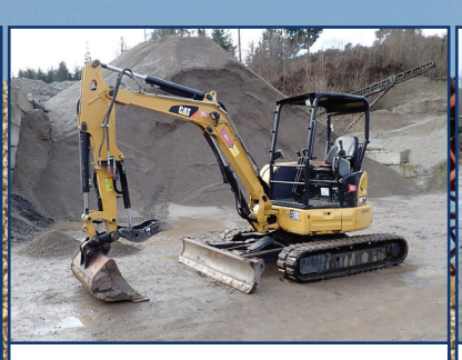
2016 CAT 304E2 CR