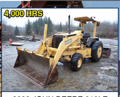
2003 JOHN DEERE 210LE