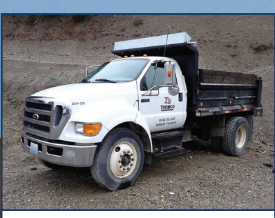
2007 FORD F750