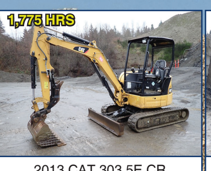
2013 CAT 303.5E CR