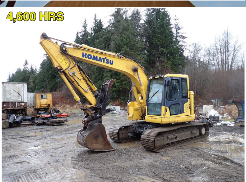
2016 KOMATSU PC138USLC-11