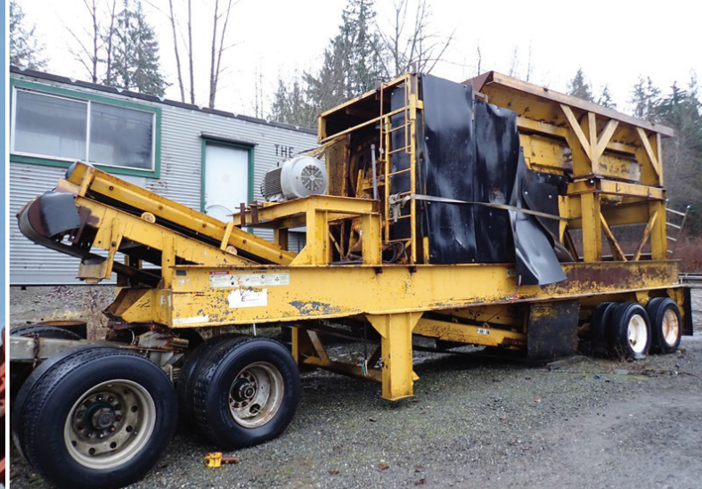
2001 GATOR 2436