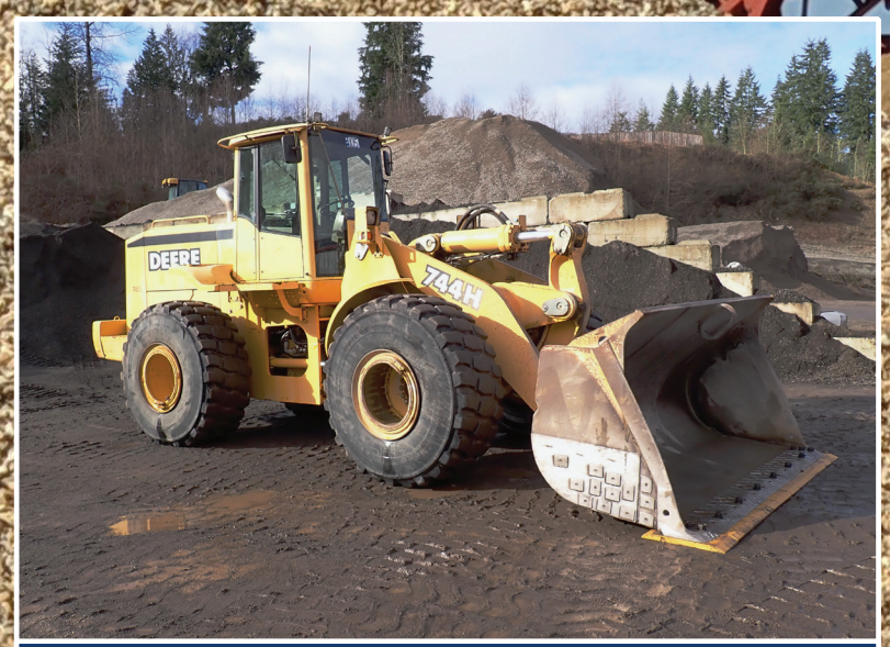
1999 JOHN DEERE 744H