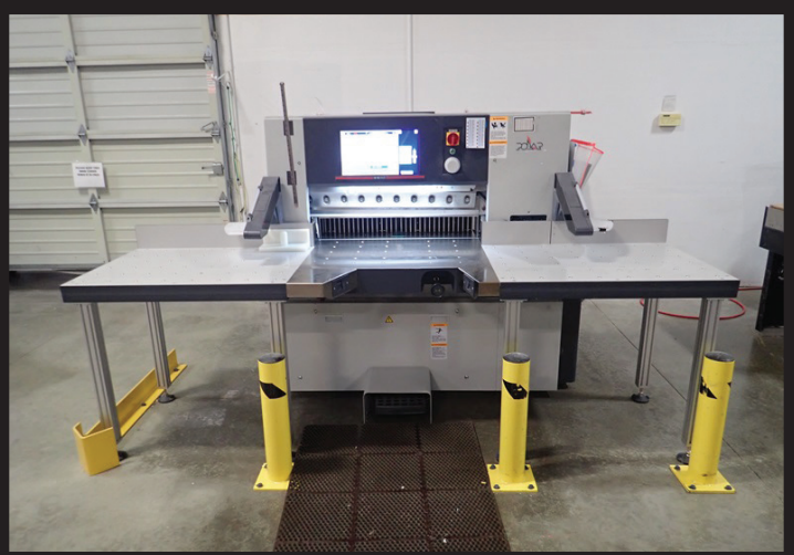
2018 POLAR N92PLUS