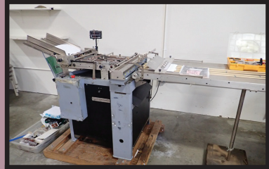
EZ MACHINE CNP95