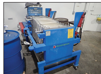
GOOD NATURE SX200