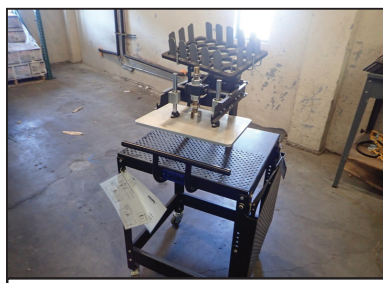
2018 WESTROCK CHUNK F47-01-A-4000