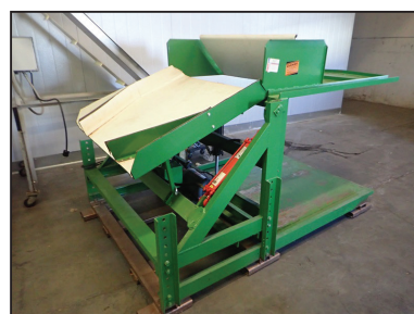
PRODUCE PACKAGING BD3002