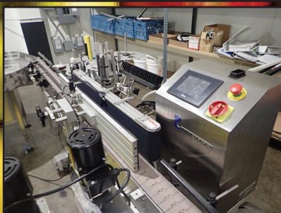
2016 PACK LEADER PL-501D