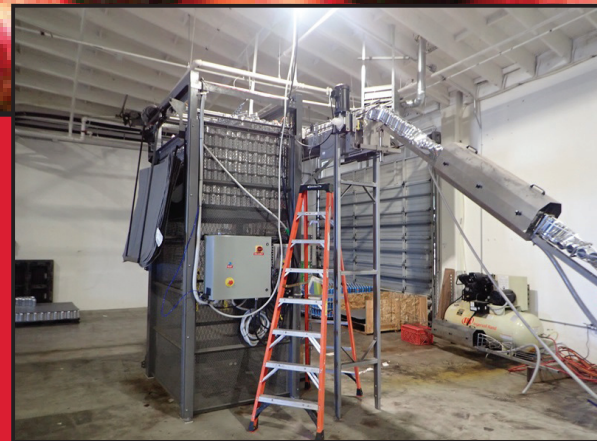
2017 SKA FAB CAN-I-BUS DEPALETIZER