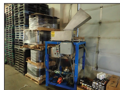
2013 GOOD NATURE PF150