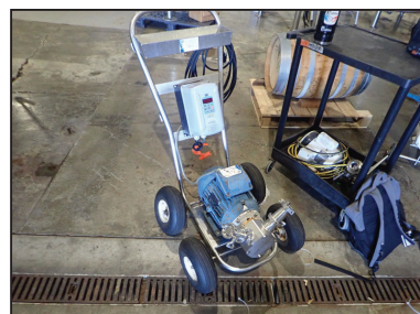
JABSCO VERAFLEX 52800-3105