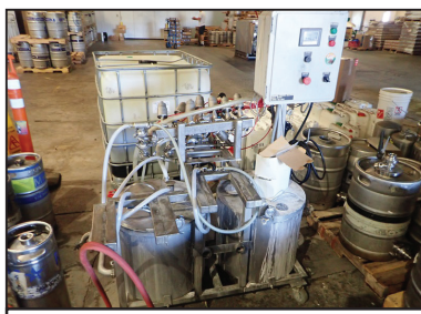
ADVANCED PROCESS SOLUTIONS