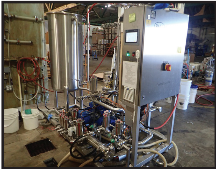
2016 PALL OENO FLOW FIT CROSS FLOW FILTER