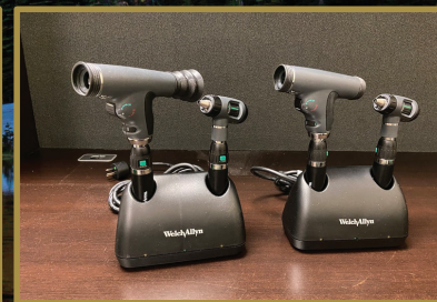
(2) WELCH ALLYN