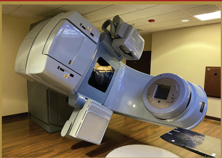
2011 VARIAN CLINIC iX-SERIES IMAGE-GUIDED RADIATION THERAPY & RADIOSURGERY LINEAR ACCELERATOR