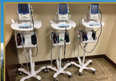
(3) WELCH ALLY/MAS SET Lxi