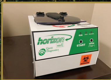
QUEST DIAGNOSTICS/HORIZON MINI-E 642E-QUEST