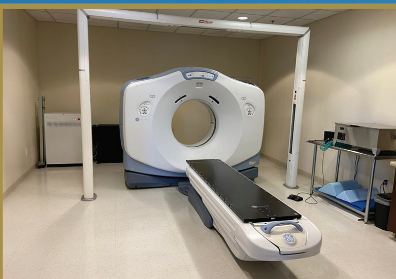
2011 GE HEALTHCARE OPTIMA CT580 CT SCANNER W/GANTRY