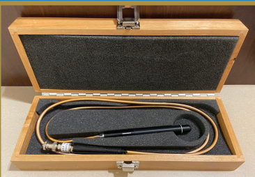
STANDARD IMAGING A19