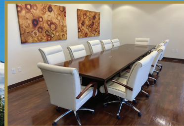
4'X14' WOOD CONFERENCE TABLE