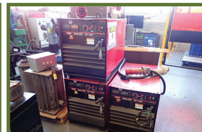
(3) LINCOLN IDEALARC DC-1000