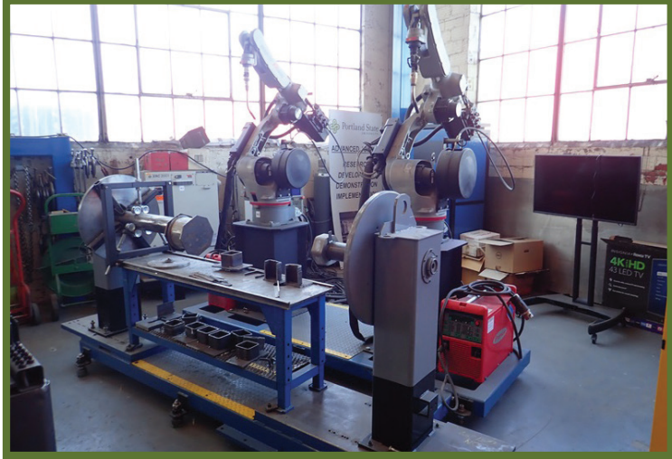
ROBOTIC WELDING SYSTEMS

1927 SE WATER AVENUE, PORTLAND, OR 97202