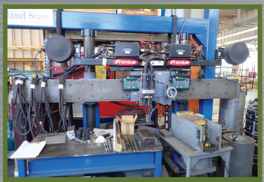
(2) LINDE SIDEBEAM