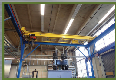
US CRANE & HOIST