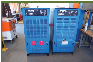
(2) MILLER CP/CC-1500