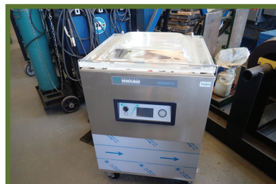
2018 HENKELMAN MARLIN 52