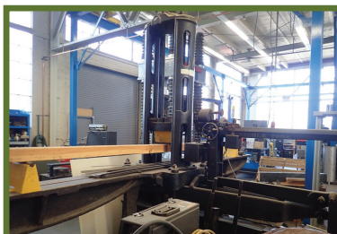
RIEHLE BROS NO.3