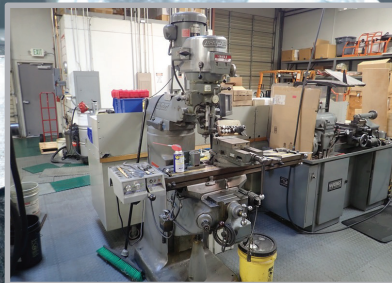
BRIDGEPORT SERIES I