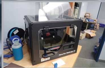
MAKERBOT REPLICATYOR 2X