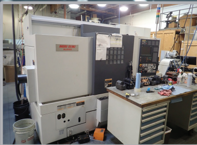
2008 MORI SEIKI NL2500SY/700