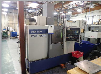
MORI SEIKI MV-40M