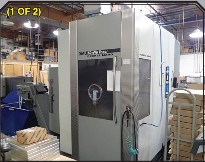
2005 DMG DECKEL MAHO