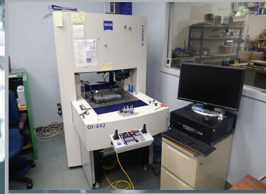
ZEISS O-INSPECT IO-442