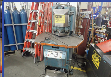
AMADA CSH-220 23 TON CORNER NOTCHER