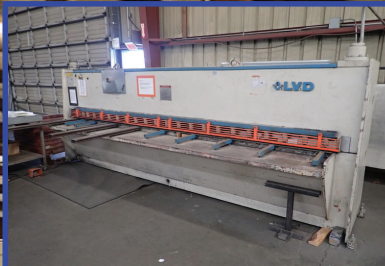
LVD JS 25/13 1/4"X13' HYDRAULIC SHEAR