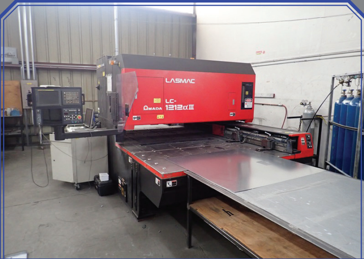
2004 AMADA LC-1212A3 2,000 WATT CNC LASER