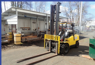
HYSTER H110XM 11,000LB CAP. FORKLIFT