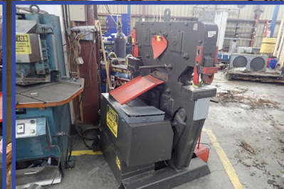
EDWARDS JAWS IV 100 TON IRONWORKER