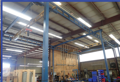
GORBEL 28'X50'X20' BOLT TOGETHER CRANE