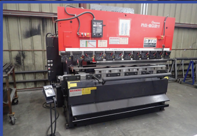
1999 AMADA RG-8024LD 94"X80 TON CNC PRESS BRAKE