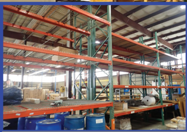
(9) SECTIONS OF PALLET RACKING