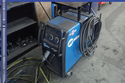
MILLER MILLERMATIC 252