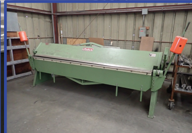
2006 SABER V-1014 18"X10' MANUAL LEAF BRAKE