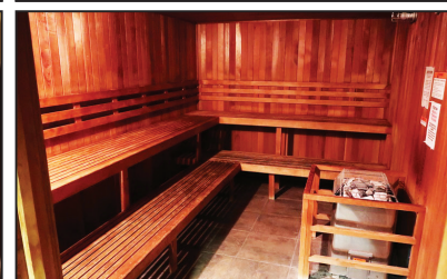
(2) HARVIA DRY SAUNAS