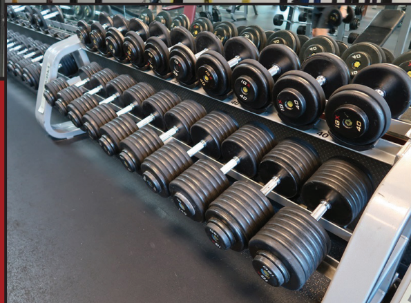
PRECOR IGX 5LB - 150LB DUMBBELLS W/RACKS