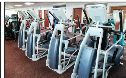
(7) PRECOR EFX 885/883/835/833/815/813