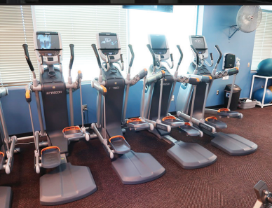
(5) PRECOR AMT 885/845/843/833/823