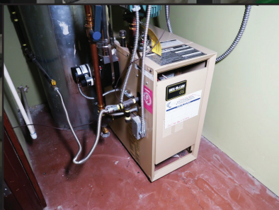
WEIL MCLAIN GOLD CGI