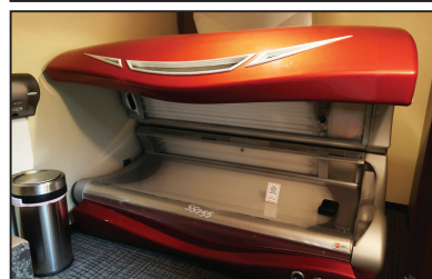
STAYTAN SS 755