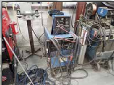
MILLER SYNCROWAVE 250