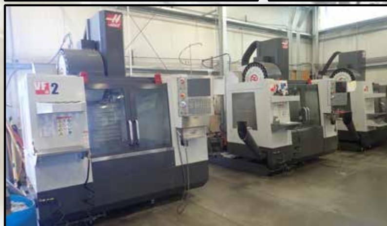
(3) 2016 HAAS VF-2