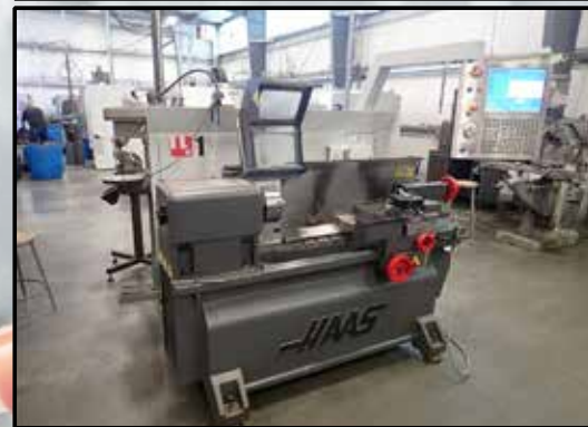
2011 HAAS TL-1