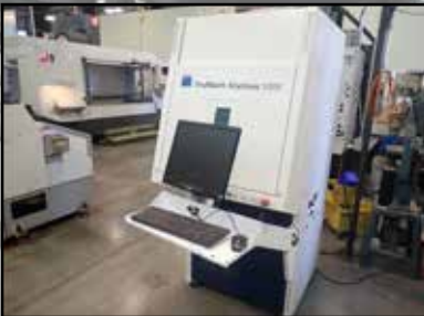
2011 TRUMPF TRUMARK STATION 5000