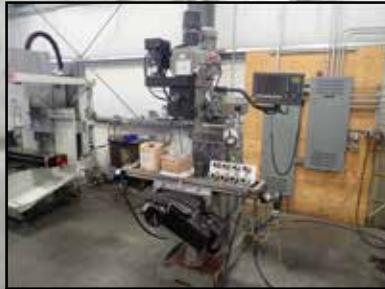
2009 SHARP TMV-1