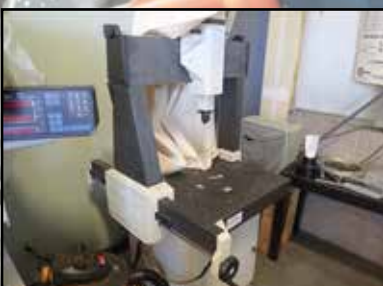
STARRETT HGC 2024-16