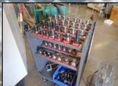
(200+) CAT 40

FOR MORE INFORMATION GO TO MURPHYAUCTION.COM • PHONE 425.486.1246