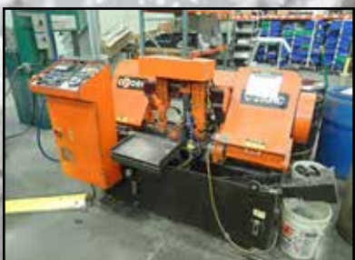
2005 COSEN C-250NC