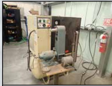
INGERSOLL RAND UP6-10TAS-125

COLLETS, END MILLS, DRILLS, TAPS AND MUCH MORE!