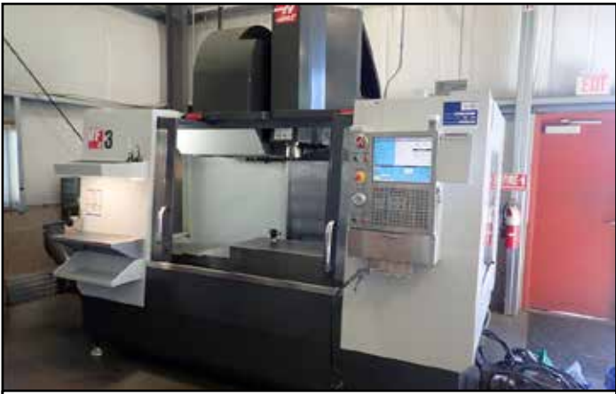
2012 HAAS VF-3