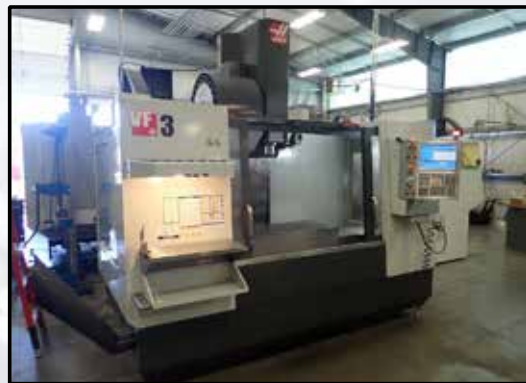
2011 HAAS VF-3