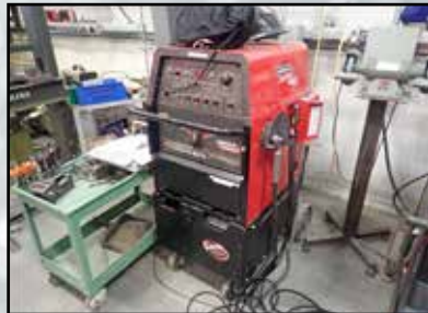
LINCOLN PRECISION TIG 375