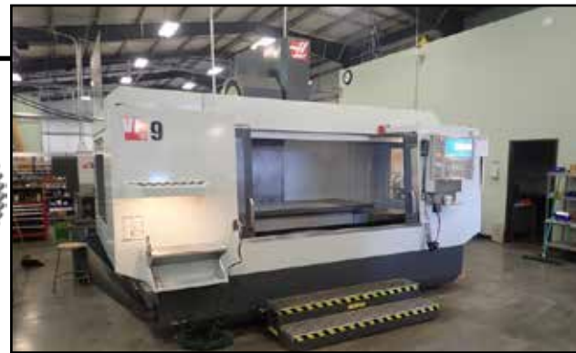
2014 HAAS VF-9/40