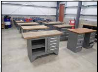
(12+) MACHINISTS BENCHES