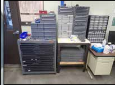
END MILLS, DRILLS & TAPS