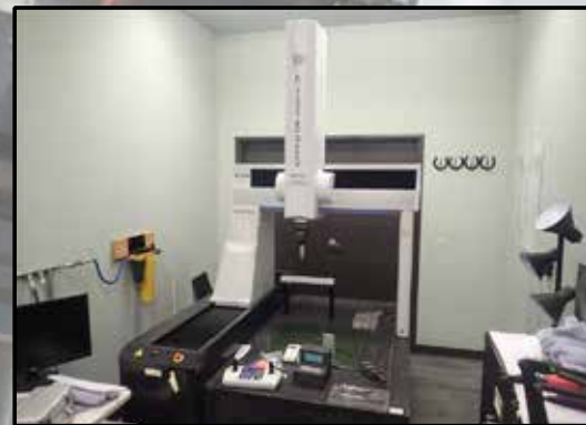
2015 MITUTOYO CRYSTA-APX S7106