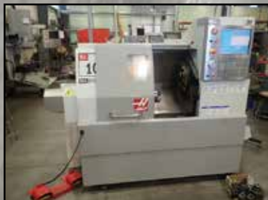
2010 HAAS SL-10