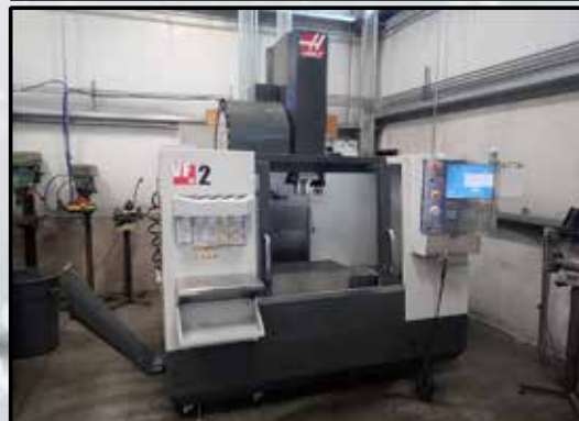
2010 HAAS VF-2