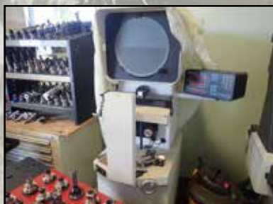
2017 MICRO-VU SPECTRA M1030432