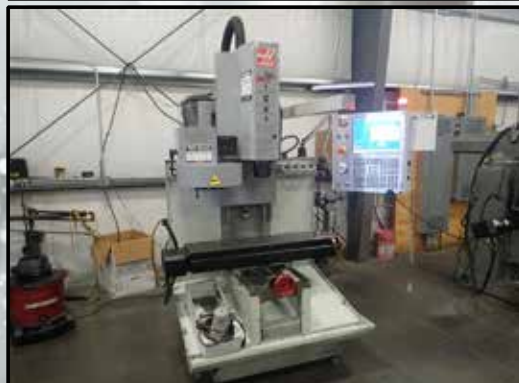
2007 HAAS TM-1