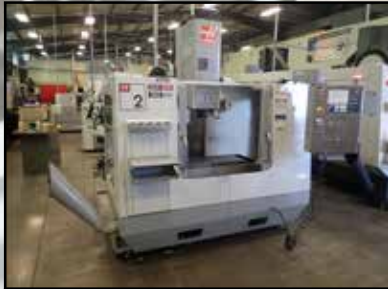
2007 HAAS VF-2D