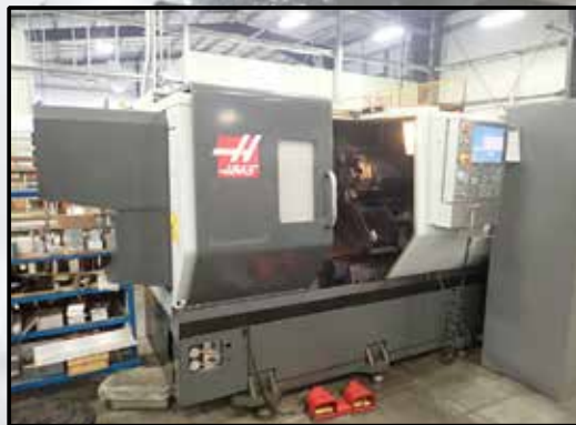
2012 HAAS ST-30