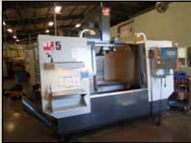
2010 HAAS VF-5/40