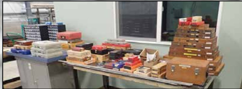
GAUGES, BLOCKS, MICS & ASSORTED INSPECTION TOOLS