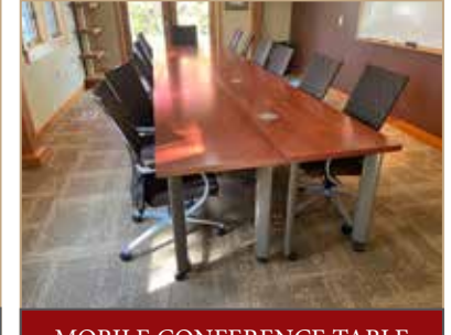
MOBILE CONFERENCE TABLE