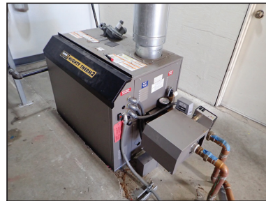
LAARS MIGHTY THERM2