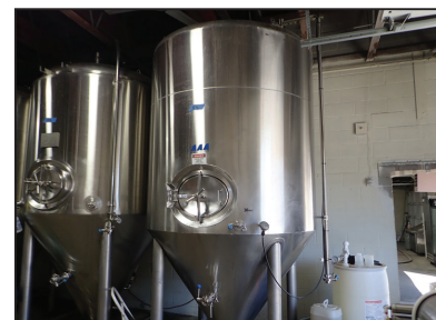
AAA METAL FAB

MURPHYAUCTION.COM FOR ADDITIONAL INFORMATION