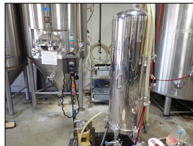
2010 PALL SUPRADISC WSFZ164