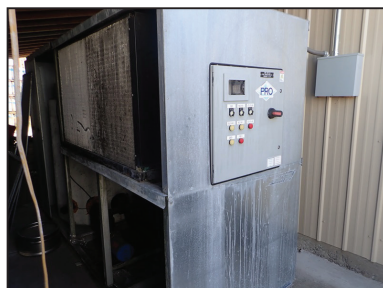
2012 PRO REFRIGERATION PM110F3R4250-A-VC