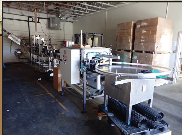
CASK BREWING SYSTEMS AUTOMATED CANNING LINE