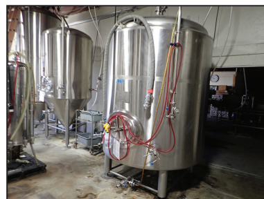
PACIFIC BREWERY SYSTEMS

PLEASE SEE AUCTION CATALOG FOR COMPLETE TERMS AND CONDITIONS