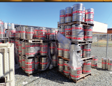
APPROX. (260) 1/2 BBL KEGS