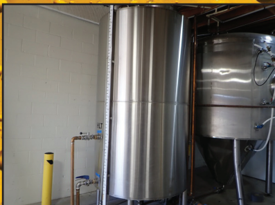
30 BBL S/S JACKETED VERTICAL HLT