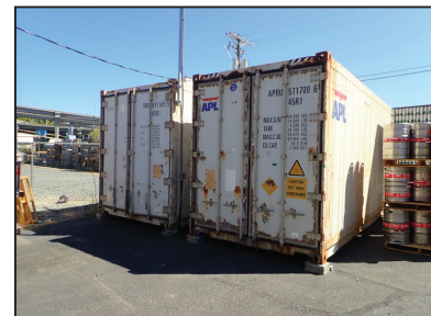
(2) 40' REFRIGERATED CONTAINERS