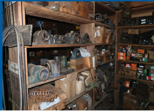
MILL STORES (MAURY RIVER LOCATION)