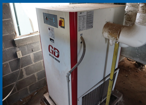
GARDNER DENVER RNC750A4 (MAURY RIVER LOCATION)