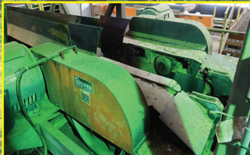
COOPER (SCRAGG) TWIN CIRCLE SAW HEAD RIG