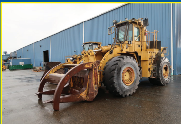
1994 CAT 980F