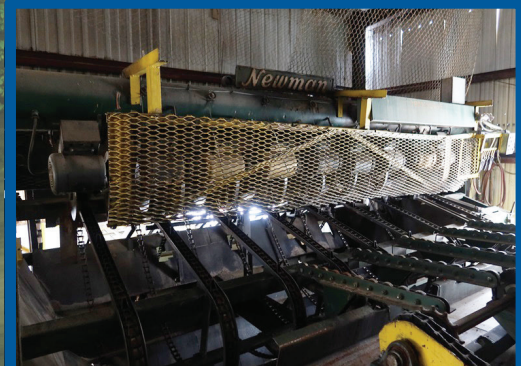
NEWMAN 16' TRIM SAW (MAURY RIVER LOCATION)