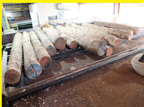
30'X12' 4-STRAND INFEED DECK (FRAMETOWN LOCATION)