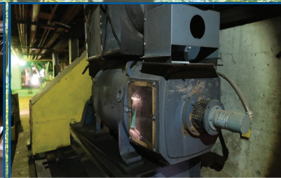
300HP MOTOR TO HEADRIG