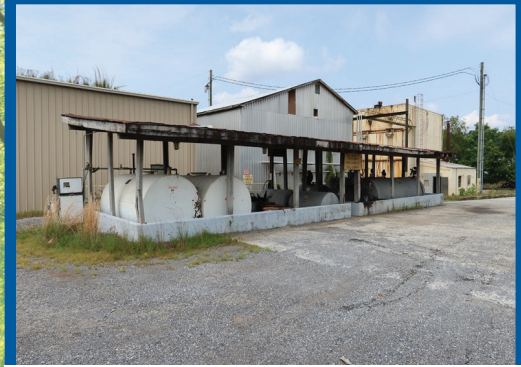
FUEL & OIL TANKS (MAURY RIVER LOCATION)