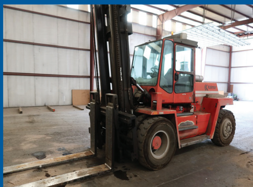
1998 KALMAR DCD 100-6XL (MAURY RIVER LOCATION)