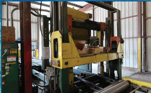
SIGNODE M22MP44 STRAPPING MACHINE