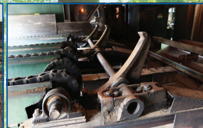
3-ARM LOG SINGULATOR