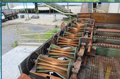
3'X20' HOURGLASS ROLLS