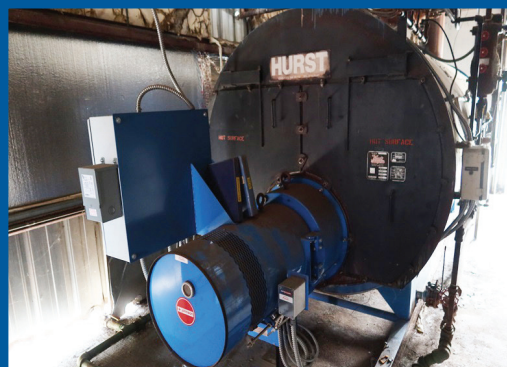
1994 HURST 54-G-250-150 (MAURY RIVER LOCATION)