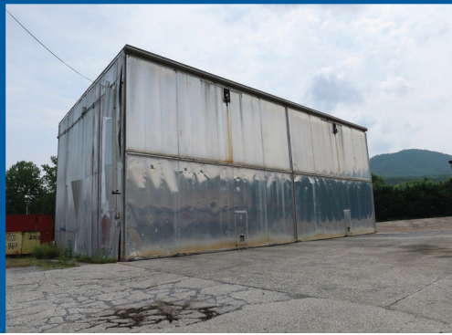
40'X80' SIDE LOAD ALUMINUM KILNS (MAURY RIVER LOCATION)