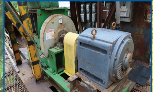
NEWMAN 150 HP HOG