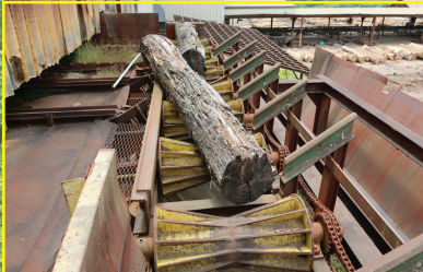
20'X36" HOURGLASS ROLLCASE