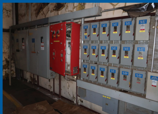
KILN CONTROLS & ELECTRICS (MAURY RIVER LOCATION)