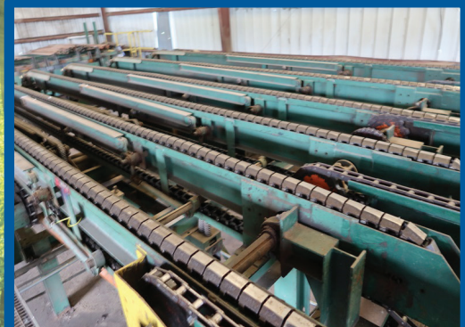
20'X12' STACKER INFEED (MAURY RIVER LOCATION)