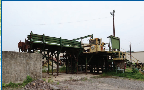
INFEEED LOG DECK WITH FULGUM F1 DEBARKER, CAB, DRIVES & ELECTRICS