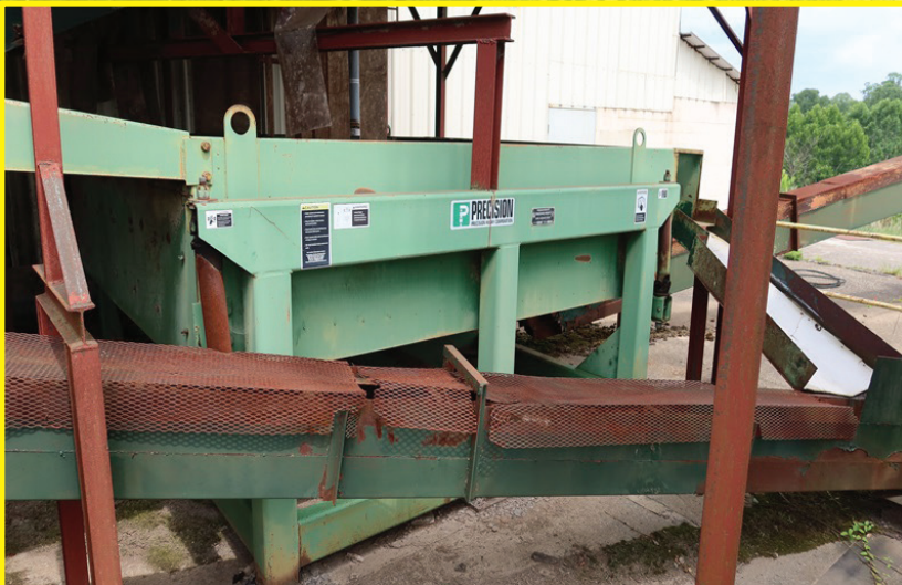
PRECISION 10'X10' CHIP SCREEN (FRAMETOWN LOCATION)