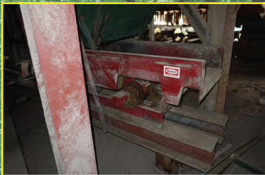
MALLOTT 20'X24" VIBRATORY CONVEYOR