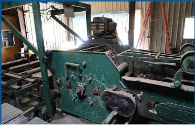
COOK CLINTON INC.