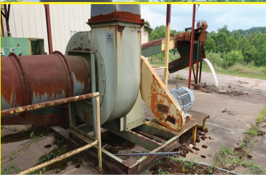
1994 KROGER 75HP BLOWER