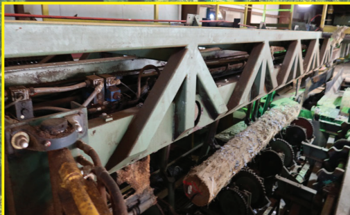
END-DOGGING SYSTEM OVERHEAD LOG CARRIAGE