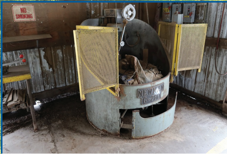
NEWMAN G-280 ROTARY KNIFE GRINDER