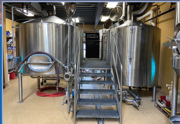
2012 JVNW BREWHOUSE 3-VESSEL, 20BBL BREWHOUSE