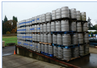
(408) FULL SIZE KEGS