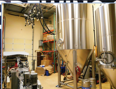
2015 MARK 80BBL UNITANK