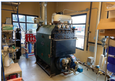
2012 COLUMBIA BOILER MHP-40

MICRO MATIC MMP 4301-EP AIR-COOLED PRO-LINE DRAFT BEER GLYCOL CHILLER, 1/3 HP, 115V, S/N: C133354 CUSTOMBUILT APPROX. 55 GAL PORTABLE GLYCOL HEATER W/VALVES & RECIRCULATION PUMP