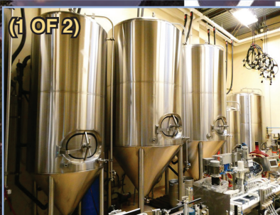
40BBL S.S FERMENTER TANK