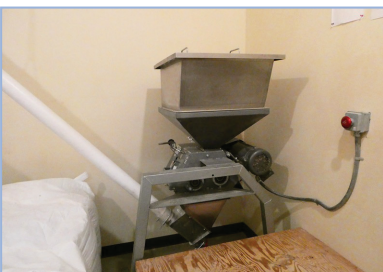
2012 ENGL 21NI-40-18