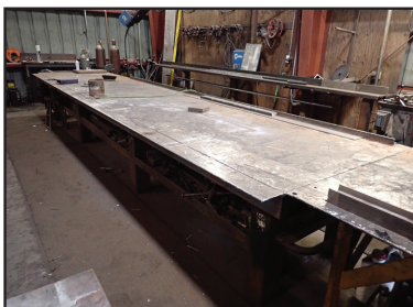
ASSORTED STEEL FAB TABLES