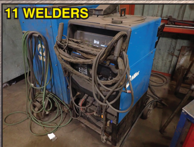
11 WELDERS MILLER SYNCROWAVE 250DX