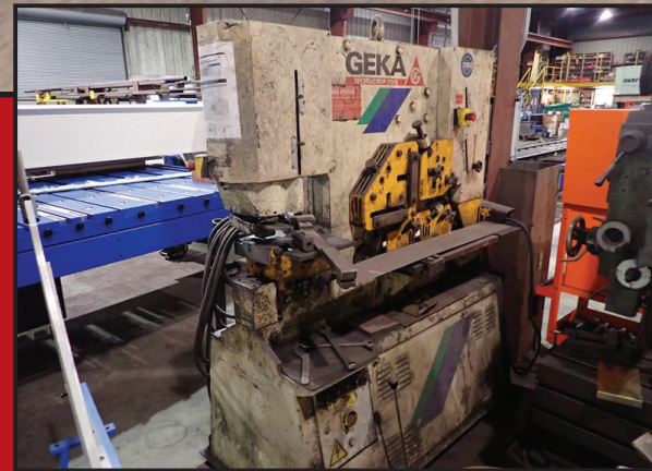
GEKA HYDRACROP 80/S