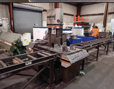
MARVEL SERIES 8-MARK-II