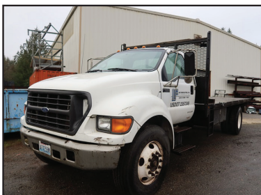
2001 FORD F650 SD