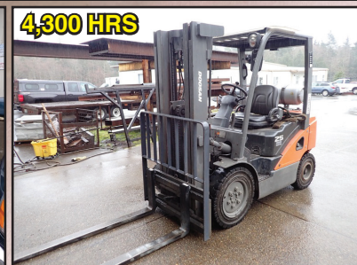
4,300 HRS DOOSAN G25P-7