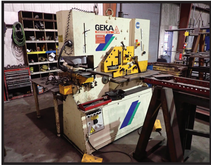
GEKA HYDRACROP 110/A

6362 NW WAREHOUSE WAY, SILVERDALE, WA 98383