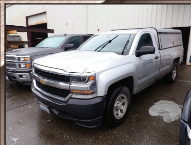
2016 CHEVROLET SILVERADO 1500