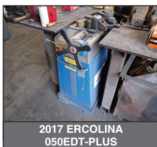
2017 ERCOLINA 050EDT-PLUS

52"X20" STEEL FAB TABLE 48"X120" STEEL FAB TABLE 48"X75" STEEL FAB TABLE 49"X121" STEEL FAB TABLE