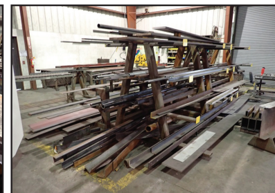
ASSORTED STEEL INVENTORY