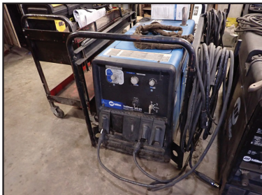
MILLER TRAILBLAZER 325 EFI

VICTOR VMC100 TRACK TORCH W/54"X128" STEEL FAB TABLE ALMI PIPE & TUBE NOTCHER RIDGID 535 PIPE MACHINE ENCO DSR-750S RADIAL ARM DRILL POWERMATIC 1200 DRILL PRESS ON CASTERS ENCO 131-2014 MITERING CUT OFF SAW WITH IN/OUTFEED HILTI 2-STAGE PORTABLE AIR COMPRESSOR, HONDA 11 HP (12) RIDGID UNIVERSAL DIES CUT OFF SAW W/TABLE ASSORTED PIPE ANGLE INVENTORY, FLAT BAR, PIPE & TUBE STEEL INVENTORY, STEEL A-FRAME RACK, SHEET GOODS RACK W/ASSORTED STEEL PLATE INVENTORY, (20) STEEL SAW HORSES, (5) STEEL CART RACKS, STEEL I-BEAM, TUBE, UNDER BRIDGE/DOCK MAN BASKETS, SANDBLAST POT, BANDING CART, MAG DRILL W/BITS, CABINET W/WELDING SUPPLIES, OXY/ACETYLENE SET, 6" BELT GRINDER, 4" BELT GRINDER/NOTCHER AND MUCH MORE!