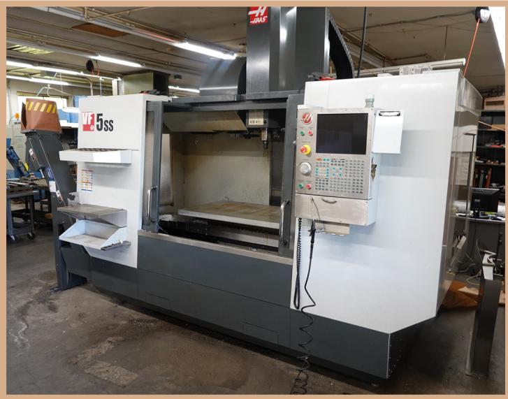
2012 HAAS VF-5SS

14816 ROOSEVELT ROAD, SNOHOMISH, WA 98290