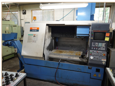
1997 MAZAK FJV-25