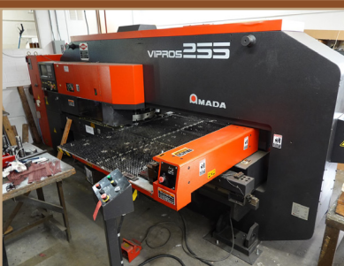
AMADA VIPROS 255