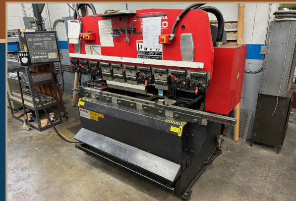
1997 AMADA 50