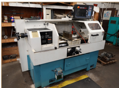
TRAK TRL 1630SX