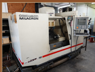
CINCINNATI MILACRON ARROW 750