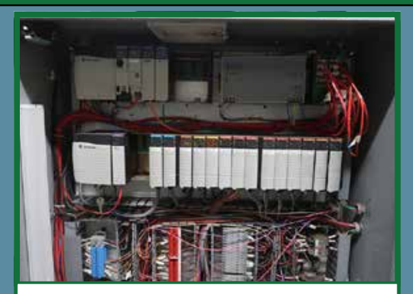
2020 ALLEN BRADLEY LOGIX 5572