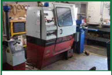
WM TALON TF2

(4) WELLONS APPROX. 32'X64' DOUBLE TRACK STEAM FIRED ALUMINUM KILNS W/60" ALUMINUM FANS, 4" KILN PIPE, (10) YASKAWA DRIVES, (7) VENTS, CONTROLS HOUSE, APPROX. 2,560' OF RAIL, (125) APPROX. 96"X108" BOX TUBE KILN CARTS, 6' SPACING, (112) APPROX.48"X108" BOX TUBE KILN CARTS, 6' SPACING AND MUCH MORE!