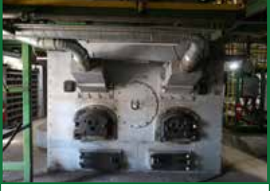
1981 INDUSTRIAL BOILER 3-5000