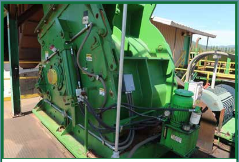
2019 REBUILT VKB4848