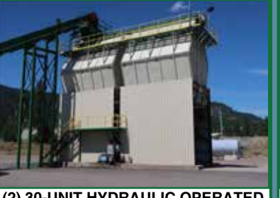
(2) 30-UNIT HYDRAULIC OPERATED SHAVINGS BINS