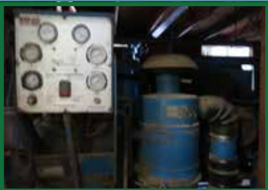
1990 QNW 360D-1