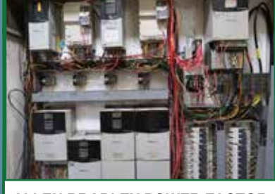
ALLEN BRADLEY POWER FACTOR