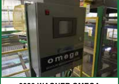
2020 WAGNER OMEGA