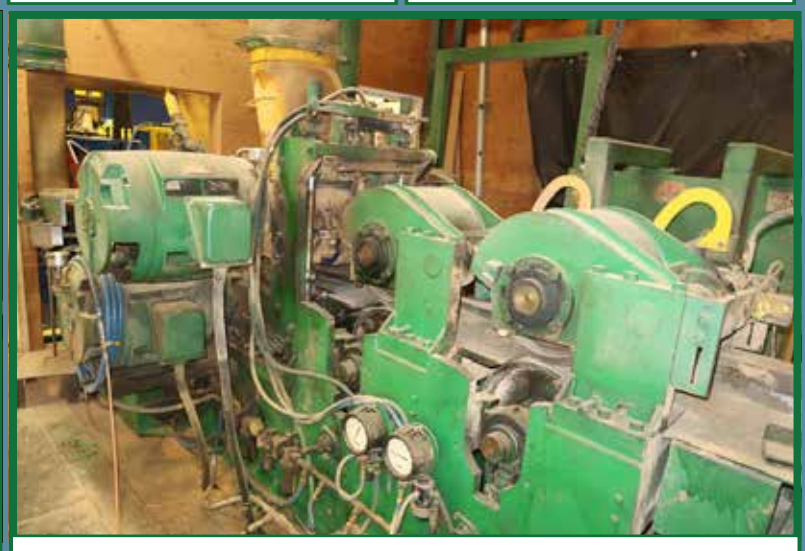
2011 COASTAL MACHINERY