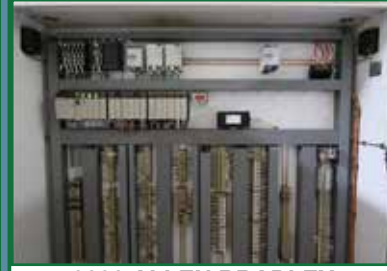
2020 ALLEN BRADLEY LOGIX 5561