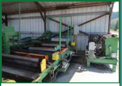
SIMPLE SIMON TYPE