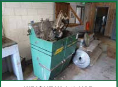
WRIGHT W-150 HAD