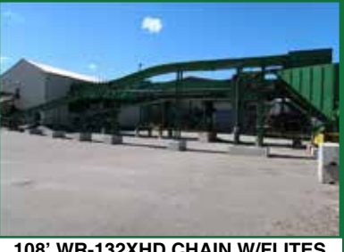
108' WR-132XHD CHAIN W/FLITES CONVEYOR