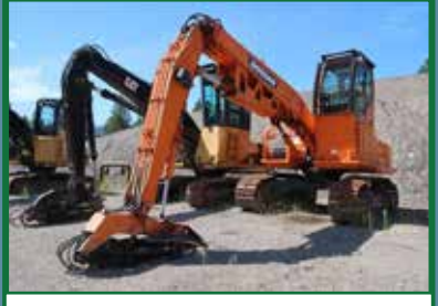
2013 DOOSAN D225L