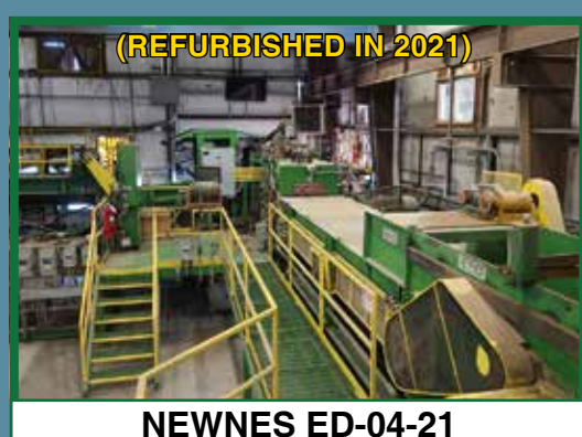
Day 2 Oct. 11 - 18: Planer Mill, Boiler, Kilns, Electrics & Stores