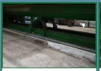
VIBRA PRO HSR-181200DS-1/4(MS)