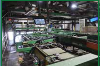
PSS LS19 SIMPLE SIMON