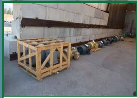
LARGE QUANTITY OF SPARE DRIVES & SPARE MOTORS