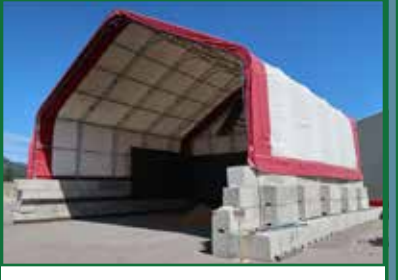
50'X50' ARCTIC SHELTER TENT