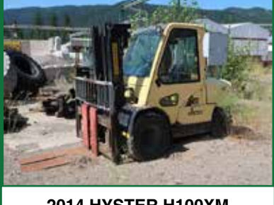
2014 HYSTER H100XM