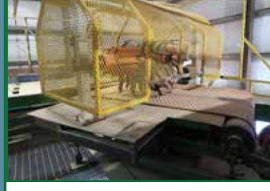
5'X8' PLANER SLOW DOWN BELT