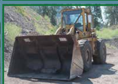
1973 CAT 966C