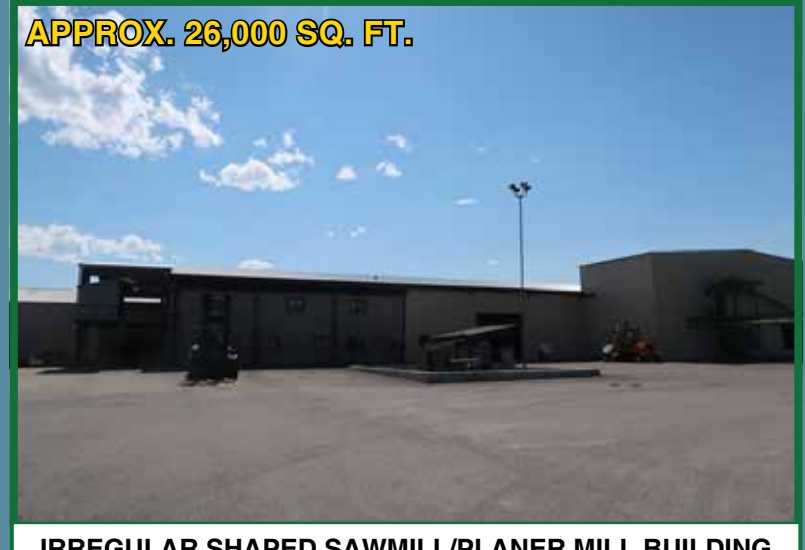
IRREGULAR SHAPED SAWMILL/PLANER MILL BUILDING