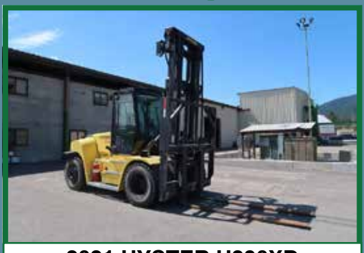
2021 HYSTER H230XD