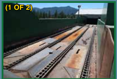
42' 4-STRAND WR-124 CHAIN LOG TRANSFER