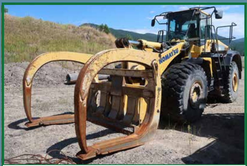
2015 KOMATSU WA500-7