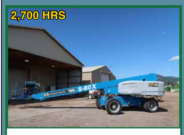
2015 GENIE S80