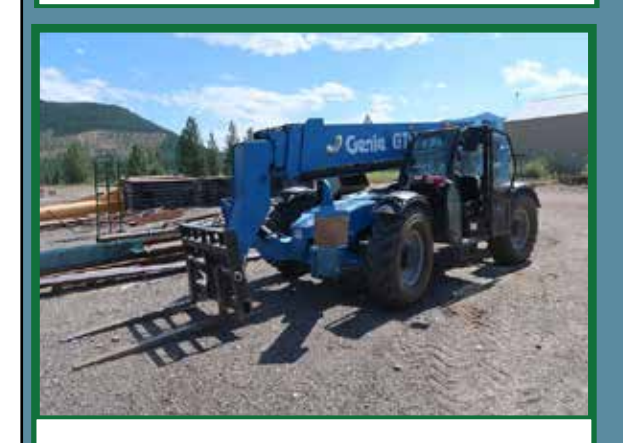
2016 GENIE GTH-1056