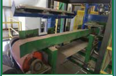
17"X6' OUTFEED BELT