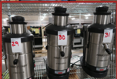
ROBOT COUPE J100