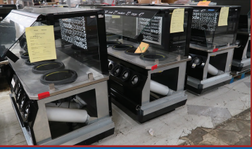
(3) HUSSMAN IM-05-ESS-PM