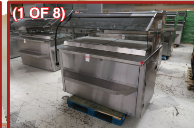
ATLANTIC FOODS MHFC6044-BP3