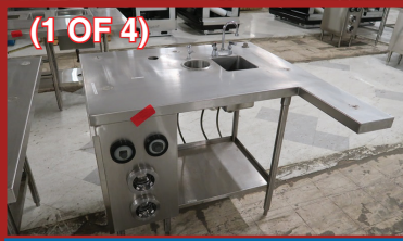
47"X34"X36" SS TABLE