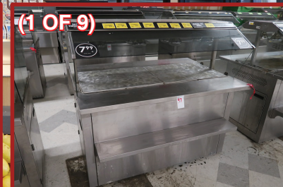
ATLANTIC FOODS MHFC6044-BP1