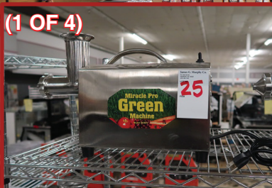
MIRACLE PRO MJ575