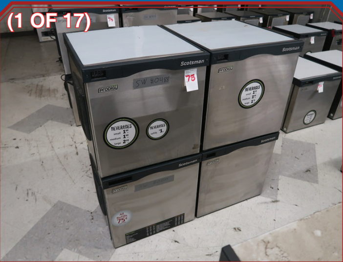
(4) SCOTSMAN PRODIGY C0522SA-1A