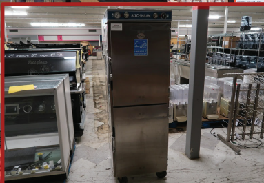
ALTO SHAAM 1200 UP