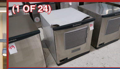
SCOTSMAN C0522 SA-1A