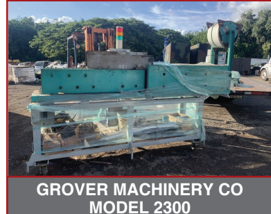
ADDITIONAL ITEMS ADDED DAILY!

James G. Murphy Co. 425.486.1246 murphyauction.com