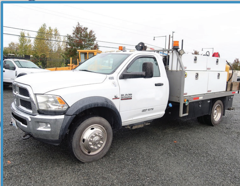
2014 RAM 5500