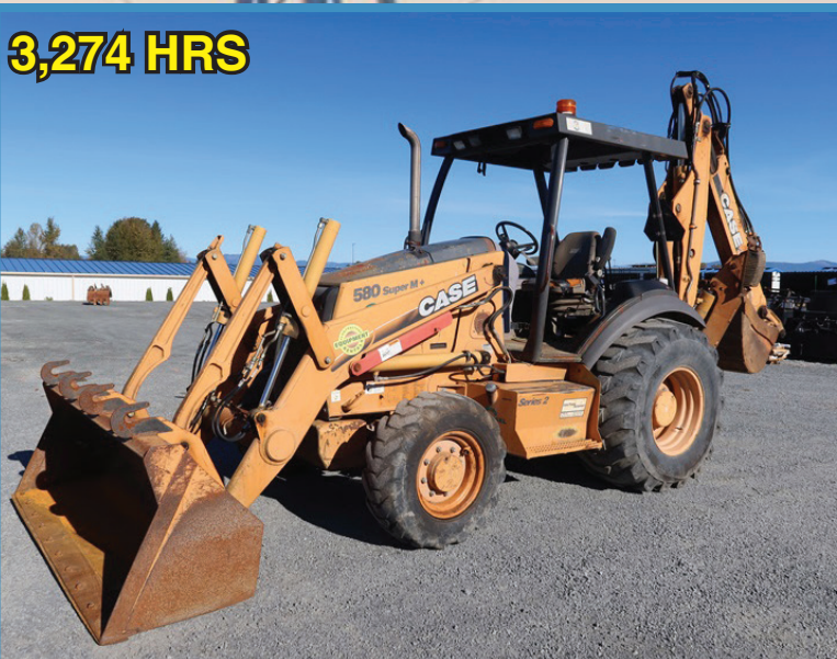
2004 CASE 580 SUPER M+