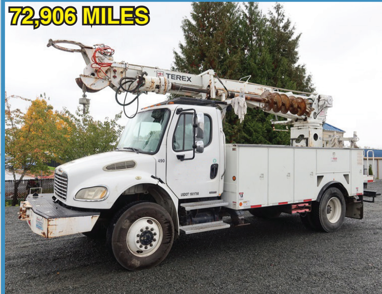
2007 FREIGHTLINER M3 BUSINESS CLASS