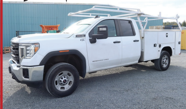
2021 GMC 2500HD