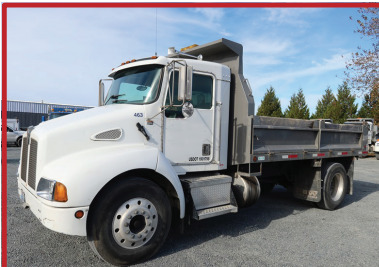
2001 KENWORTH T300