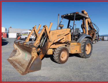
2000 CASE 580 SUPER L