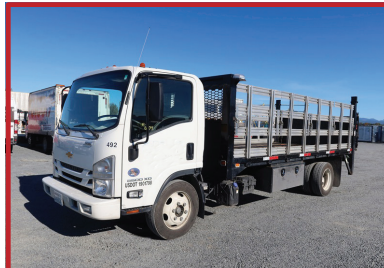
2020 CHEVROLET 5500XD