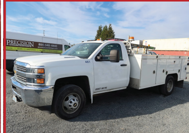
2015 CHEVROLET 3500