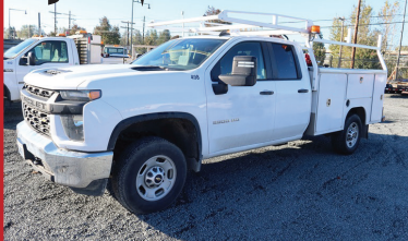
2022 CHEV 2500HD