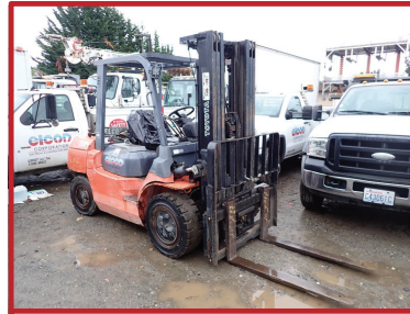
2006 TOYOTA 7FDU35