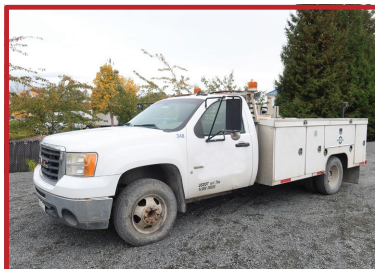
2008 GMC 3500