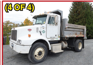
2003 PETERBILT 330