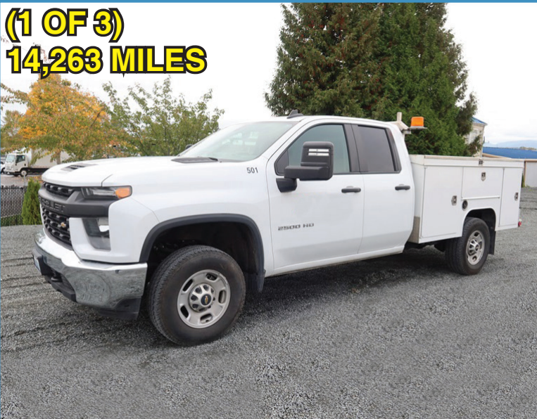
2022 CHEVROLET 2500HD