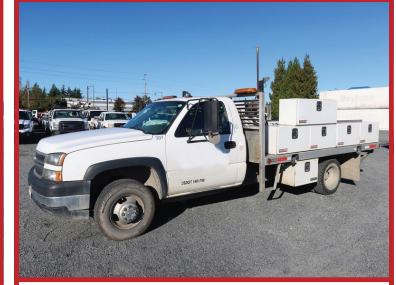
2006 CHEV 3500