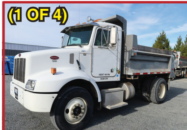
2003 PETERBILT 330