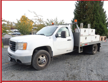
2008 GMC 3500