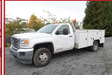
2015 GMC 3500