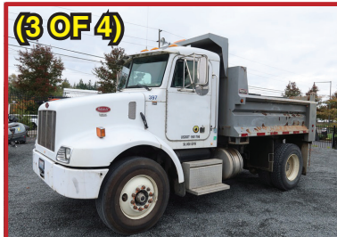
2003 PETERBILT 330