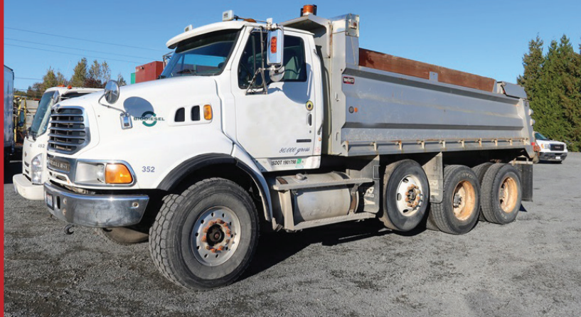
2006 & 2007 STERLING L9500