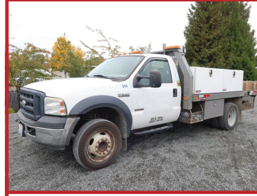
2006 FORD F550