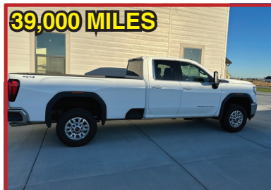
2022 GMC SIERRA SLE