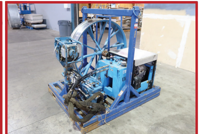
GAS WIRE TUGGER