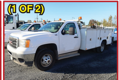
2012 GMC 3500