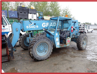
1997 GRADALL 534C-9