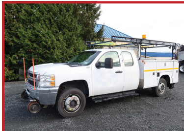
2012 CHEV 3500