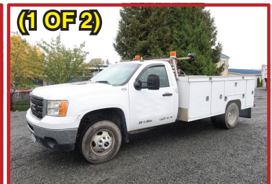
2011 GMC 3500