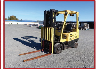
2015 HYSTER S50FT