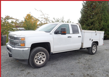
2018 CHEV 2500