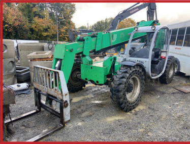
2007 GENIE GTH-644