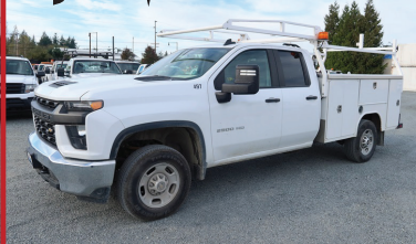
2022 CHEV 2500HD