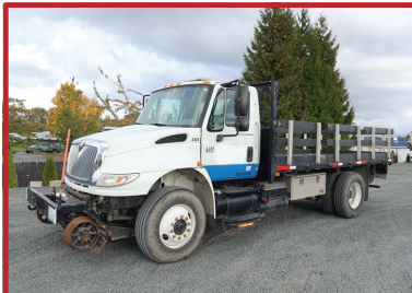
2007 INTERNATIONAL 4400