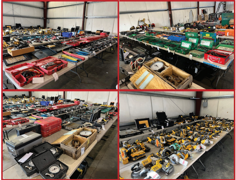
LARGE ASSORTMENT OF TOOLS