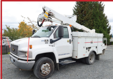
2006 CHEV C5500

2003 PETERBILT 330 SINGLE AXLE DUMP TRUCK, CAT 3126E DIESEL, 10' STEEL BOX, ODOMETER READS: 166,872, S/N: 2XPNA7X43M807317