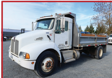
2002 KENWORTH T300