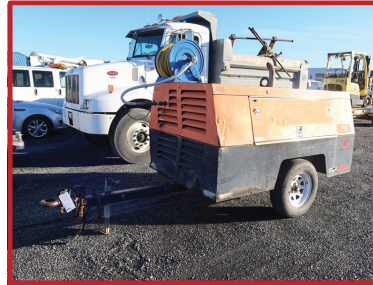
SULLIVAN PALATEK 211