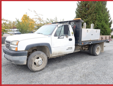
2005 CHEV 3500