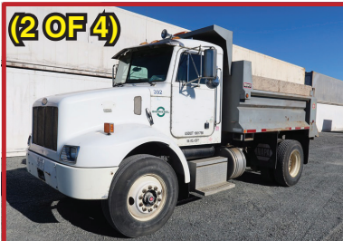
2003 PETERBILT 330