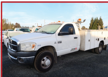
2007 DODGE RAM 3500