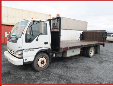
2007 ISUZU NQR