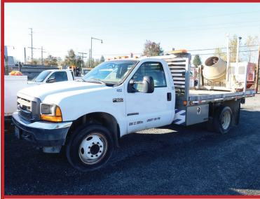
2001 FORD F550