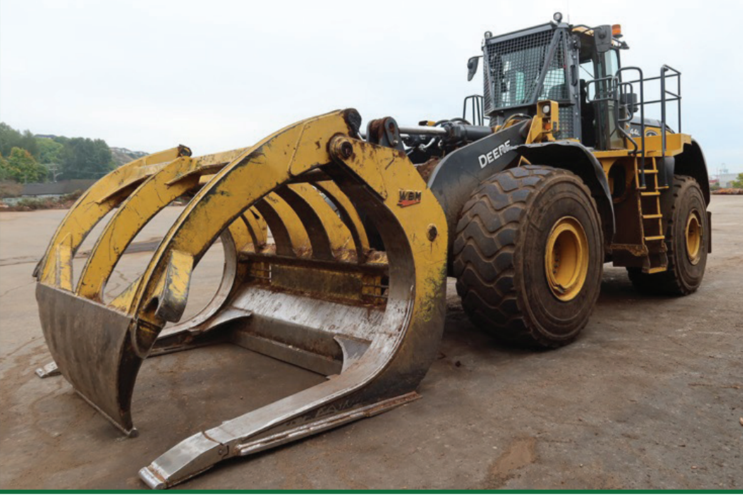
2019 JOHN DEERE 844L