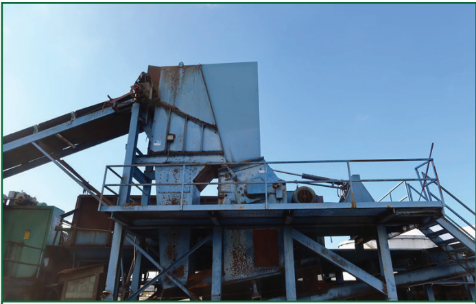
KIMWOOD 36\"X48\" HOG