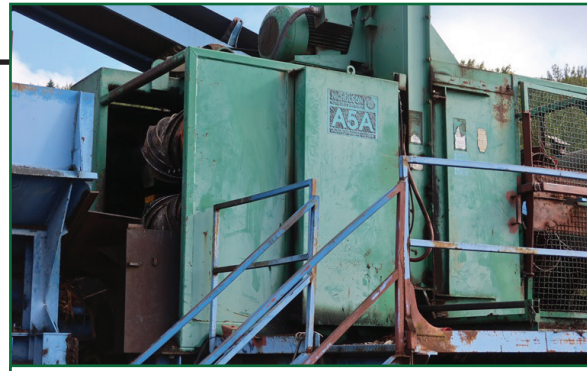
NICHOLSON #27 A5A RH 6-ARM DEBARKER