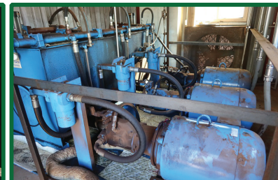
3X75HP HYDRAULIC UNIT