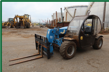
2016 GENIE GTH5519

APPROX. 150' DUAL CHAIN HYDRAULIC DRIVE OUT FEED LOG HAUL, SUPPORT STRUCTURE TO THE GROUND APPROX. 2'X100' SMOOTH CLEAN OUT BELTING W/HEAD & TAIL SHAFT & DRIVE BIN BELT APPROX. 165'X42" WIDE CHEVRON BELT, INCLINE COVERED BELT CONVEYOR, COUNTER BALANCED W/DRIVE APPROX. 70'X42" SMOOTH CONVEYOR BELT W/DRIVE APPROX. 250' DUAL BOX CHAIN INFEED LOG HAUL, SUPPORT STRUCTURE TO THE GROUND, STEEL PLATE BUMP WALL, ATTACHED SLIDESTEEL APPROX. 130'X36" SMOOTH CLEAN OUT CONVEYOR BELTING, HEAD & TAIL SHAFT, MOTOR TO DRIVE APPROX. 3'X16' DUAL CHAIN INFEED HOPPER W/MOTOR & DRIVE APPROX. 7'X7' CROSS OVER INCLINE CHAIN W/DRIVE APPROX. 60'X40" INCLINE CHEVRON FEED CONVEYOR W/DRIVE HOG BELT APPROX. 292'X36" WIDE SMOOTH BELT INCLINE COVERED CONVEYOR, COUNTER BALANCED, SUPPORT STRUCTURE, DRIVE APPROX. 40'X32" INFEED LOG HAUL, (2) HYDRAULIC VERTICAL FEED ROLL, HYDRAULIC HORIZONTAL FEED ROLLS, SUPPORT STRUCTURE TO THE GROUND APPROX. 45'X4' INCLINE CHIP CHAIN W/DRIVE & SUPPORT STRUCTURE APPROX. 70'X42" INCLINE SMOOTH BELT CONVEYOR W/DRIVE & SUPPORT