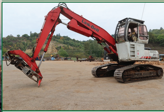
2008 LINK-BELT 240LX