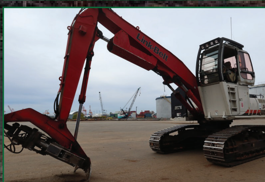
2007 LINK-BELT 240LX