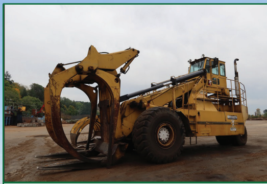
1996 WAGNER LUMBER JACK LOG STACKER L80F