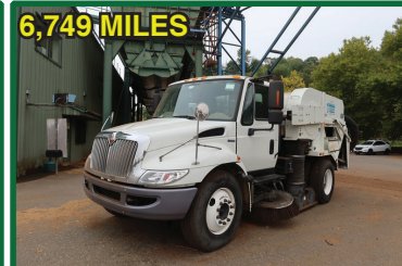
2010 INTERNATIONAL DURA STAR