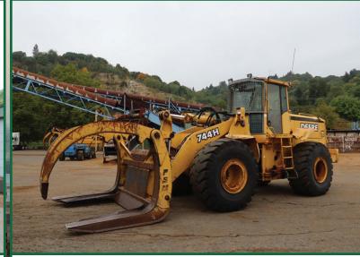
2000 JOHN DEERE 744H

FOR MORE INFORMATION GO TO MURPHYAUCTION.COM • PHONE 425.486.1246