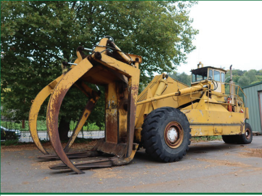
RAYGO WAGNER C-90