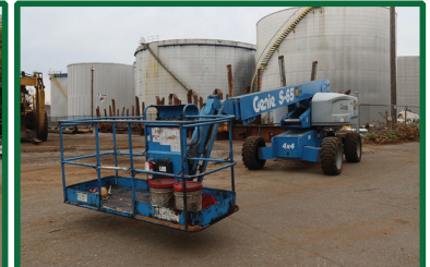
2014 GENIE S-65