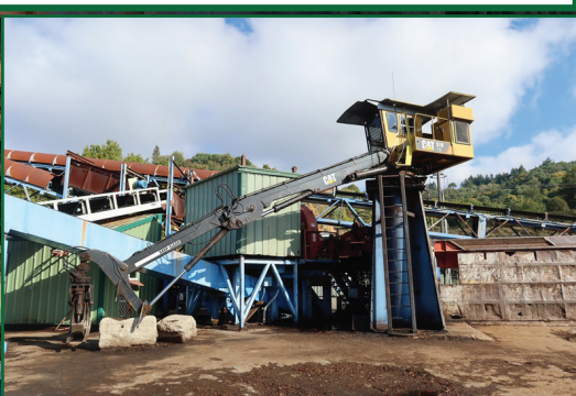
2009 CATERPILLAR 519