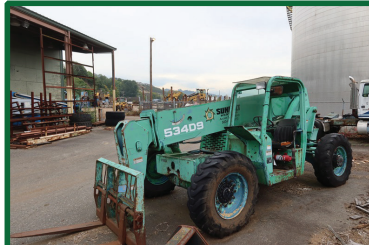
1998 GRADALL 534D9