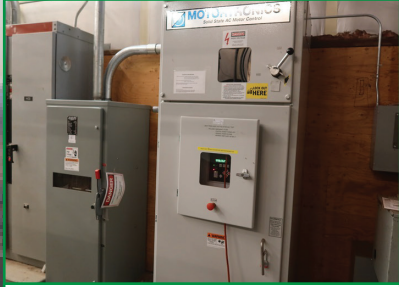
2023 MOTORTRONICS INC MVC4-41200-ESWG 4 SERIES