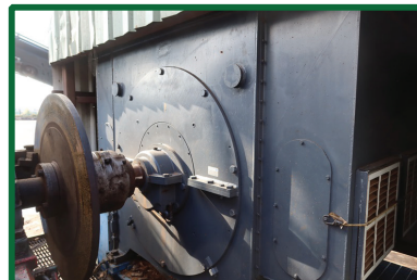
ELLIOT 1,000 HP DRIVE