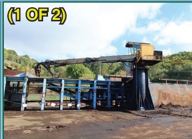
HUSKY BRUTE XL235 SERIES