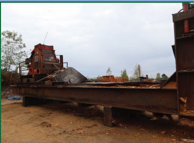
200-TON LOG SPLITTER