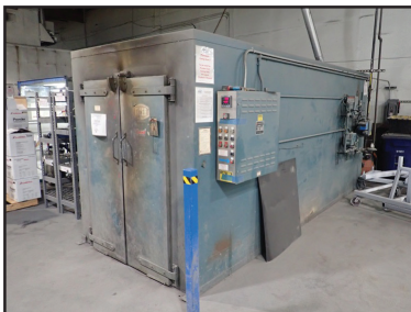
GRIEVE SPECIAL WALK-IN