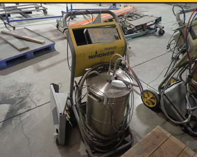
2011 WAGNER PRIMA SPRINT (DCI)

PUBLIC ONLINE AUCTION - NO MINIMUM - NO RESERVE