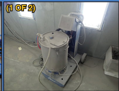
NORDSON ENCORE LT