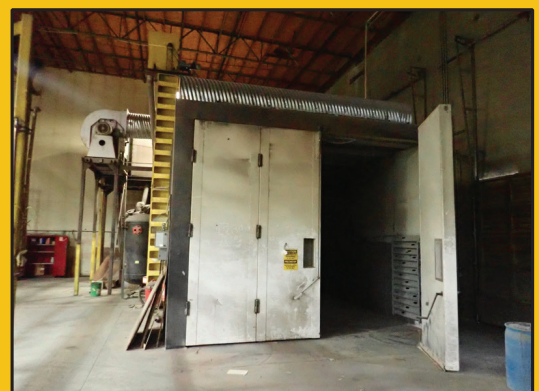
15'X30'X12' SANDBLAST BOOTH (DCI)