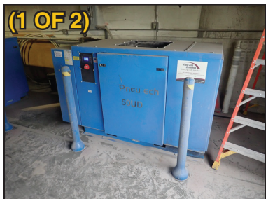
(1 OF 2) 2015 SULLIVAN PALATEK PNEUTECH 50UD

SAW HORSES, FORKLIFT BOOM ATTACHMENT, LADDERS, CARTS, RACKS, FANS, BLASTING SUPPLIES, WORKBENCH, CABINETS, FORK EXTENSIONS, HANGERS, RACKS, SUPPLY CARTS, HAND TOOLS, SHOP SUPPLIES, BLAST CARTS, STACKING RACKS, STEEL FRAMED 3-SIDED ENCLOSURE ON CASTERS, TRASH CANS, SAW HORSES, DRYING RACKS, MAN BASKET, WORK CART, STEEL TABLES, (10) SECTIONS OF PALLET RACKING, PALLET JACKS, FORK EXTENSIONS, PROPANE CAGE, SHIPPING STATION, BANDING CART, SHELVING, WAREHOUSE LADDER, CARTS, BLAST SUITS, LOCKERS & MUCH MORE!