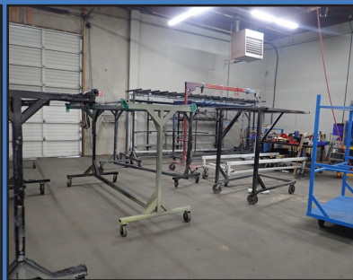
ASSORTED DRYING RACKS