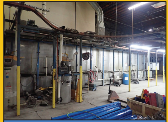
BAKER POWDER COATING LINE (DCI)