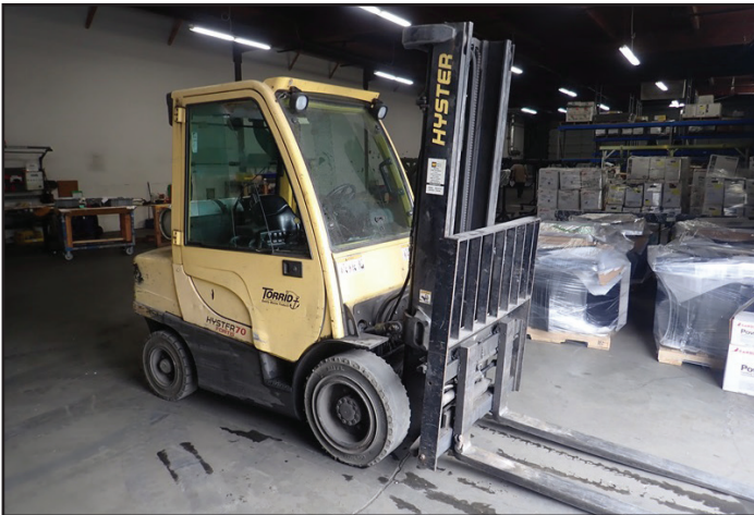
2006 HYSTER H70FT (RMC)