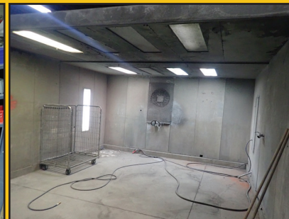
15'X15'X8' WASH/RONSE BOOTH (DCI)

FOR MORE INFORMATION GO TO MURPHYAUCTION.COM • PHONE 425.486.1246