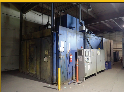
DESPATCH PSC4-18S-E (RMC)