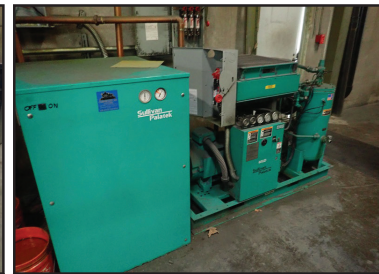
SULLICAN PALATEK 60UD