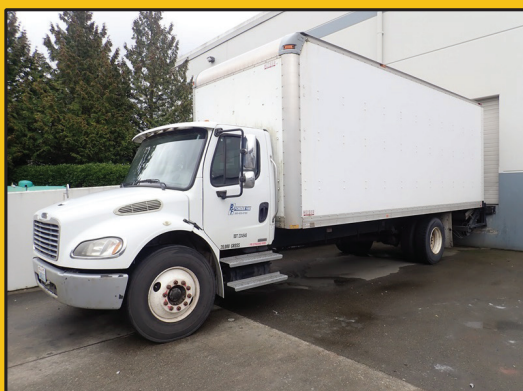
2010 FREIGHTLINER BUSINESS CLASS M2 (DCI)