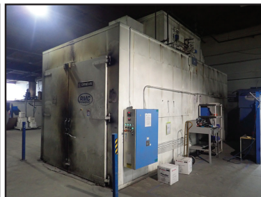
GRIEVE WTC QUAD