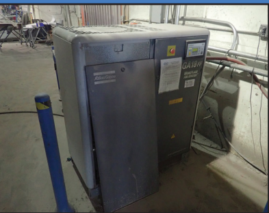
2001 ATLAS COPCO G918