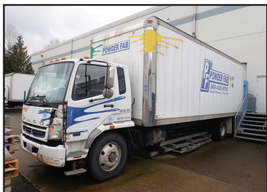
2008 MITSUBISHI FUSO FK260