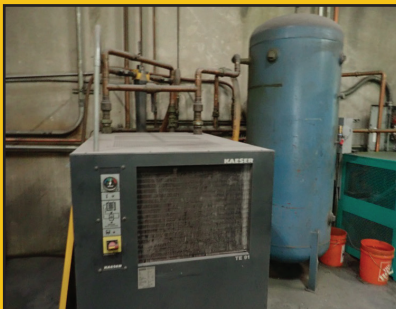
2004 KAESER TE91 (DCI)