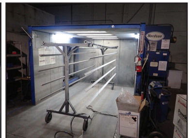
NORDSON VERSA-COAT B