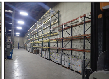
(16) SECTIONS OF PALLET RACKING