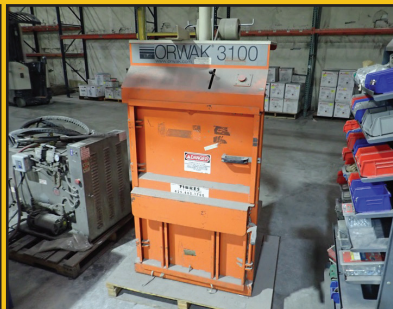
ORWALK 3100 (DCI)