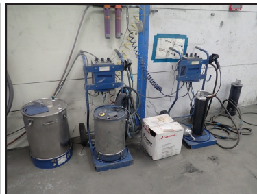
(2) NORDSON VERSA-SPRAY II