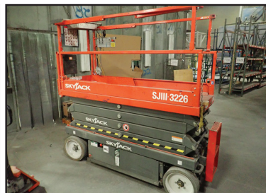
2016 SKY JACK SJ1113226