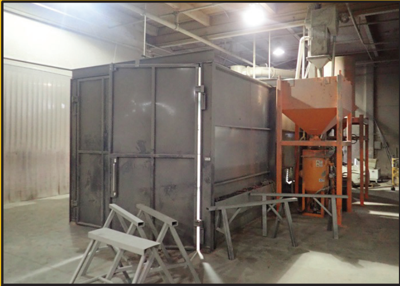
BLAST ONE (RMC)

Powder Coating Equipment Start Date: 10AM | June 1 End Date: 10AM | June 8 Preview: 8AM to 4PM | June 7 Location: 6700 Hardsen Rd. #101, Everett, WA 98203