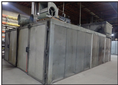
(2) 9'X28'X8' CURING OVENS

ORWALK 3100 PLASTIC WASTE BALER, S/N: 48892 ASSORTED RACKING, PALLET RACKING, PALLET JACKS, (16) SECTIONS OF PALLET RACKING, FLOOR MACHINE, TOOLBOXES, CARTS, SHELVING, NUT/BOLT BINS, MILLER WELDER, JET BANDSAW, STEEL TABLE, DUMP HOPPER, PALLET JACK, SHOP SUPPLIES, SANDBLAST CABINET, DRILL PRESS, OXY/ACETYLENE SET, TOOL ROOM, BANDING CARTS, SHELVING, WAREHOUSE LADDER, DRYING RACKS, PRODUCT RACKS, HANGING RACKS, TABLES AND MUCH MORE!