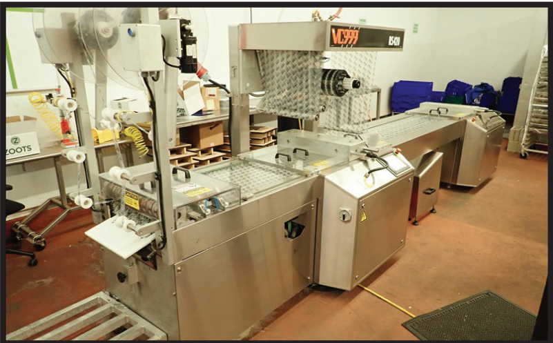
2014 VC999 RS420 ROLLSTOCK THERMOFORMER, MITSUBISHI GOT 1000 DIGITAL TOUCH SCREEN CONTROLS