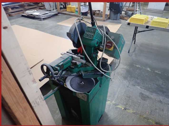
2004 PEDRAZOULI BROWN 250