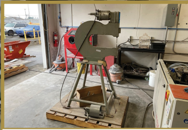
RIVET MAXX 5000