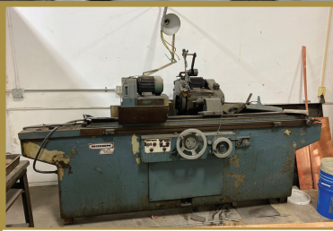
RIBON RUR 1500