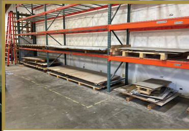
ASSORTED METAL INVENTORY