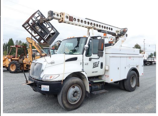
2003 INTERNATIONAL 4200