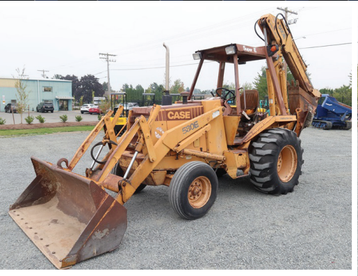
1984 CASE 580E