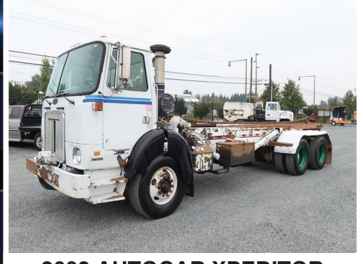
2003 AUTOCAR XPEDITOR