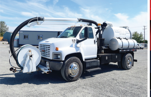
2006 GMC C7500