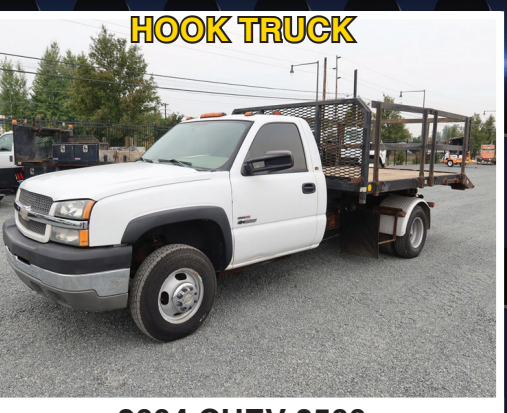
2004 CHEV 3500