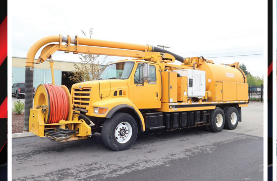
1997 FORD LNT8000