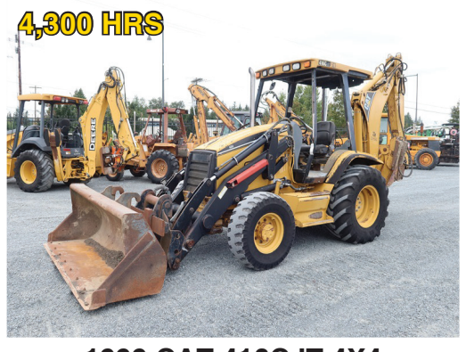
1999 CAT 416C IT 4X4