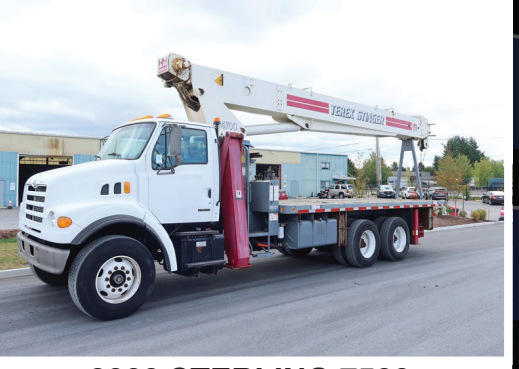
2000 STERLING 7500