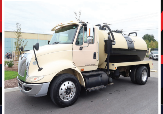
2009 INTERNATIONAL 8600