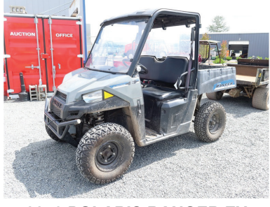
2016 POLARIS RANGER EV