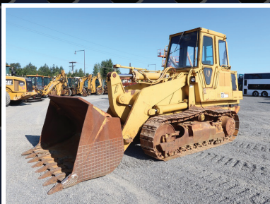
1981 CAT 963