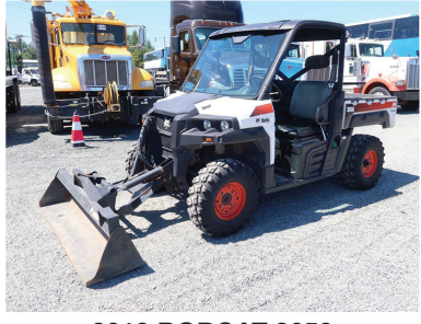
2013 BOBCAT 3650