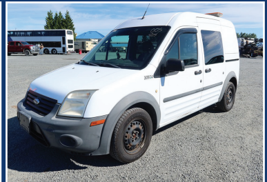
2010 FORD TRANSIT CONNECT