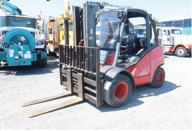
2007 LINDE H50D