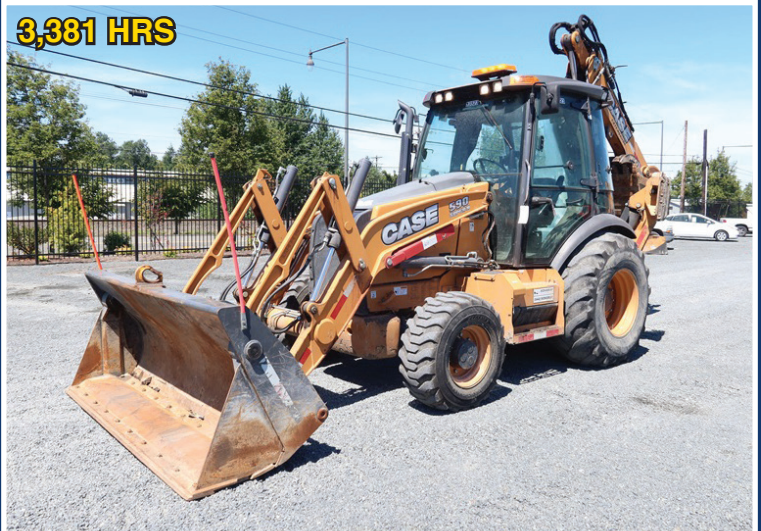
2016 CASE 590 SUPER N 4X4