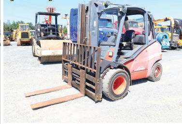
2007 LINDE H50D