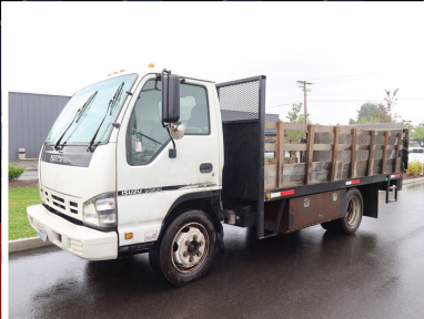
2007 ISUZU NQR