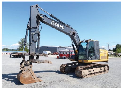
2012 JOHN DEERE 160D LC