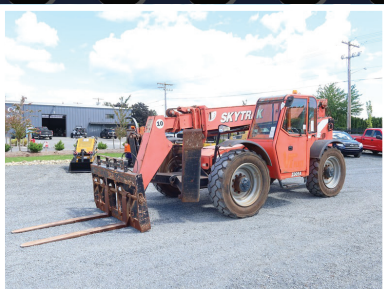
2012 SKYTRACK 10054