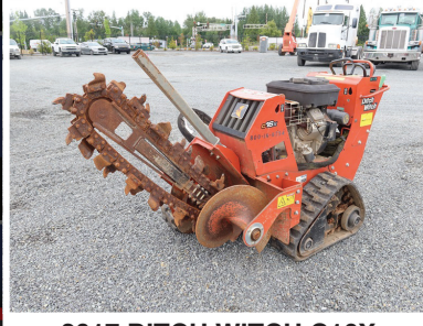
2017 DITCH WITCH C16X