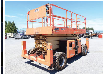
2019 JLG 430LRT