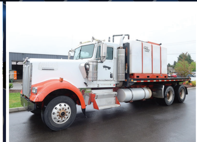
2004 KENWORTH W900B