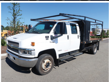
2004 CHEV C5500