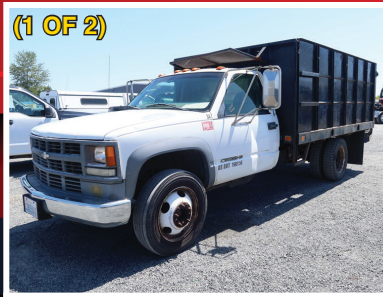
2000 CHEV 3500