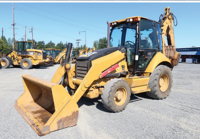
2011 CAT 430E