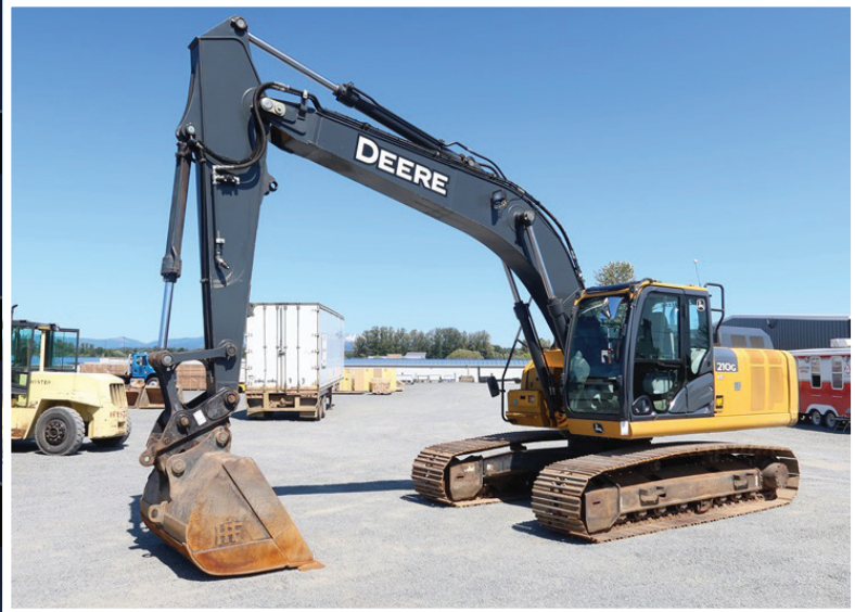
2018 JOHN DEERE 210G LC