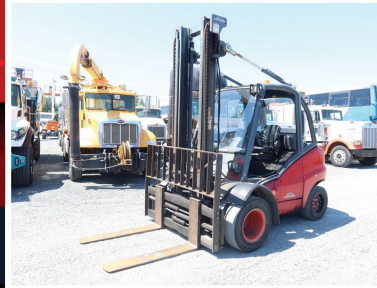
2007 LINDE H45D