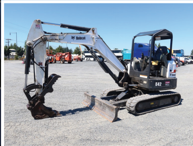
2017 BOBCAT E42