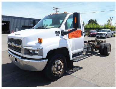
2008 CHEV C4500