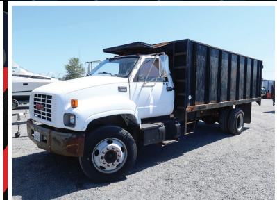
1997 GMC 6500