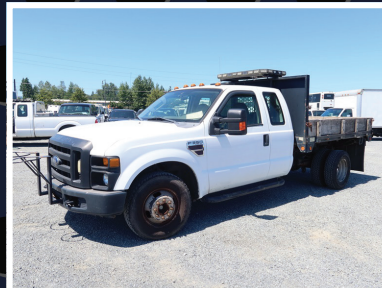
2008 FORD F350