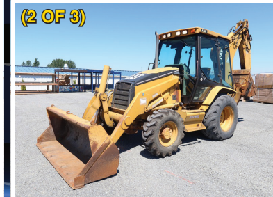
2003 CAT 430D 4X4