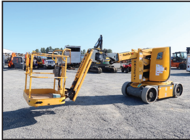
2019 HAULOTTE HA32CJ

START DATE: 10:00 AM | THURSDAY - AUGUST 1 END DATE: 10:00 AM | THURSDAY - AUGUST 8