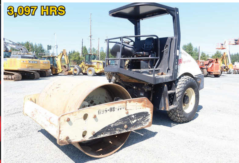
2007 INGERSOLL RAND SD-70D