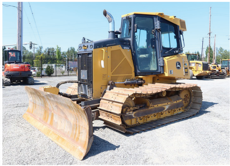
2016 JOHN DEERE 650K LGP