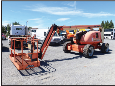
2016 JLG 600AJ