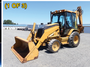
2003 CAT 430D 4X4