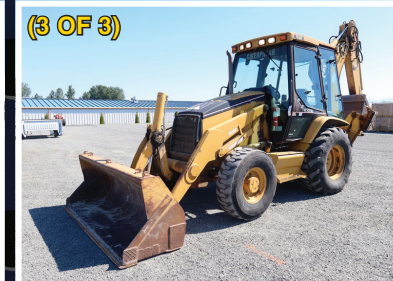
2003 CAT 430D 4X4