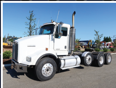
2005 KENWORTH T800