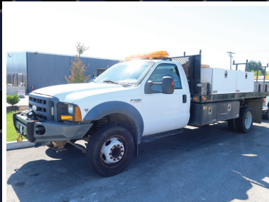
2007 FORD F450