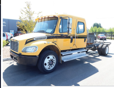
2005 FREIGHTLINER M2