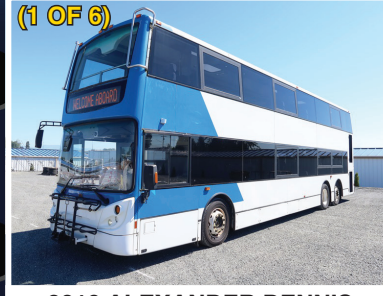
2010 ALEXANDER DENNIS