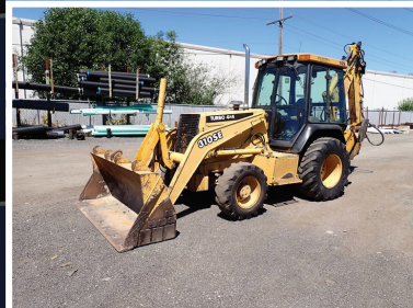
1998 JOHN DEERE 310SE 4X4