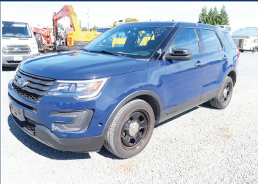
2017 FORD EXPLORER