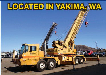
1974 GROVE TMS475