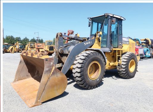
2005 JOHN DEERE 544J