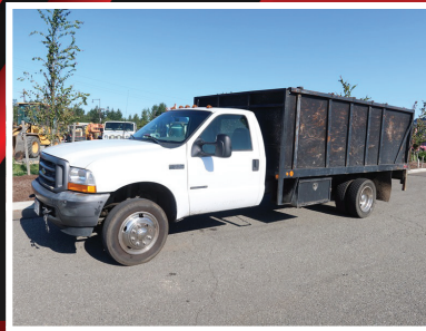
2001 FORD F550