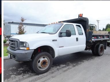
2004 FORD F450