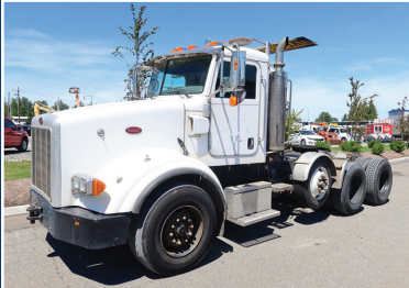
2007 PETERBILT 378