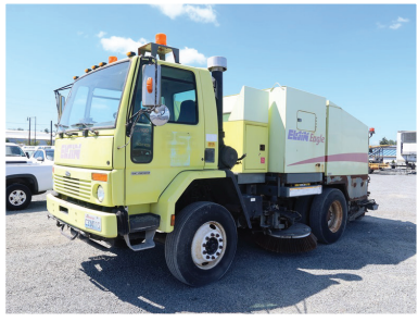
2003 STERLING SC8000