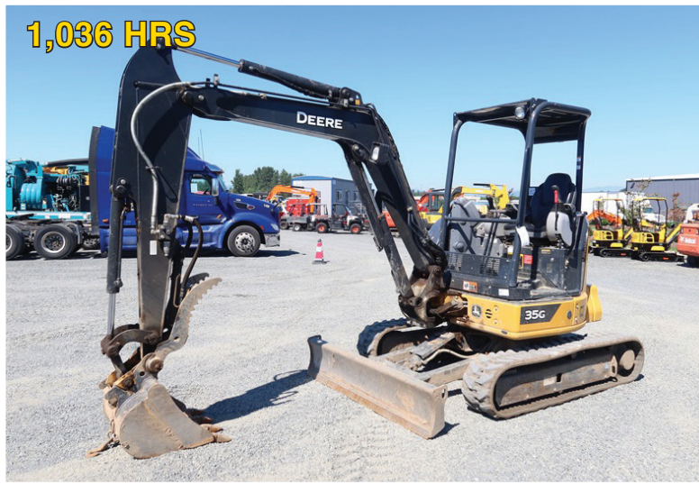
2023 JOHN DEERE 35G