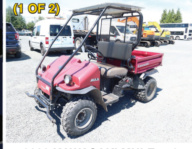
2002 KAWASAKI MULE 550