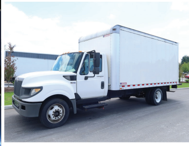
2013 INTERNATIONAL TERRASTAR