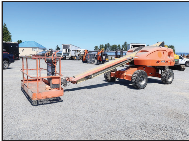
2014 JLG 400S