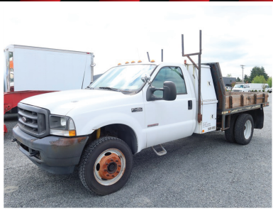
2003 FORD F450