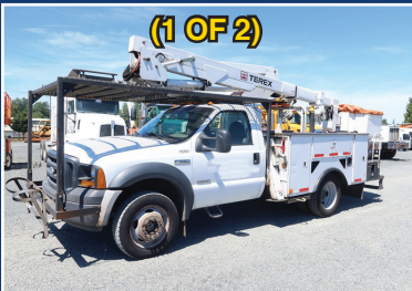
2007 FORD F550