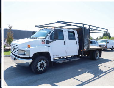
2006 CHEV C4500