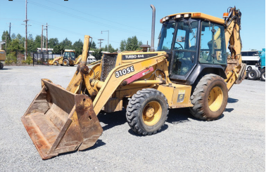
2000 JOHN DEERE 310SE 4X4