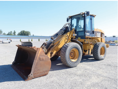
2006 CAT 930G