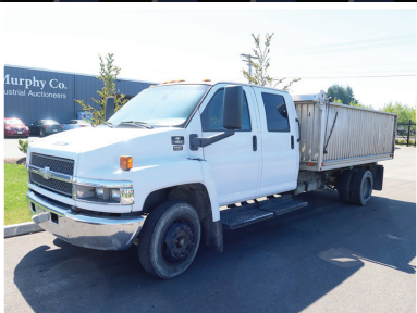
2008 CHEV C4500