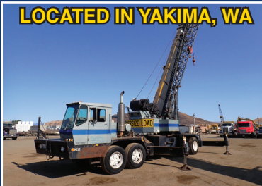
1978 GROVE TMS300