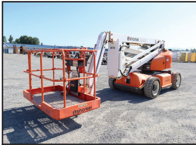
2019 SNORKEL A46JE