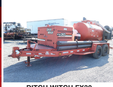
DITCH WITCH FX30