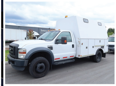
2009 FORD F450