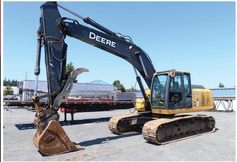
2011 JOHN DEERE 200DLC