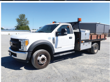
2017 FORD F450XL