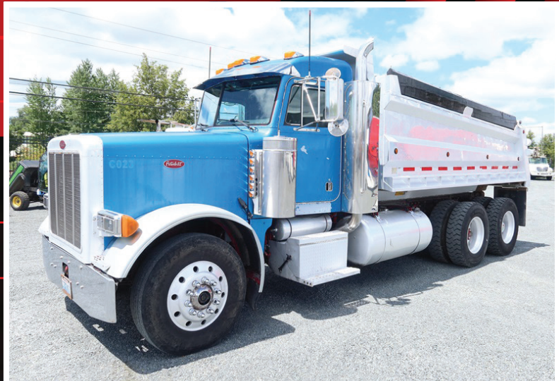
1996 PETERBILT 379