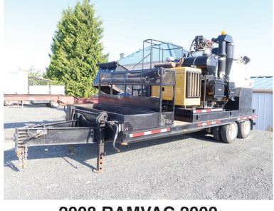
2008 RAMVAC 2000