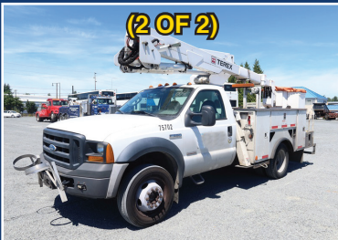
2007 FORD F550