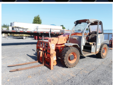
2017 XTREME XR5919