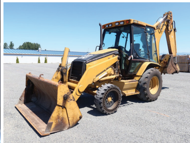
2004 CAT 430D 4X4