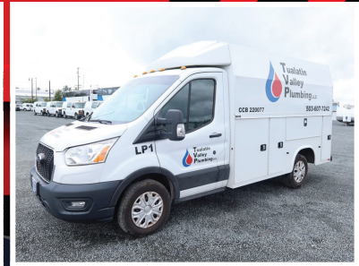
2020 FORD TRANSIT