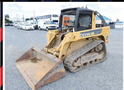
2007 JOHN DEERE CT322