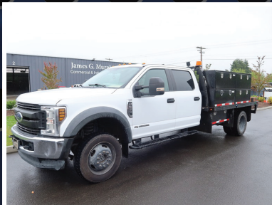
2019 FORD F550