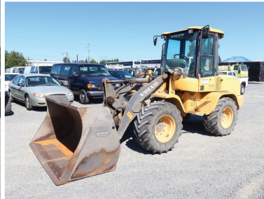
2016 VOLVO L30GS