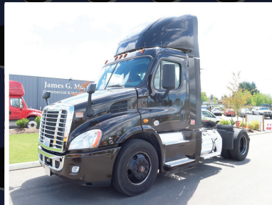
2016 FREIGHTLINER PX113