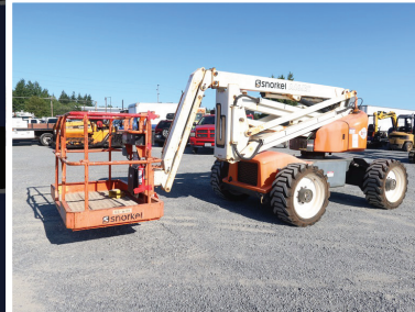
2019 SNORKEL AB46JE