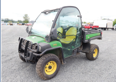
2016 JOHN DEERE GATOR 855D