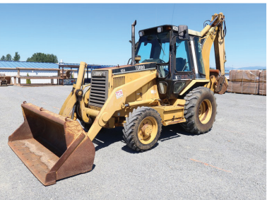
1993 CAT 426B 4X4