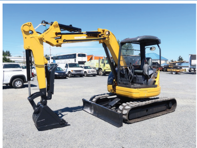
2004 KOMATSU PC58UU-3EO