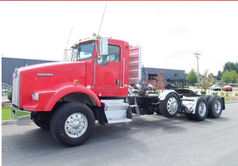
2005 KENWORTH T800