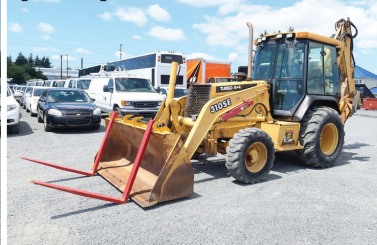
2000 JOHN DEERE 310SE 4X4