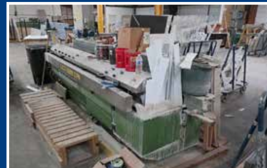
MARMO MACCANICA LOT522CAI 10' GRANITE POLISHER