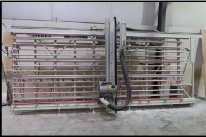
STRIEBIG VERTICAL OPTISAW 2 5192-A