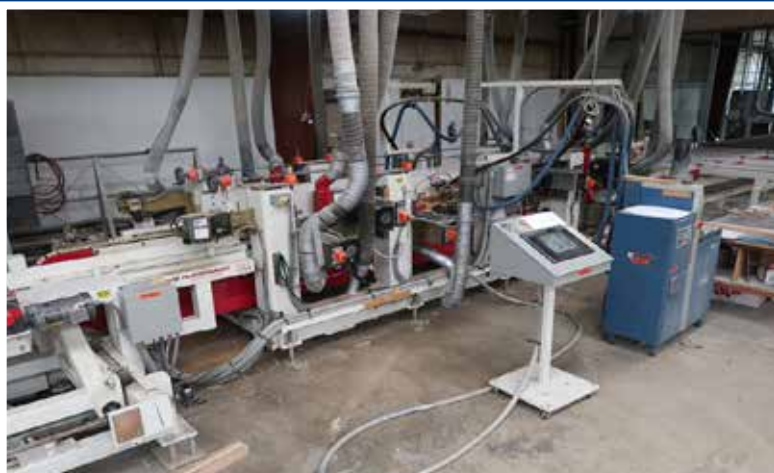
2006 CREATIVE AUTOMATION FULLY INTEGRATED LAMINATE COUNTERTOP BLANK FORMING LINE

Woodworking & Countertop Forming Equipment Equipment no longer needed for continuing operations