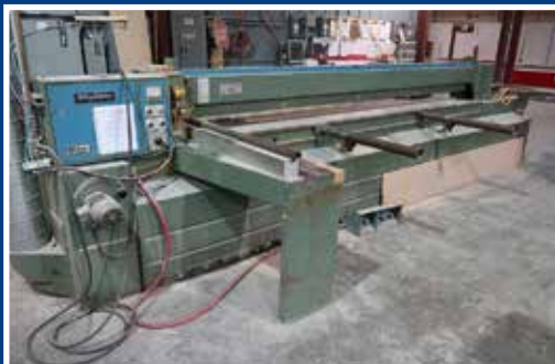
GIBEN 400 SHW 12' BEAM SAW