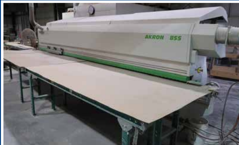
2006 BIESSE AKRON 855 EDGEBANDER