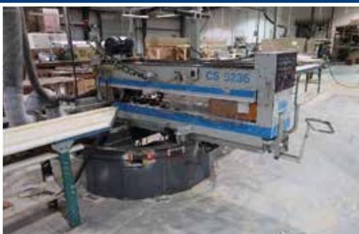
MIDWEST AUTOMATION CS5236