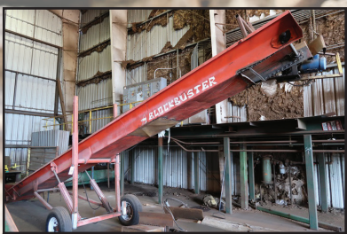
BLOCKBUSTER 30' 2-STRAND ALL HYDRAULIC ELEVATOR