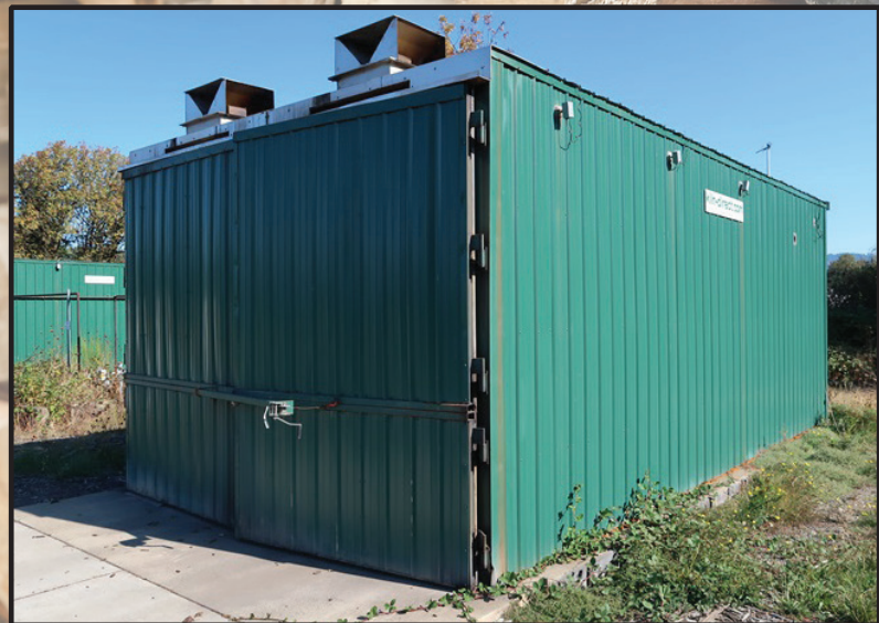
2020 KILN DIRECT MINI QUICK GAS FIRED 12 CORD FIREWOOD KILN