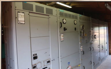
2008 & 2001 SIEMENS