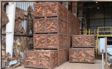
(325+) ASSORTED KILN BASKETS

WELDERS, FOLDING CRANE, ENGINE STAND, COMPRESSOR, PIPE THREADING TOOLS, CHOP SAW, (3) CHAINSAWS, AIR & POWER TOOLS, 2-TON CHAIN HOIST, FLAMMABLES CABINETS, GRINDERS, STEEL TABLES & VISES, HYDRAULIC JACKS, PARTS WASHER, 25 HP HYDRAULIC SPLITTER, (14) FIREWOOD BUNDLERS, (2) TURNABLES, STACKING FRAMES, AIR RECEIVERS, (2) WHEELED FIRE EXTINGUISHERS, GRIZZLY SCREEN, 150 HP HYDRAULIC UNIT, SELF-DUMPING DUMPSTERS, STEEL BINS, CATWALK & STAIRS