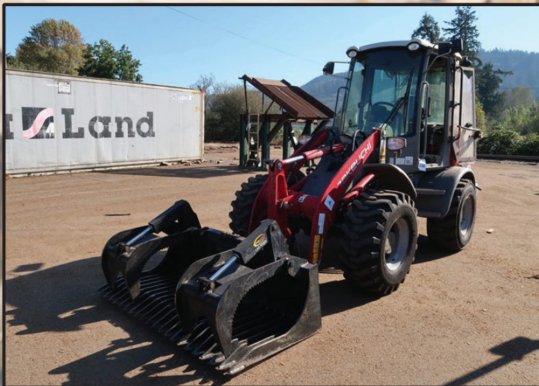
2016 TAKEUCHI TW65 SERIES 2 ARTICULATED WHEEL LOADER