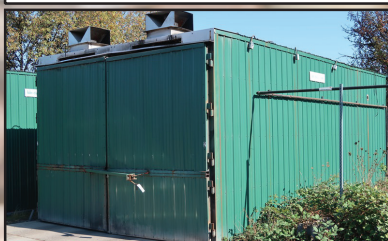
2016 & 2015 KILN DIRECT MINI QUICK