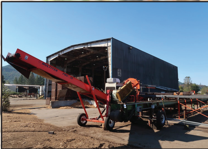
2021 MULTITEK 2040XP2 FIREWOOD PROCESSOR