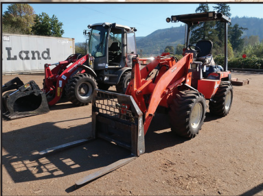
2010 KUBOTA R520ST