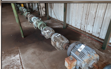
ASSORTED MOTORS TO 100HP