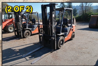
2016 TOYOTA 8FDU32