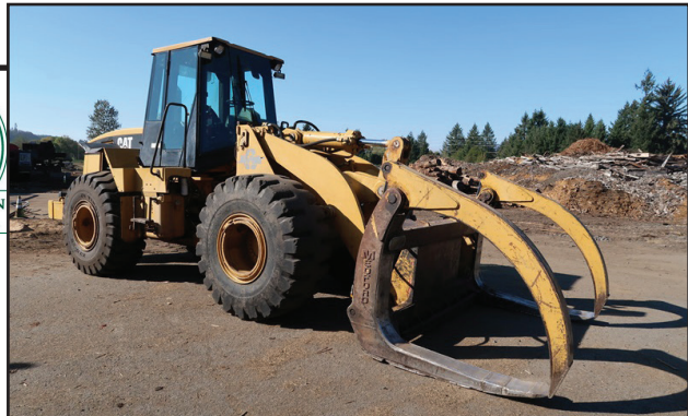
2001 CAT 950G