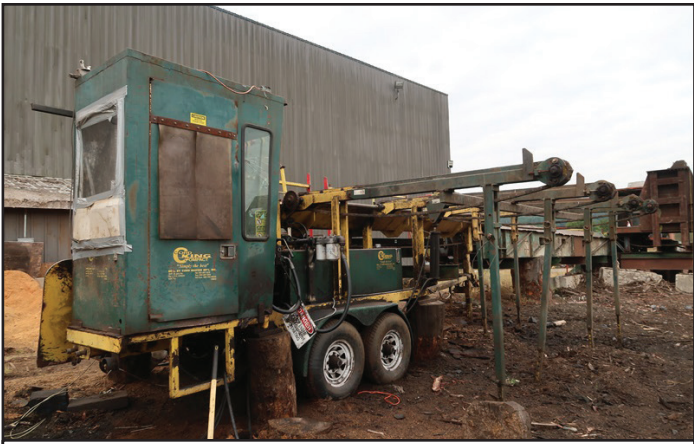
2007 CORD KING