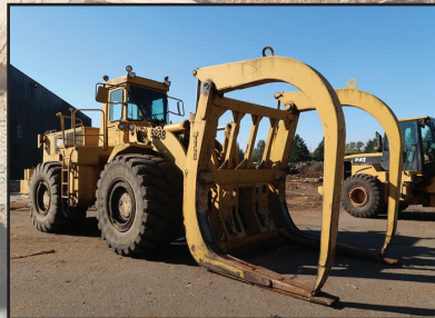
1988 CAT 988B