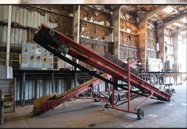
BLOCKBUSTER LE30 20"X30' ALL HYDRAULIC ELEVATOR