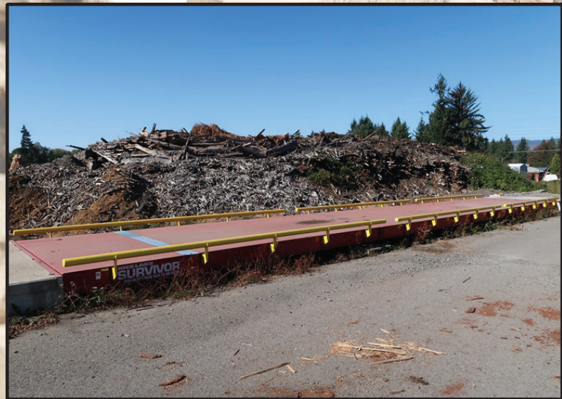
2020 RICE LAKE EZ7011-ST-100-OTR 100-TON LOW PROFILE LOAD CELL SCALES