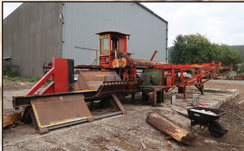
BLOCKBUSTER HYDRAULIC OPERATED SMALL LOG SPLITTER