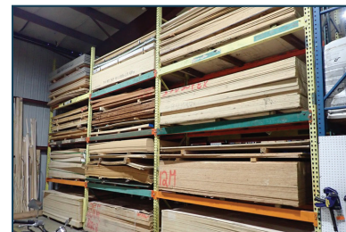
PLYWOOD & ROUGH CUT