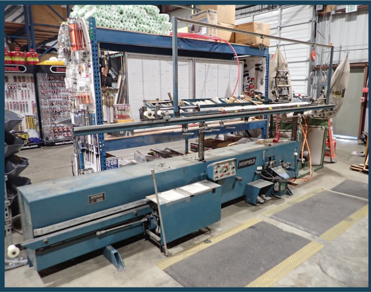
NORFIELD MAGNUM DOOR MACHINE