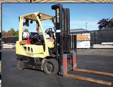
2011 HYSTER S60FT