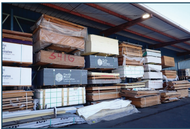
8-SECTION CANTILEVER RACK