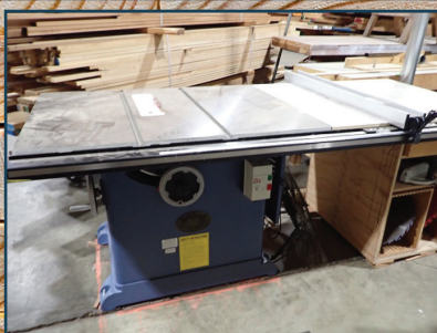
2018 OLIVER M-4050