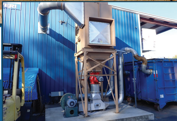
2019 TOTAL AIR ENERGY