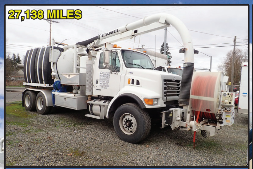
2005 STERLING W/CAMEL SUPERIOR