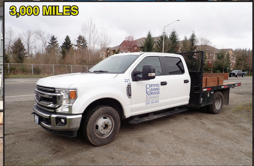
2021 FORD F350