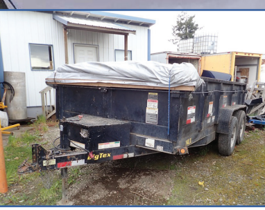
2010 BIG TEX