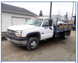
2005 CHEVROLET 3500