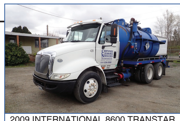
2009 INTERNATIONAL 8600 TRANSTAR W/CODED TANK