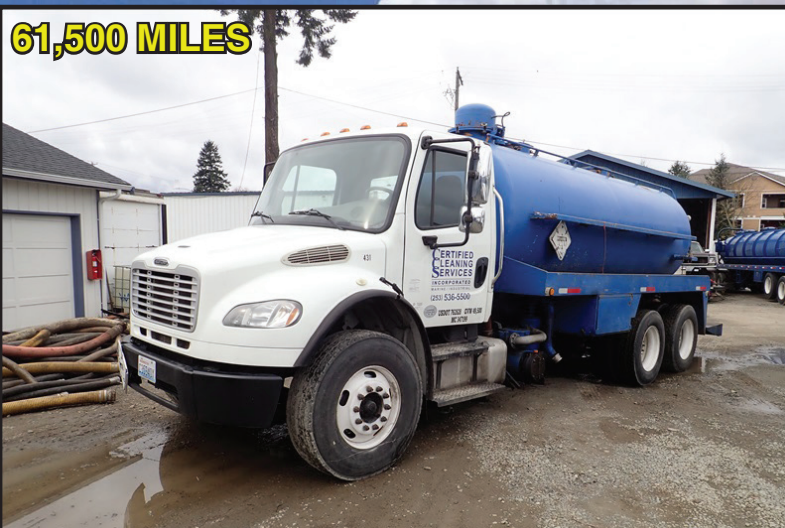
2013 FREIGHTLINER BUSINESS CLASS M2 W/CODED TANK