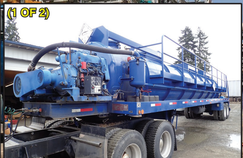
2018 FORT WORTH 5,040 GALLON CODED VACUUM