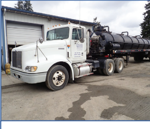
1998 INTERNATIONAL 9400