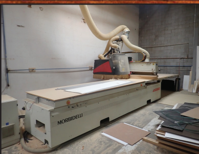
2006 SCM MORBIDELLI AUTHOR 336 NB