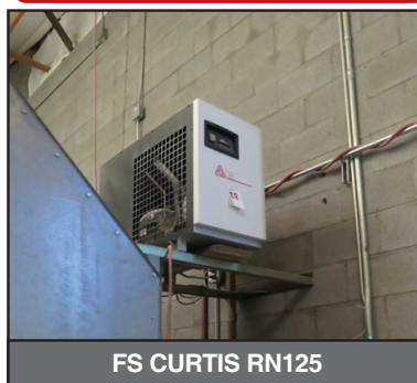
FS CURTIS RN125