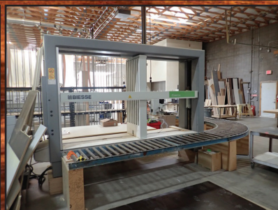
2018 BIESSE COSMO