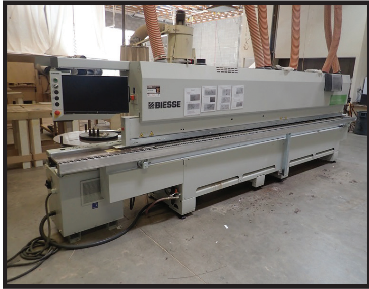
2019 BIESSE AKRON 1440A