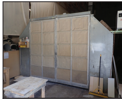
14'X20'X9" SPRAY BOOTH