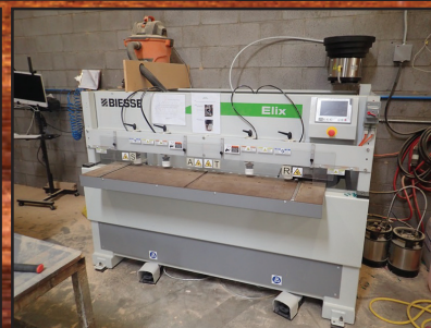
2018 BIESSE ELIX B