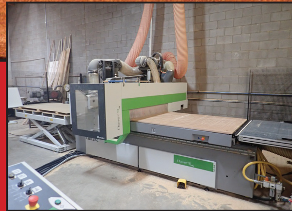
2017 BIESSE ROVER S FT 1224

Location: 205 South Beck Ave., Chandler, AZ 85226