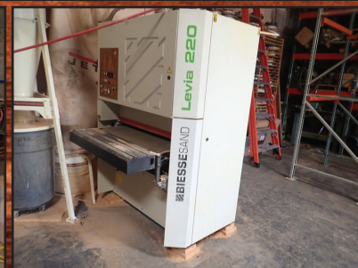
2006 BIESSE LEVIA 220-950