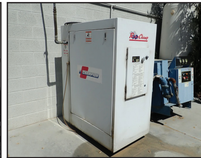
GARDNER DENVER EFC99B