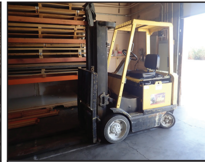
2000 HYSTER E50XM-27