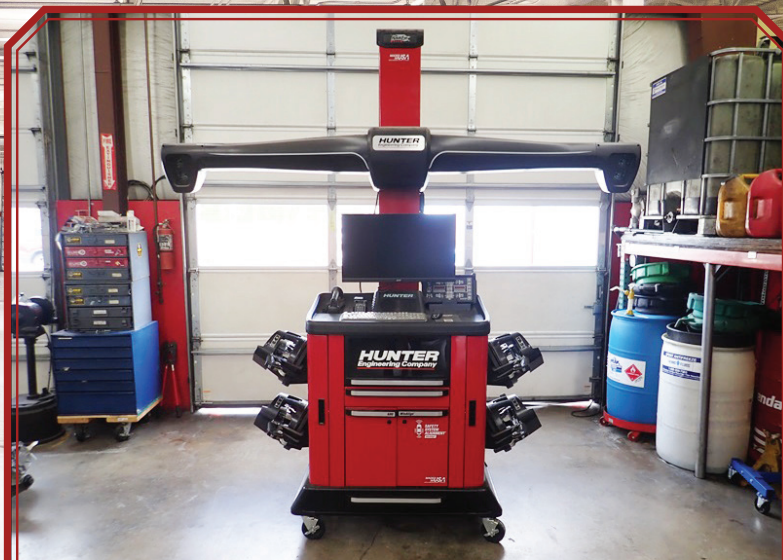
2019 HUNTER HAWKEYE ELITE 680