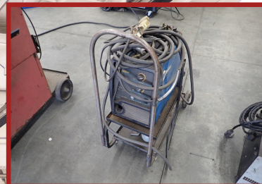
MILLER MILLERMATIC 175