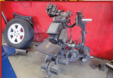
PRO-CUT PFM 9.0