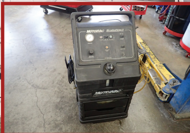
MOTORVAC BRAKEVAC II