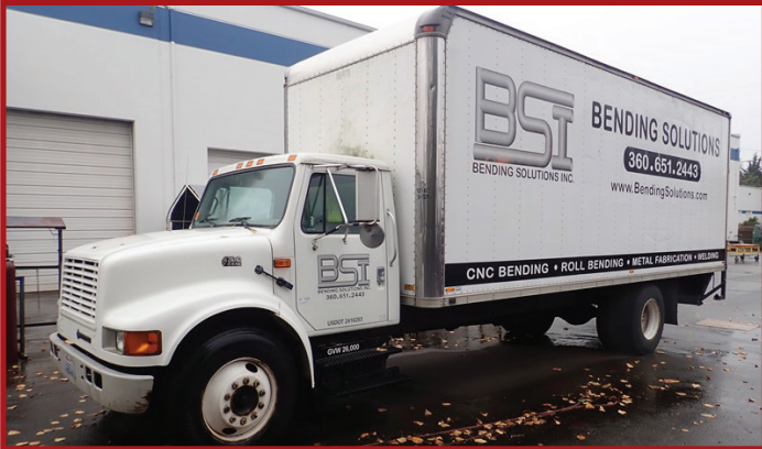
1999 INTERNATIONAL 4700