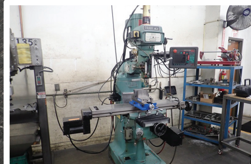
2006 SWI TRAK K2 EDGE