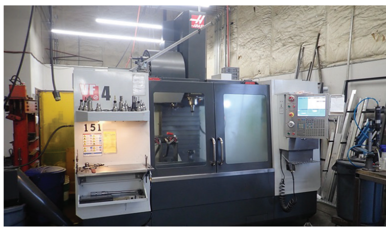
2014 HAAS VF-4