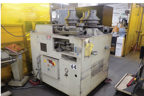
2004 IMCAR CPHV100