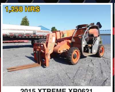
2015 XTREME XR0621