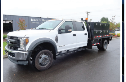
2019 FORD F550