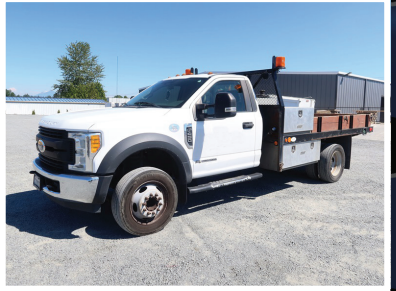
2017 FORD F450XL