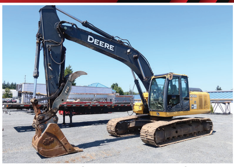
2011 JOHN DEERE 200DLC