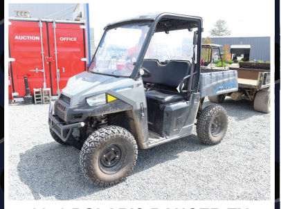
2016 POLARIS RANGER EV