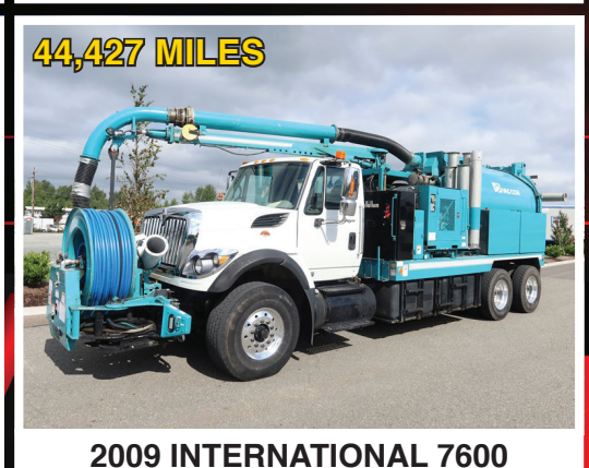
FULL PREVIEW AT MURPHYAUCTION.COM