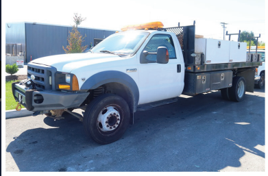
2007 FORD F450