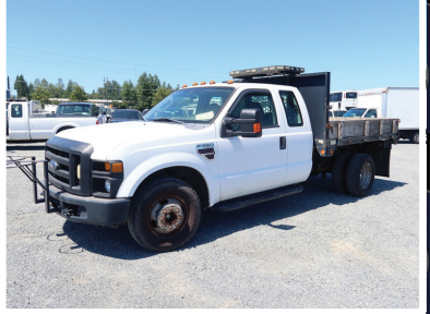
2008 FORD F350