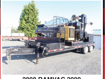
2008 RAMVAC 2000