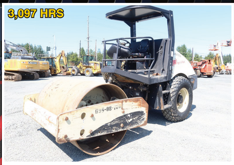
2007 INGERSOLL RAND SD-70D