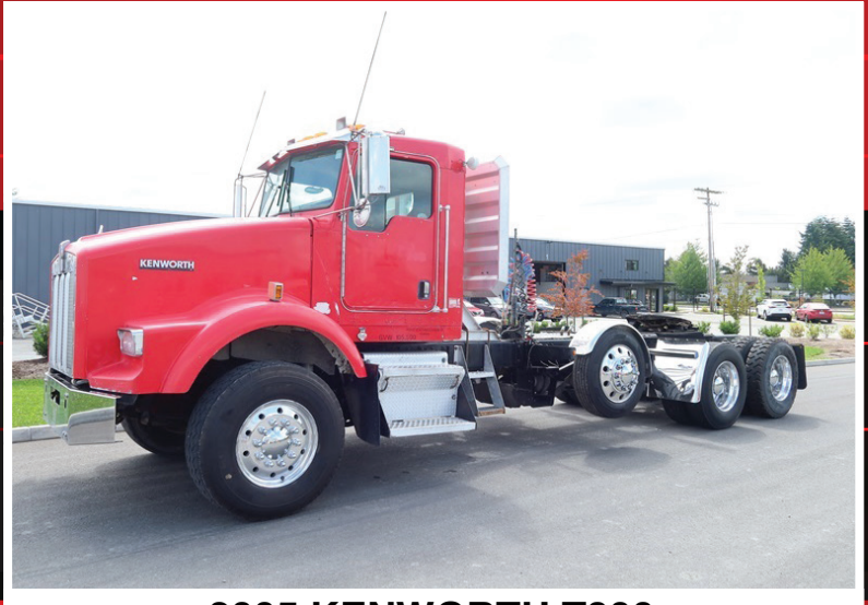
2005 KENWORTH T800