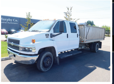
2008 CHEV C4500