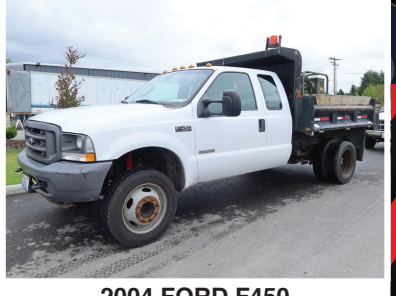
2004 FORD F450