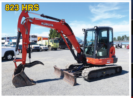
2020 KUBOTA KX057-4