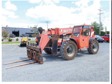
2012 SKYTRACK 10054