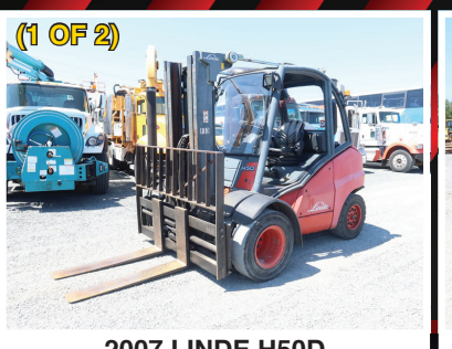
2007 LINDE H50D