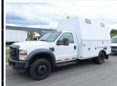
2009 FORD F450