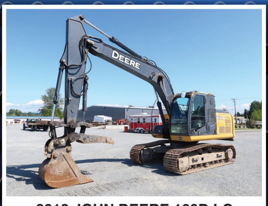
2012 JOHN DEERE 160D LC