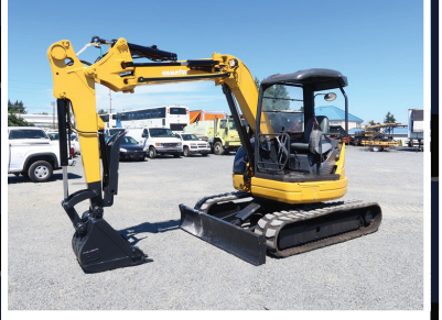
2004 KOMATSU PC58UU-3EO