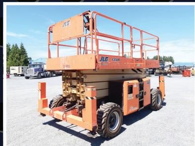
2019 JLG 430LRT