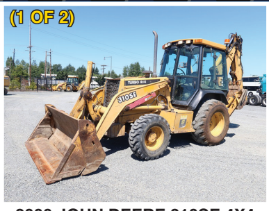
2000 JOHN DEERE 310SE 4X4