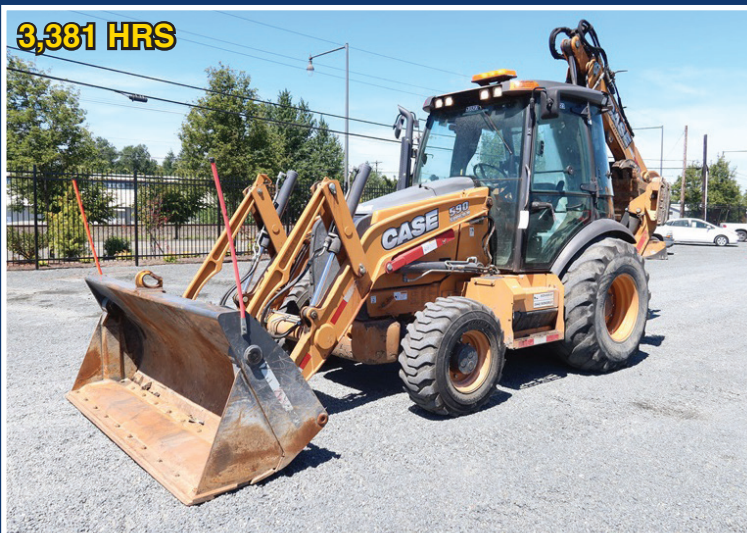
2016 CASE 590 SUPER N 4X4