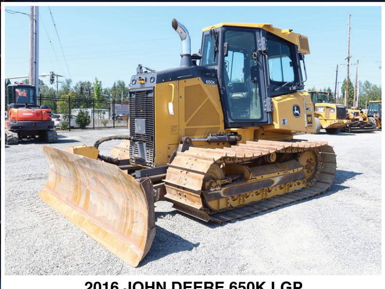
2016 JOHN DEERE 650K LGP