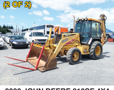
2000 JOHN DEERE 310SE 4X4