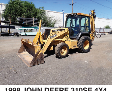
1998 JOHN DEERE 310SE 4X4