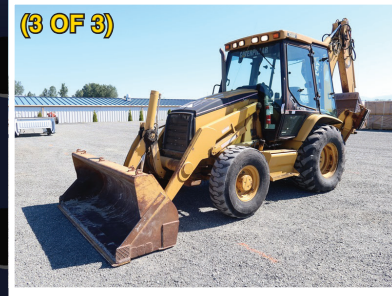
2003 CAT 430D 4X4