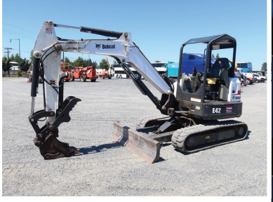
2017 BOBCAT E42