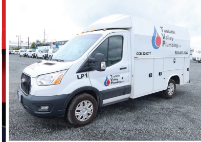
2020 FORD TRANSIT