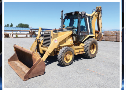
1993 CAT 426B 4X4