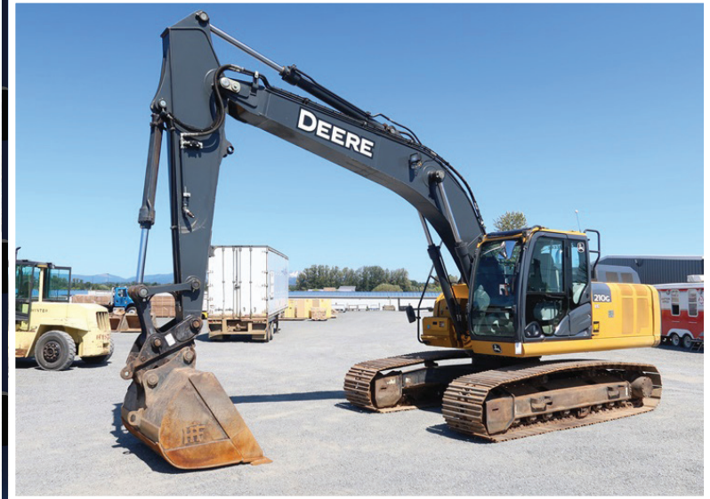
2018 JOHN DEERE 210G LC