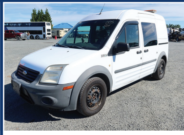
2010 FORD TRANSIT CONNECT