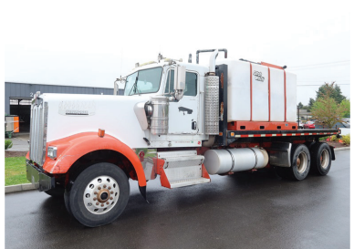
2004 KENWORTH W900B