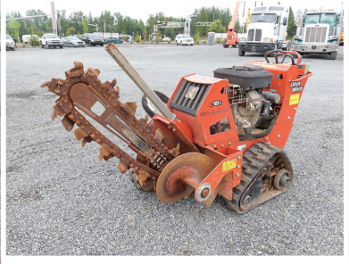
2017 DITCH WITCH C16X