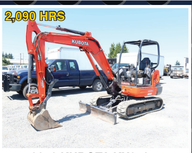
2016 KUBOTA KX040-4