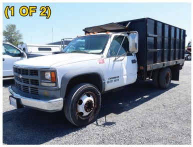
2000 CHEV 3500