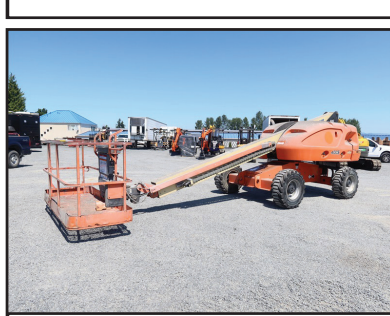
2019 SNORKEL A46JE