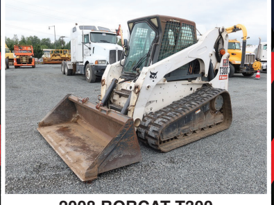
2008 BOBCAT T300