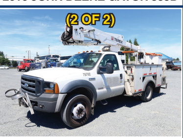
2007 FORD F550