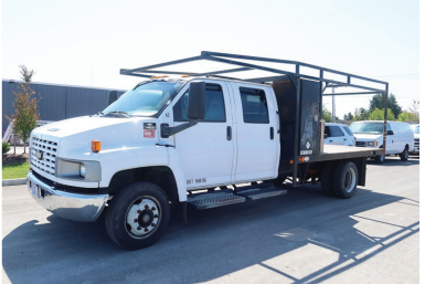
2006 CHEV C4500