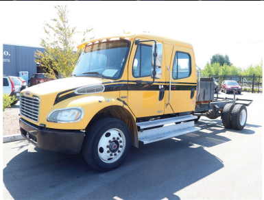
2005 FREIGHTLINER M2