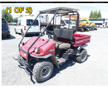
2002 KAWASAKI MULE 550