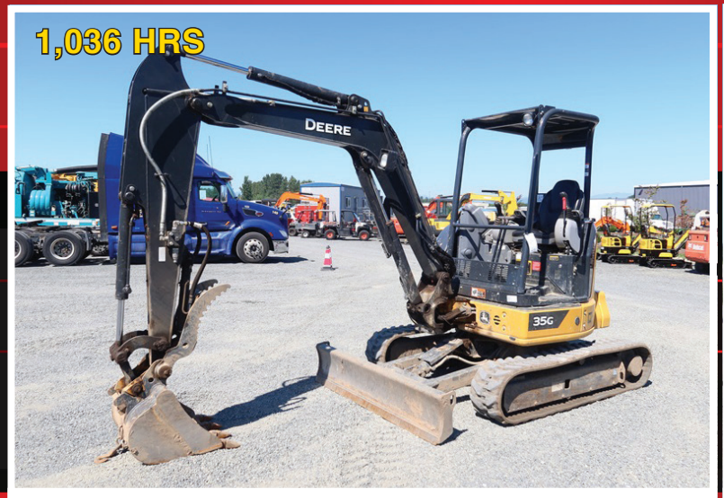
2023 JOHN DEERE 35G