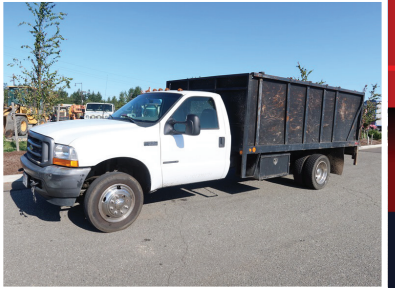
2001 FORD F550