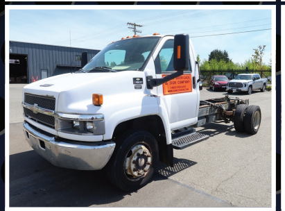
2008 CHEV C4500