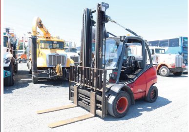
2007 LINDE H45D