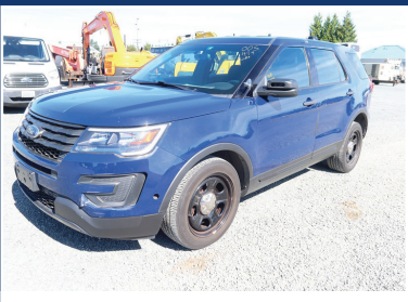
2017 FORD EXPLORER