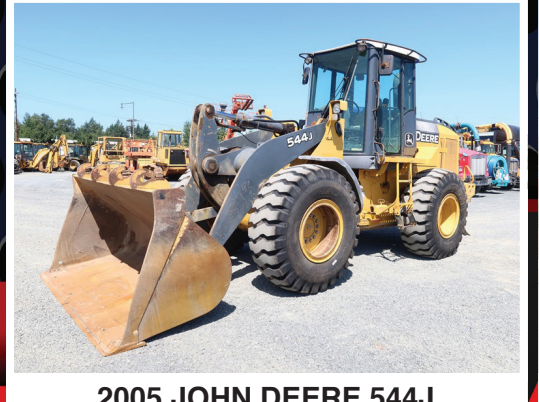
2005 JOHN DEERE 544J