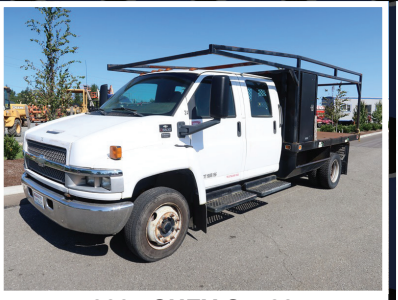
2004 CHEV C5500