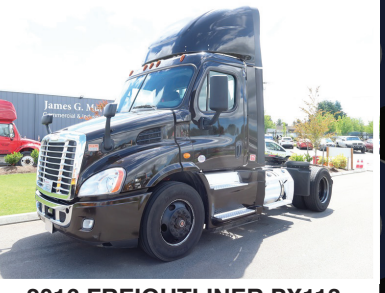
2016 FREIGHTLINER PX113