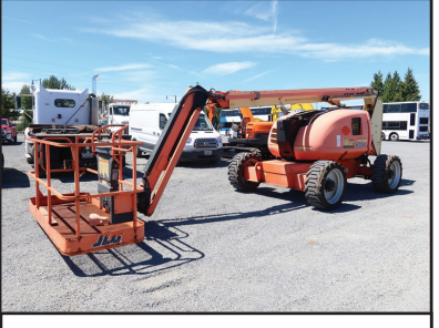
2016 JLG 600AJ