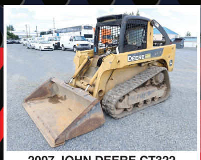
2007 JOHN DEERE CT322