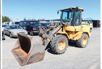
2016 VOLVO L30GS