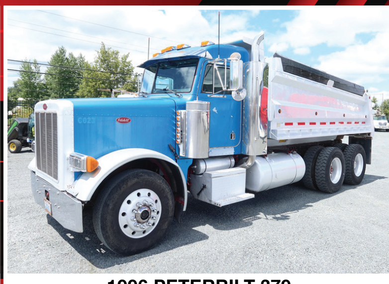
1996 PETERBILT 379