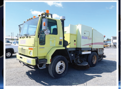
2003 STERLING SC8000