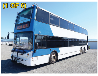
2010 ALEXANDER DENNIS