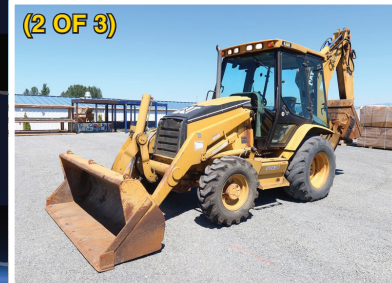
2003 CAT 430D 4X4