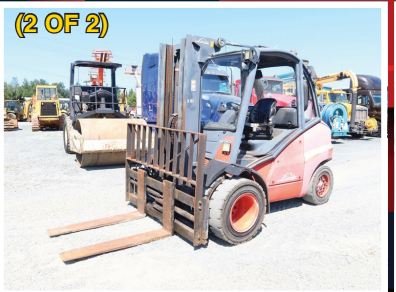
2007 LINDE H50D