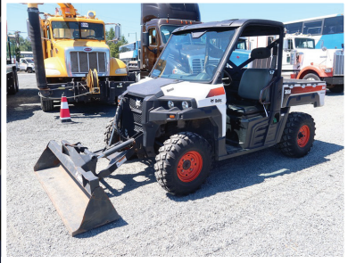
2013 BOBCAT 3650