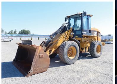
2006 CAT 930G