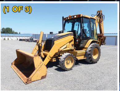
2003 CAT 430D 4X4