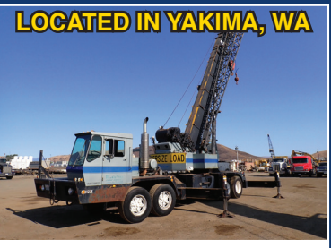
1978 GROVE TMS300