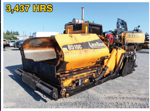
2015 LEEBOY 8510