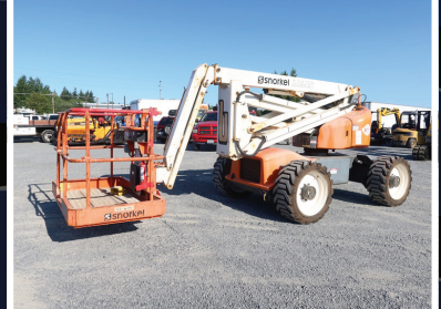
2019 SNORKEL AB46JE