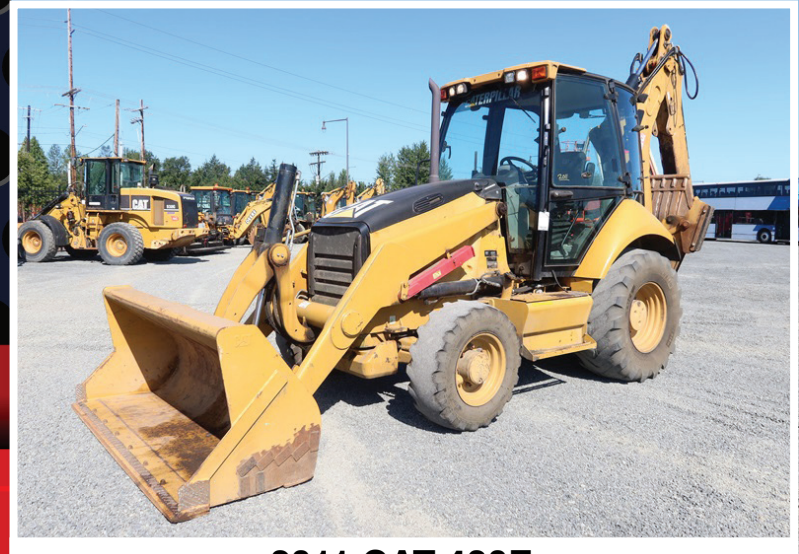
2011 CAT 430E