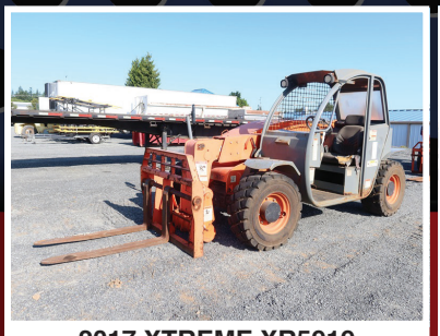
2017 XTREME XR5919