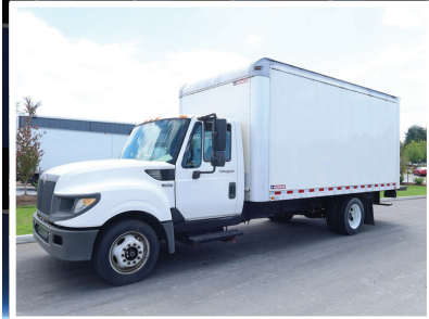
2013 INTERNATIONAL TERRASTAR