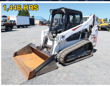
2017 BOBCAT T590