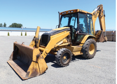
2004 CAT 430D 4X4