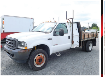
2003 FORD F450