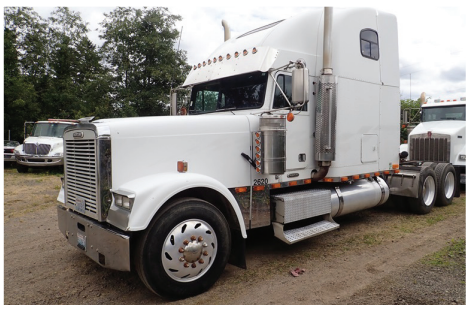
1999 FREIGHTLINER FLD132064T