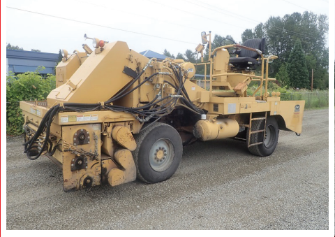
1998 ETNYRE M-12-79