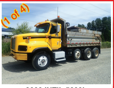
2003 INT'L 5600i