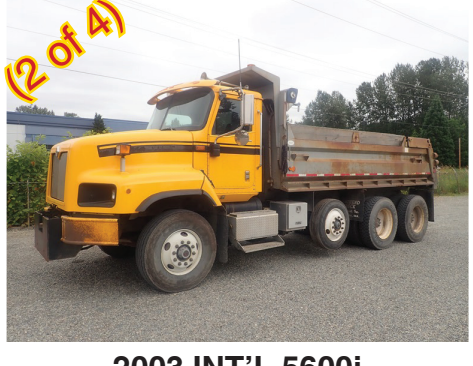
2003 INT'L 5600i