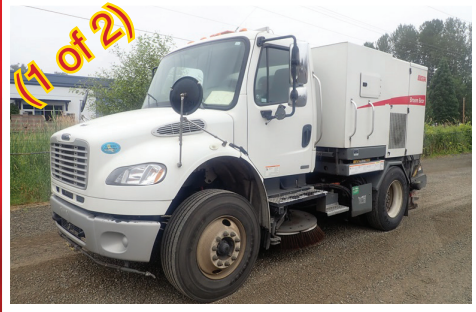
2009 FREIGHTLINER M2