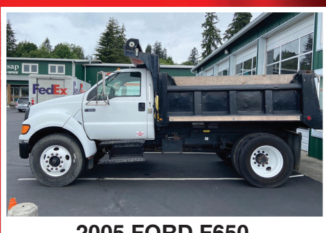
2005 FORD F650