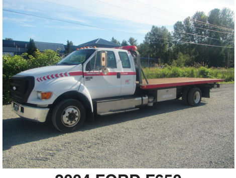
2004 FORD F650