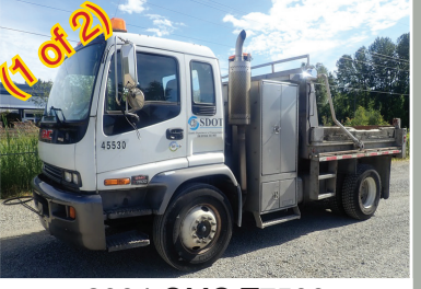
2004 GMC T7500