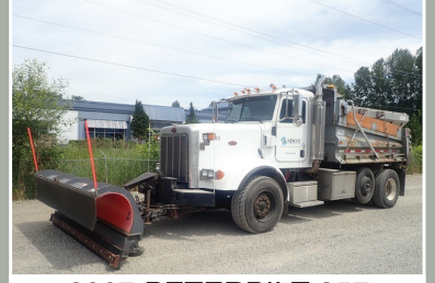
2007 PETERBILT 357