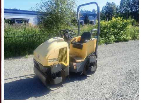
2016 WACKER RD12A