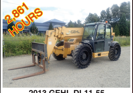
2013 GEHL DL11-55