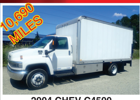
2004 CHEV C4500