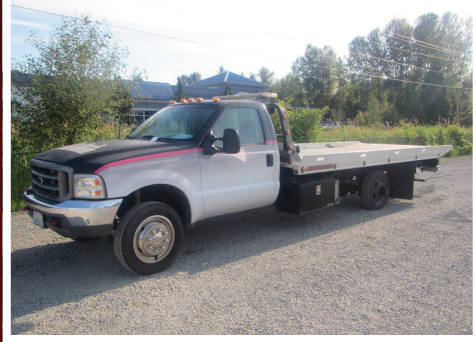
2000 FORD F550