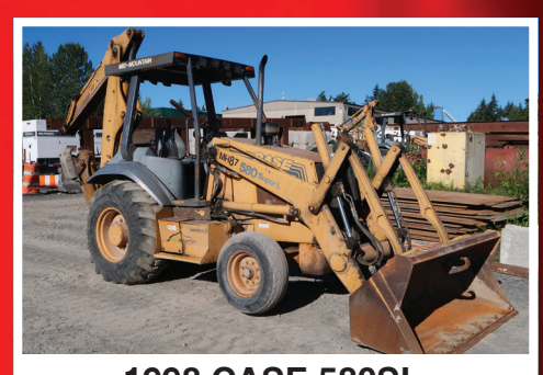
1998 CASE 580SL