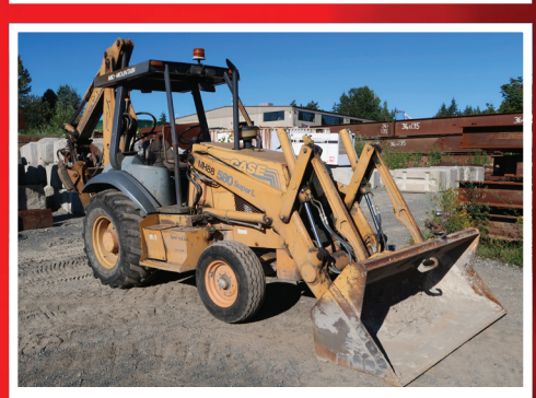
1998 CASE 580SL