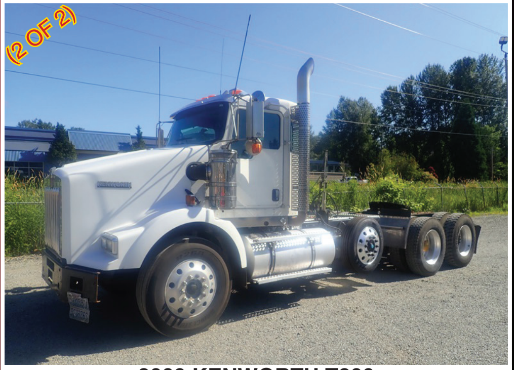
2009 KENWORTH T800