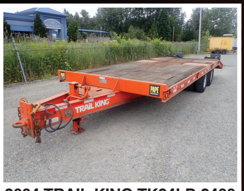
2004 TRAIL KING TK24LP-2400

ADDITIONAL ITEMS NOT PICTURED: 1996 Western Star Dump Truck, 2005 Kobelco SK 135 SR Excavator, 1998 Linkbelt 2700 Quantum Excavator & MUCH MORE