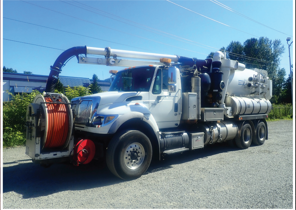
2006 INTERNATIONAL 7600SFA 6X4