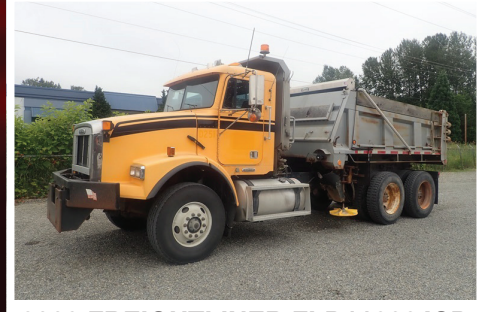
2002 FREIGHTLINER FLD112084SD