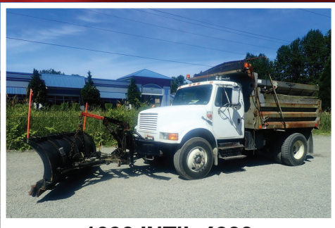
1990 INT'L 4900