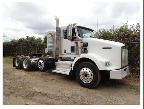
2008 KENWORTH T800