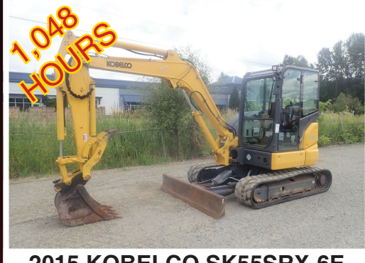
2015 KOBELCO SK55SRX-6E