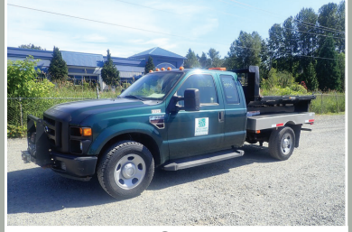
2008 FORD F350