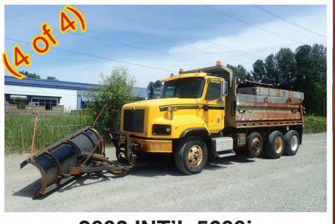
2003 INT'L 5600i