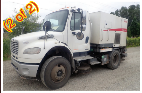
2009 FREIGHTLINER M2