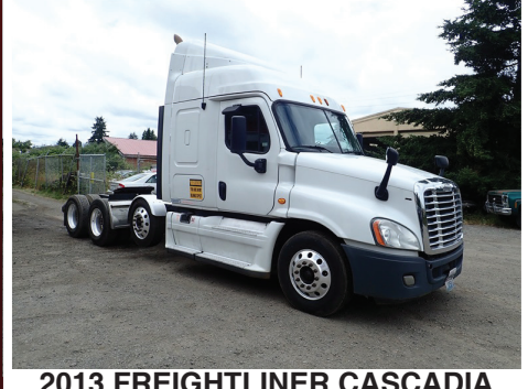
2013 FREIGHTLINER CASCADIA 125SLP