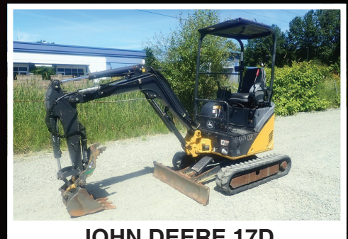
JOHN DEERE 17D