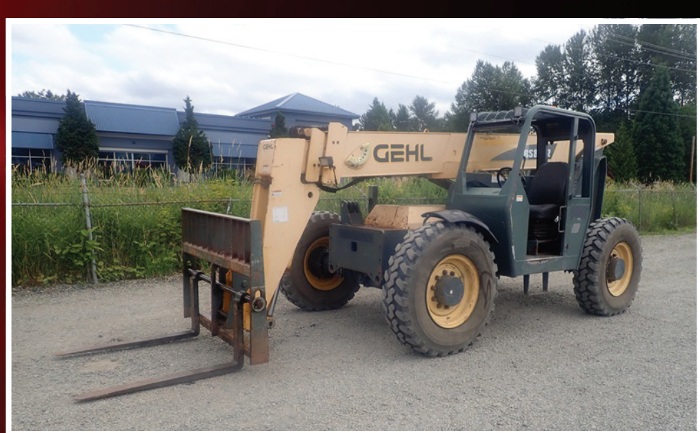
2006 GEHL RS8-42