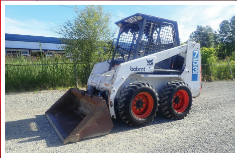
1993 BOBCAT 753