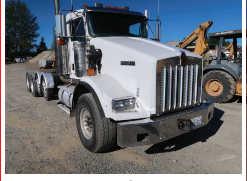
2007 KENWORTH T800