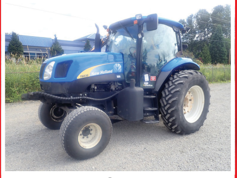
2008 NEW HOLLAND T6030