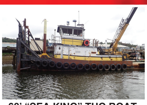
60' "SEA KING" TUG BOAT