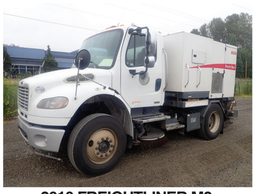
2010 FREIGHTLINER M2