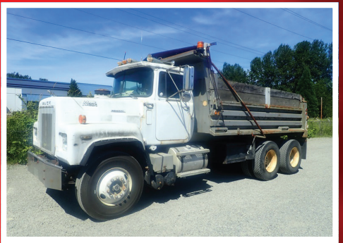
1982 MACK RL600