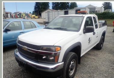
2008 CHEV COLORADO

FOR VIDEOS AND MORE PHOTOS VISIT MURPHYAUCTION.COM