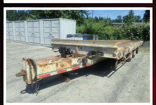
2001 TRAILMAX TD-40-T

*REMOVAL BY APPOINTMENT FOR ALL TITLED ITEMS*