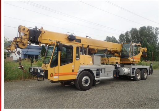
1999 GROVE 6640G