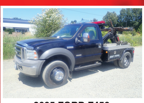
2005 FORD F450