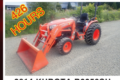
2014 KUBOTA B3350SU