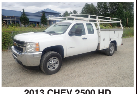
2013 CHEV 2500 HD