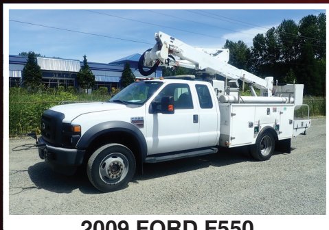
2009 FORD F550