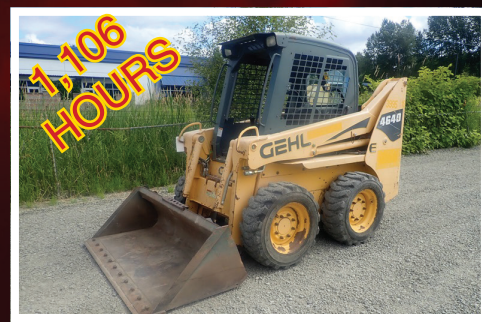
2006 GEHL 4640