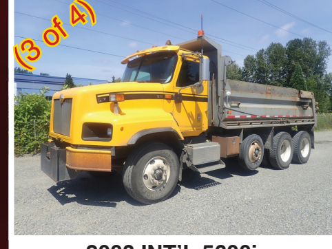
2003 INT'L 5600i