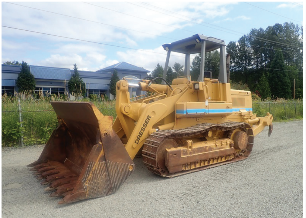
1989 DRESSER 200