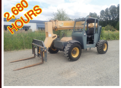
2006 GEHL RS5-34