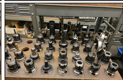
(300+) CAT 40