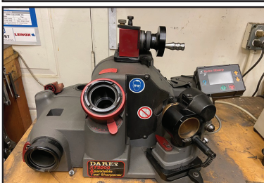
DAREX XT-3000 XPANDABLE