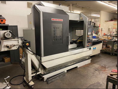
2006 DMG MORI SEIKI DURAVERICAL 5100