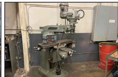
BRIDGEPORT SERIES I