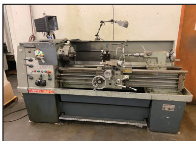
1997 AMERICAN TURNMASTER THL-1550

COMPLETE TERMS AND CONDITIONS OF SALE WILL BE AVAILABLE AT THE TIME OF SALE.