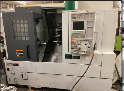
2010 MORI SEIKI NL1500/500