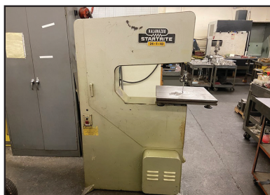
KALAMAZOO STARTRITE 24-T-10