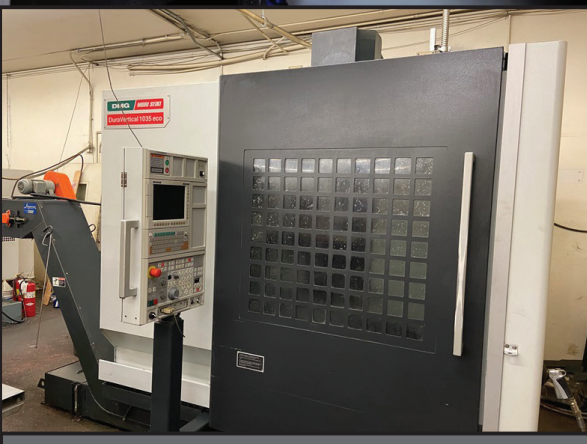
2011 DMG MORI SEIKI DURAVERICAL 1035ECO