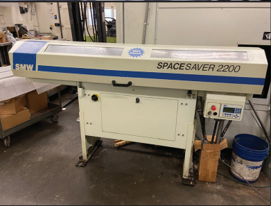
2006 SMW SPACESAVER 2200