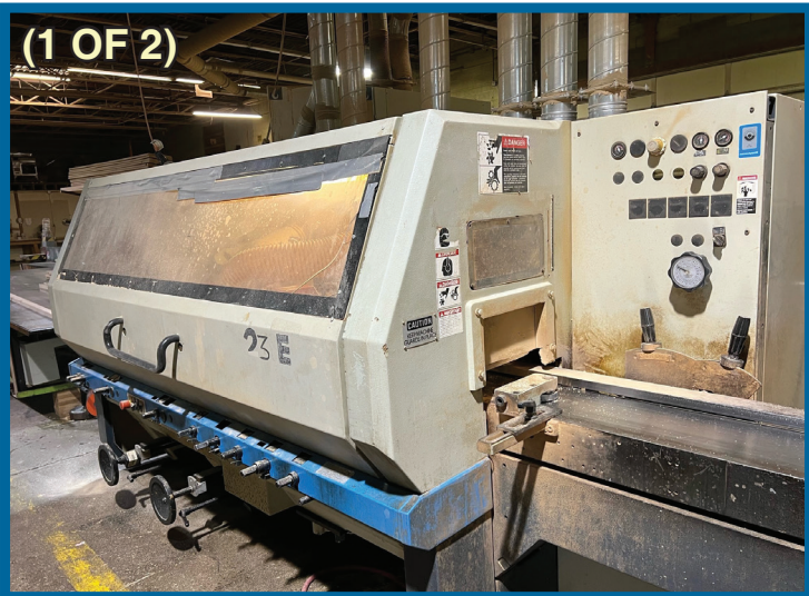
2002 WEINIG UNIMAT U23-E