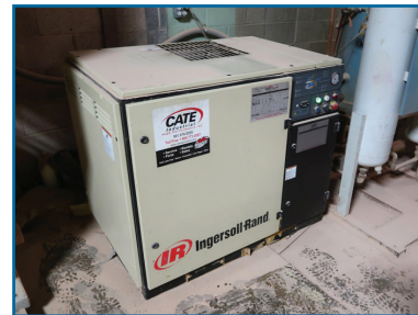
2003 INGERSOLL RAND