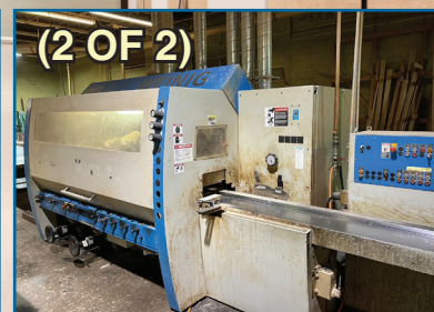
2001 WEINIG UNIMAT U23-E