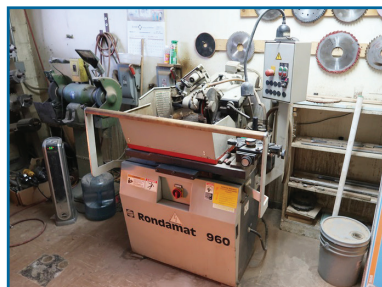
2001 RONDAMAT R960