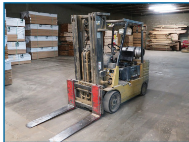
1999 CAT GC30