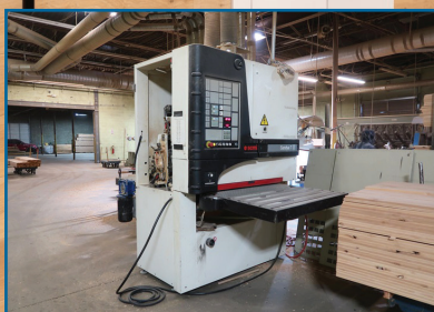
SCMI SANYA 7S