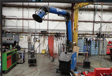
MILLER FILTAIR CAPTURE 5