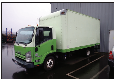
2011 ISUZU NPR