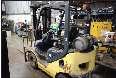
2017 KOMATSU FG18HTU-20