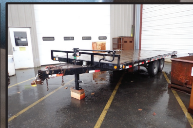
2014 LOAD TRAIL