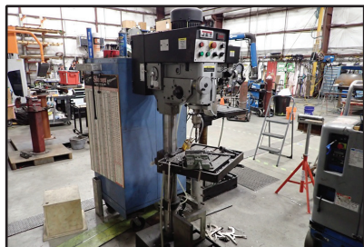
2020 JET JDP20EVST