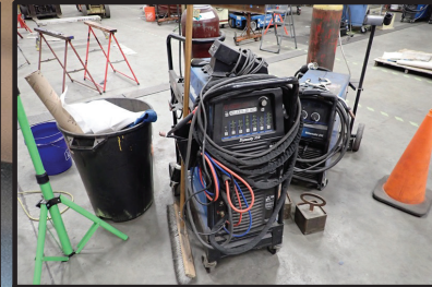
MILLER DYNASTY 350