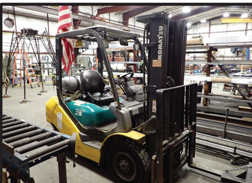
2007 KOMATSU FG25T-16