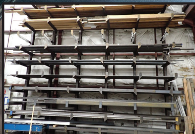
LONG STOCK INVENTORY