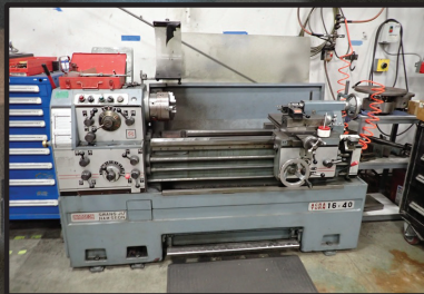
NAMESEON ACRA TURN

James G. Murphy Co. 425.486.1246 - murphyauction.com