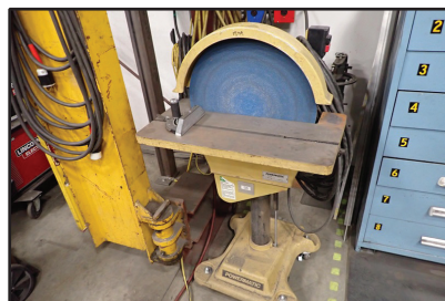
2017 POWERMATIC DS-20-3