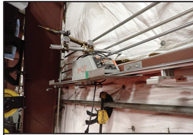
GULLCO KAT II