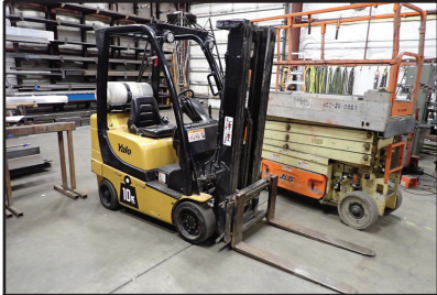
2005 YALE GLC040SVXNURE082