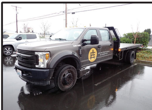
2018 FORD F450