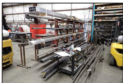
DOUBLE SIDED CANTILEVER