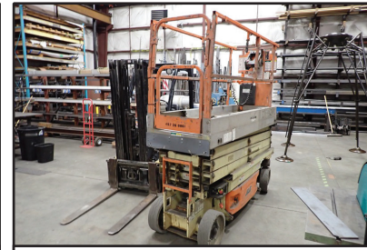
2010 JLG 2630ES