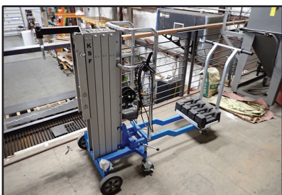
2021 KSI BD400