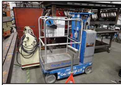
2012 GENIE GR-15

2007 KOMATSU FG25T-16 4,650 LB CAP. CUSHION TIRED FORKLIFT, 188" 3-STAGE MAST, SIDE SHIFT, PROPANE, HOUR METER READS: 10,500, S/N: 211617A 2005 YALE GLC040SVXNURE082 3,650 LB CAP. SOLID TIRED FORKLIFT, 187" 3-STAGE MAST, SIDE SHIFT, PROPANE, HOUR METER READS: 13,900, S/N: C809V01868C 2017 KOMATSU FG18HTU-20 2,850 LB CAP. SOLID TIRED FORKLIFT, 188" 3-STAGE MAST, SIDE SHIFT, PROPANE, HOUR METER READS: 4,020, S/N: 674341 2010 JLG 2630ES 26' ELECTRIC SCISSORLIFT, S/N: 0200198644 2011 ISUZU NPR 16' C/O BOX TRUCK, DIESEL, AUTO, REAR CAMERA, ODOMETER READS: 192,500, S/N: JALC4W167B7004336 2018 FORD F450 4X4 CREW CAB FLATBED TRUCK, DIESEL, AUTO, 12' STEEL BED, ODOMETER READS: 117,000, S/N: 1FD0W4HT4JEC43895 2013 NISSAN FRONTIER SV 4X4 CREW CAB PICKUP TRUCK, GAS, AUTO, ODOMETER READS: 202,000, S/N: 1N6AD0FVXD716633 2009 TOYOTA TACOMA SR5 EXTENDED CAB PICKUP TRUCK, GAS, AUTO, ODOMETER READS: 196,000, S/N: 5TETX22N89Z618158 1993 FORD RANGER XLT PICKUP TRUCK, GAS, S/N: 1FTCR10U4PPA88788 2014 LOAD TRAIL 8'X20' T/A DECK OVER FLATBED TRAILER, WOOD DECK, RAMPS, S/N: 4ZEDK2025E1051404