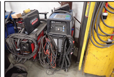
MILLER SYNCROWAVE 300