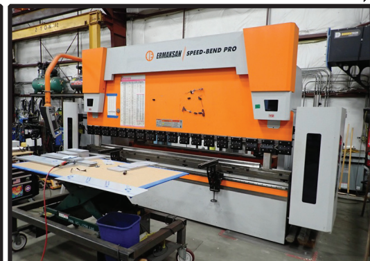
2016 ERMAKSAN SPEED-BEND PRO 12.3X193