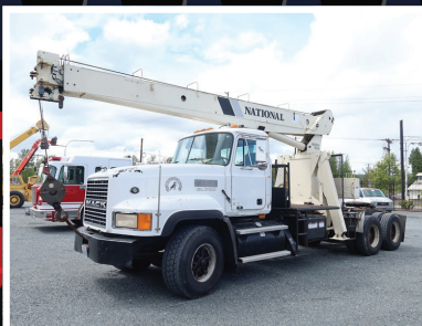
1996 MACK CL700