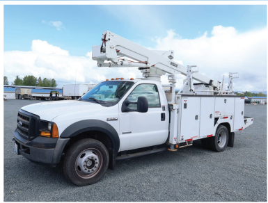
2007 FORD F550