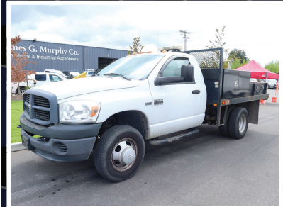
2007 DODGE 3500