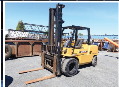
2007 CAT GP50