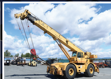
1981 GROVE RT740