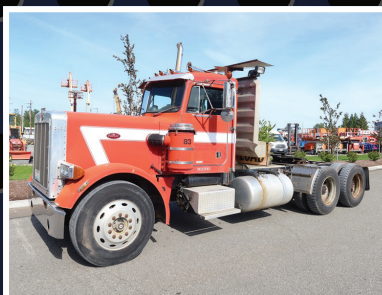
1984 PETERBILT 359