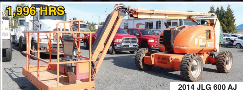
2014 JLG 600 AJ