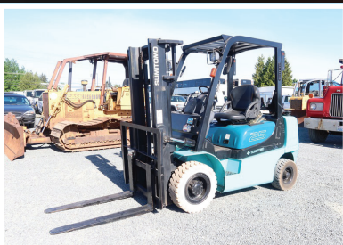
2009 SUMITOMO 11FL25PAX12LD