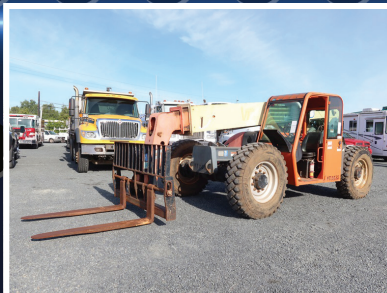
2004 JLG G6-42A