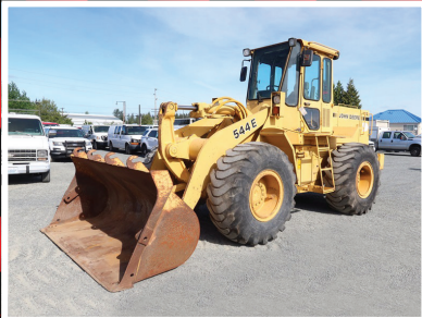
1990 JOHN DEERE 544E