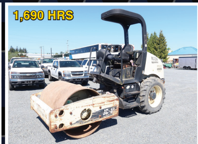
2005 INGERSOLL RAND SD-45D