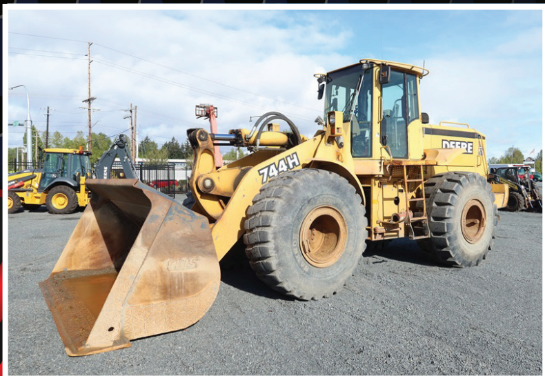
2001 JOHN DEERE 744H