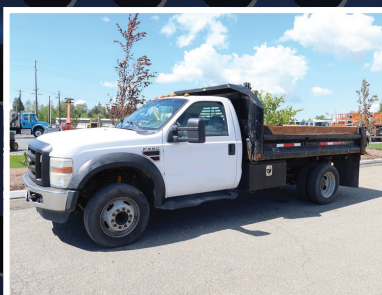
2008 FORD F550