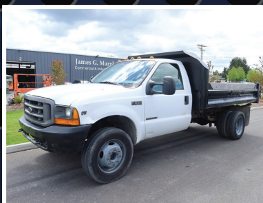
2000 FORD F450