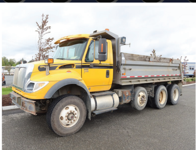
2006 INTERNATIONAL 7600