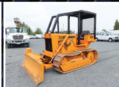
1978 CASE 350