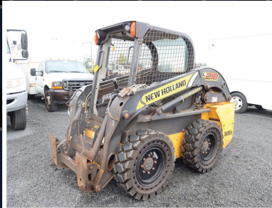
2018 NEW HOLLAND L218