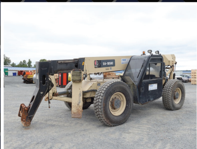
2007 INGERSOLL RAND VR-1056C