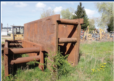
ASSORTED TRENCH BOXES