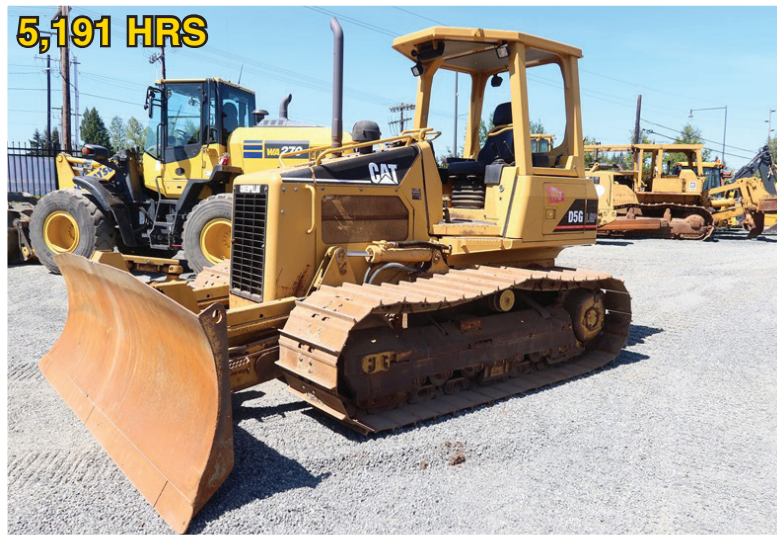
2006 CAT D5G LGP