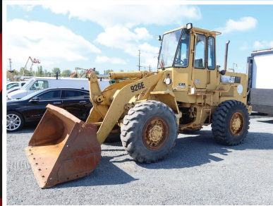
1992 CAT 926E