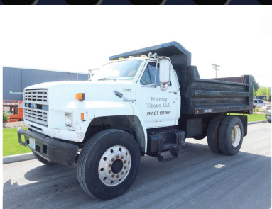
1985 FORD F800