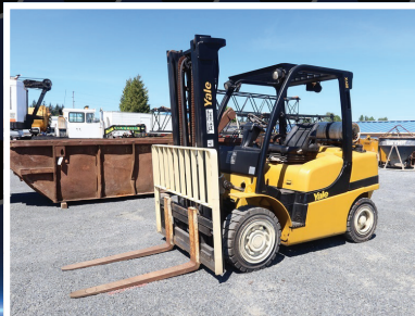
2013 YALE GLP080