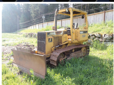
1995 JOHN DEERE 450G SERIES IV