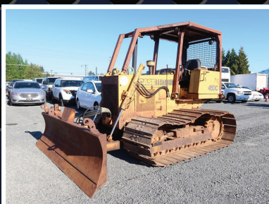
1985 CASE 450C