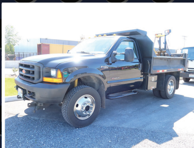
2000 FORD F450