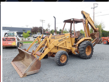
1985 CASE 580 SUPER E 4X4