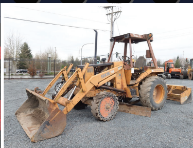
1985 CASE 580 SUPER E