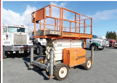
2016 SNORKEL S3970RT