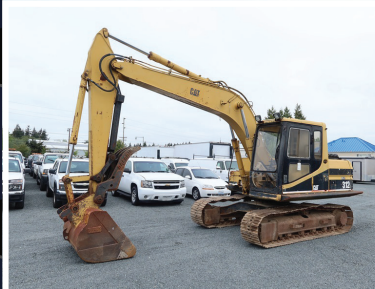
1993 CAT 312