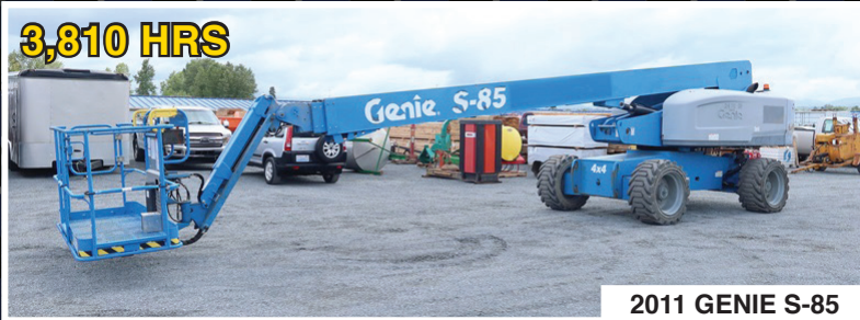
2011 GENIE S-85