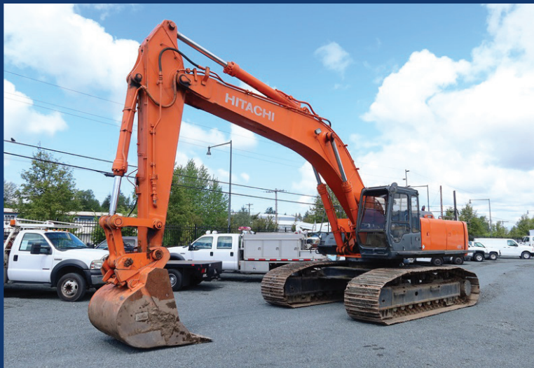
1994 HITACHI EX400LC-3

START DATE: 10:00 AM | THURSDAY - JUNE 6 END DATE: 10:00 AM | THURSDAY - JUNE 13