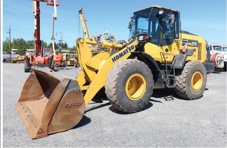
2018 KOMATSU WA270-8