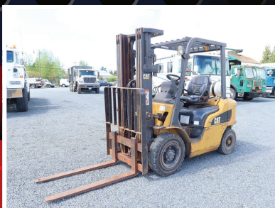
2008 CAT P5000