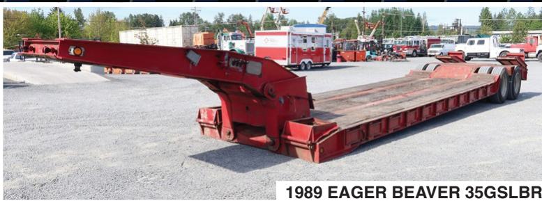
1989 EAGER BEAVER 35GSLBR