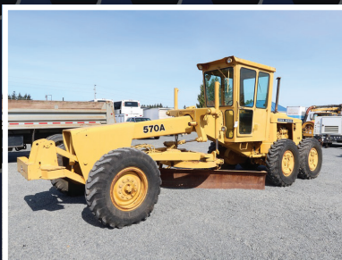
1974 JOHN DEERE 570A