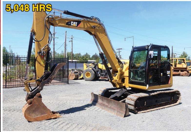
2015 CAT 308E2CR