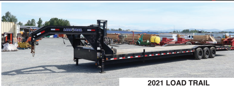
2021 LOAD TRAIL