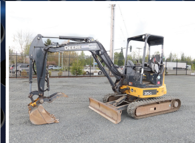
2017 JOHN DEERE 35G