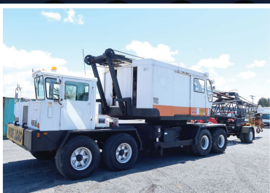
1973 P&H 670TC