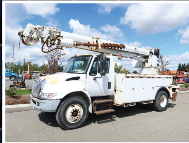
2003 INTERNATIONAL 4300