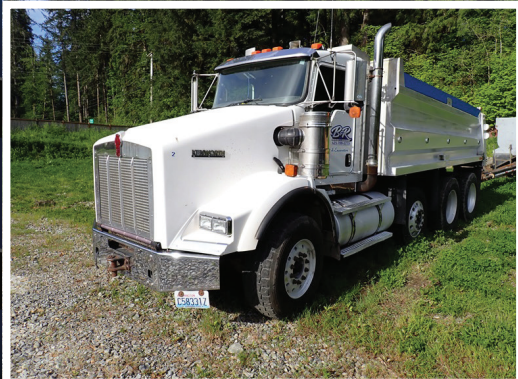
2008 KENWORTH T800B