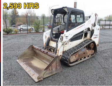
2014 BOBCAT T590