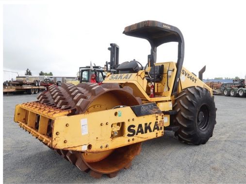
2014 SAKAI SV540T