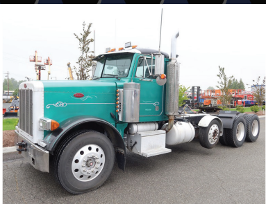
1994 PETERBILT 379