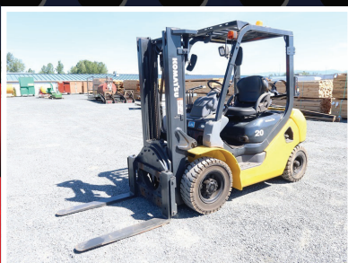
2013 KOMATSU FG20T-17