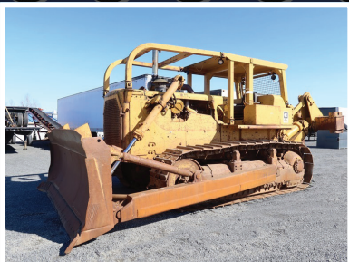
1979 CAT D8K