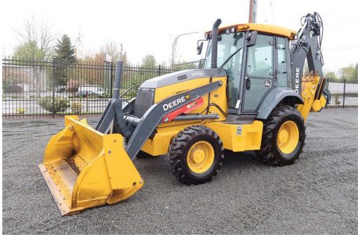
2021 JOHN DEERE 310SL 4X4