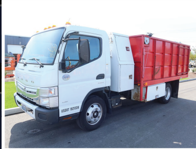
2015 FUSO FE160