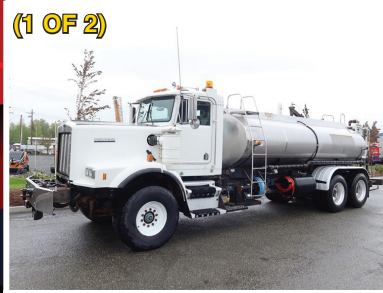
1989 KENWORTH C500B