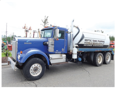
1980 KENWORTH W900