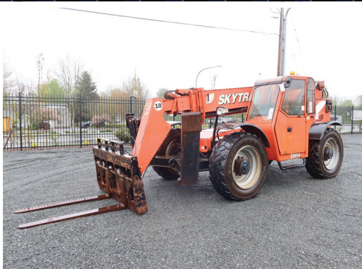
2012 JLG 10055