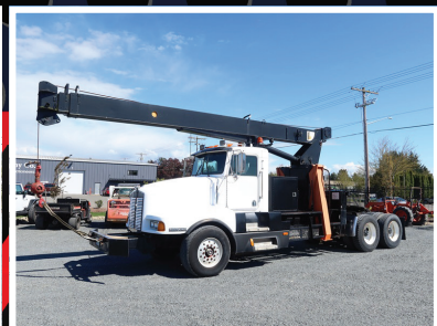
1986 KENWORTH T600A