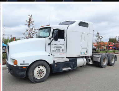
2000 KENWORTH T600B