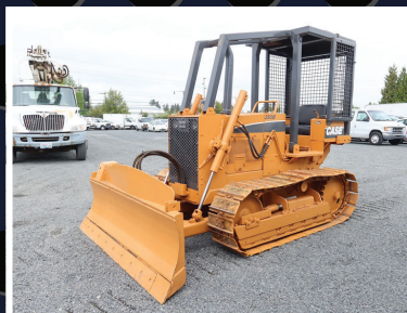
1981 CASE 350B