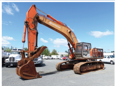
1991 HITACHI EX400LC