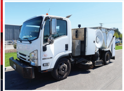
2017 ISUZU TYMCO 435