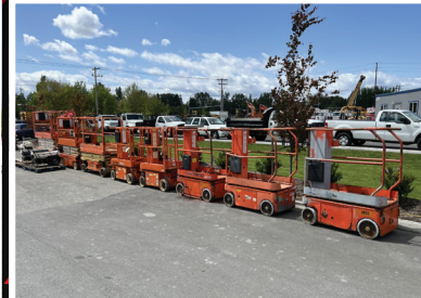
(8) SNORKEL LIFTS