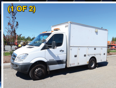
2008 RAM 3500 SPRINTER