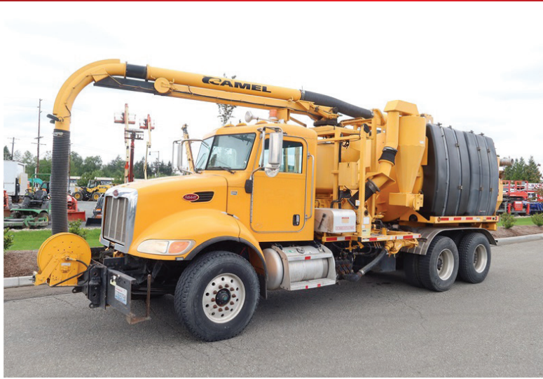
2010 PETERBILT PB340