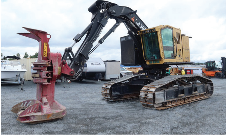
2021 WEILER B458