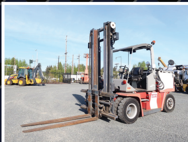
2010 KALMAR ECF70-6