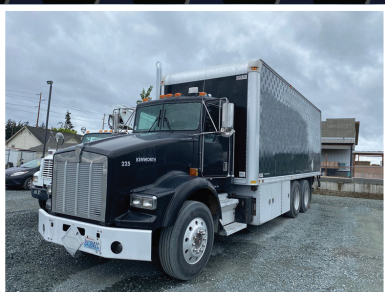
1997 KENWORTH T800