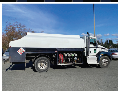
2016 KENWORTH T680