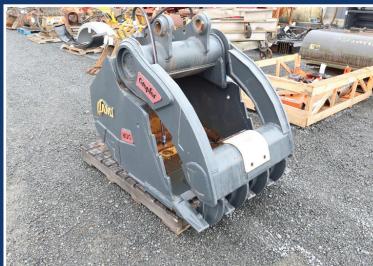
AMI DEDICATED PIN GRAB