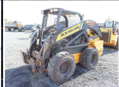
2018 NEW HOLLAND L228