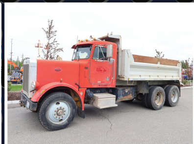
1985 PETERBILT 359