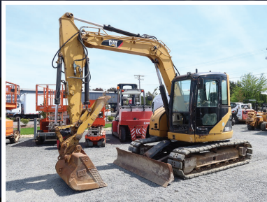
2008 CAT 308C