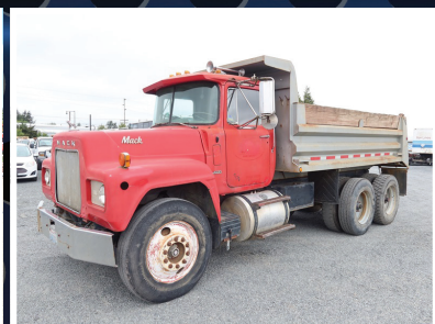
1974 MACK RD685S