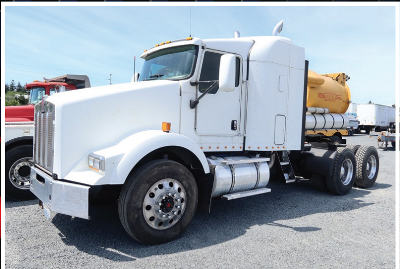
2010 KENWORTH T800