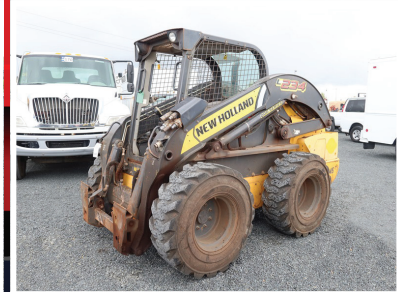
2017 NEW HOLLAND L234