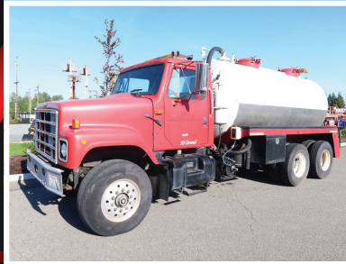
1994 INTERNATIONAL 2574