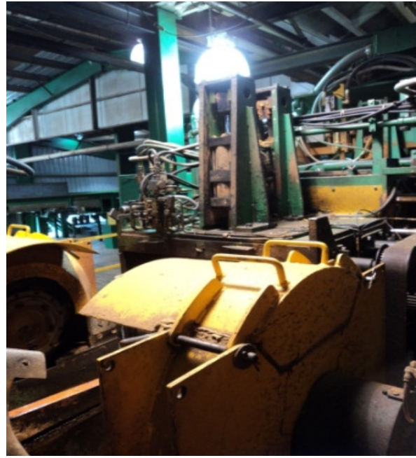
Newnes Optimized Trimmer TA-24-RH-156 with adjustable trim fence, 12 Smart gates for additional re-manning