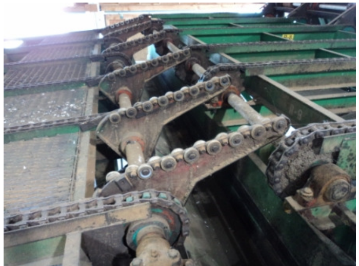
Dual head pineapple feeder & infeed to planer