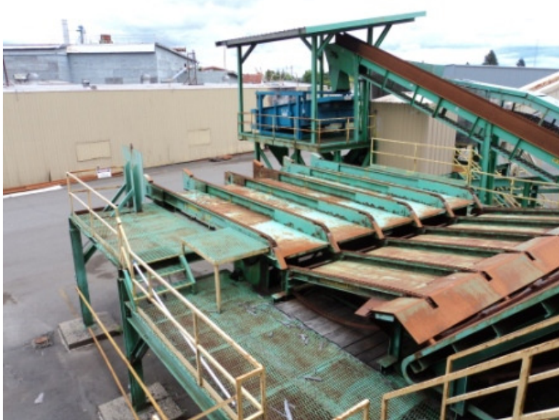
BM&M Shaker Screen 8 X 14-3 DCF s/n 15218