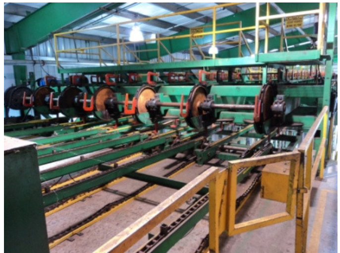
40 bin J Bar Drop Pocket Sorter