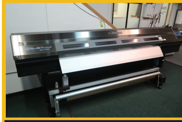
ROLAND SOLJET PRO III XJ-740