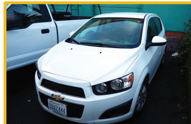
2016 CHEV SONIC LT