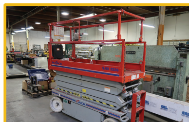
2005 SKYJACK SJ3226