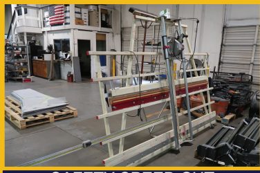
SAFETY SPEED CUT