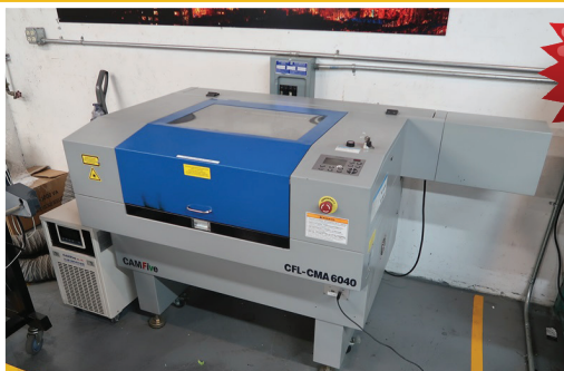
YUEMING CAMFIVE CFL-CMA6040