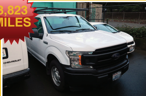
2018 FORD F150XL