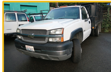
2004 CHEV 3500