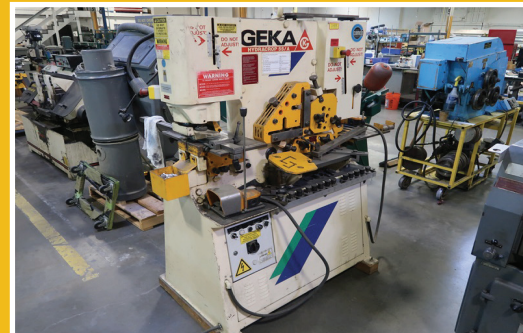
2007 GEKA HYD55

James G. Murphy Co. Commercial & Industrial Auctioneers