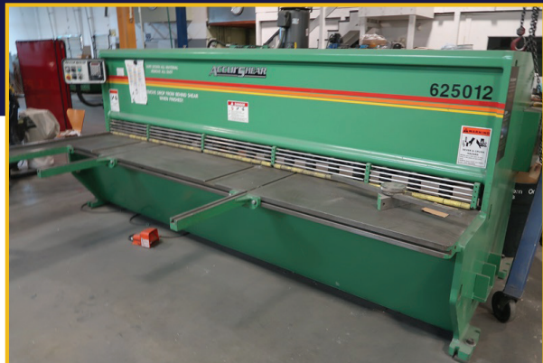
2007 ACCURSHEAR 625012