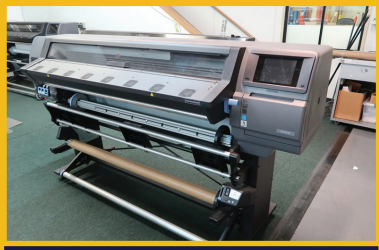
HP LATEX 360