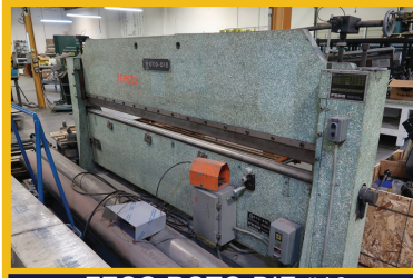
FECO ROTO-DIE #10