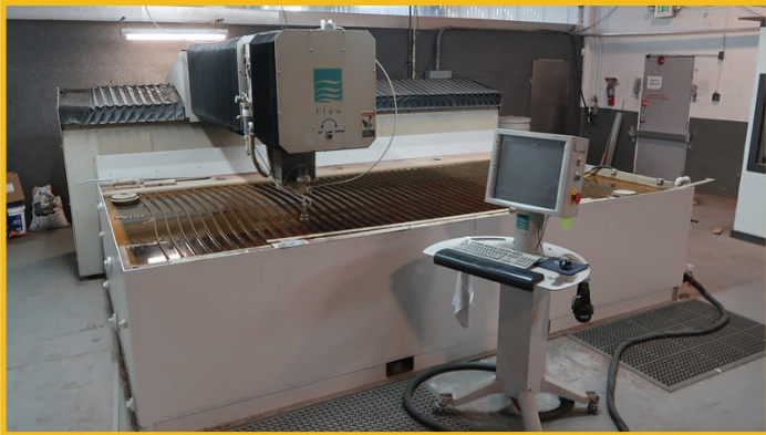
2006 FLOWJET 713633-1