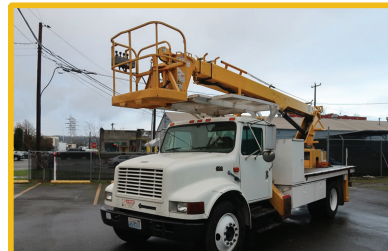
1998 INTERNATIONAL 4700

WARRANTY DISCLAIMER: ALL SALES ARE FINAL. ALL ITEMS ARE BEING SOLD "AS IS, WHERE IS," WITH ALL FAULTS AND WITHOUT ANY WARRANTIES AS TO MERCHANTABILITY OF FITNESS FOR A PARTICULAR PURPOSE. THE PRINCIPAL, THE AUCTIONEER, THE ADVERTISING COORDINATOR, AND ANY OF THEIR AGENTS MAKE NO EXPRESS OR IMPLIED WARRANTIES OF ANY TYPE. COMPLETE TERMS AND CONDITIONS OF SALE WILL BE AVAILABLE AT THE TIME OF SALE.