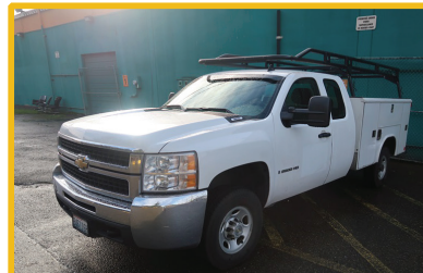
2014 CHEV 2500 HD