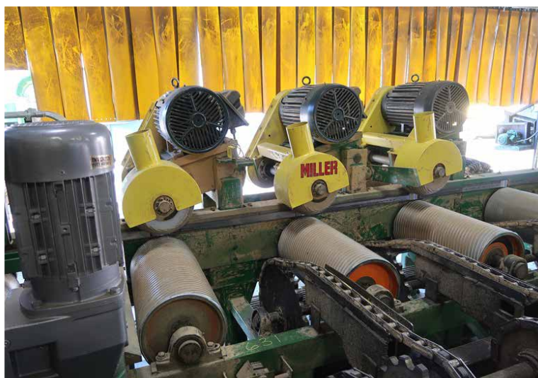
2018 MILLER TRIPLE PINEAPPLE FEED TABLE