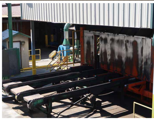
2015 NEWNES 20' TILT HOIST