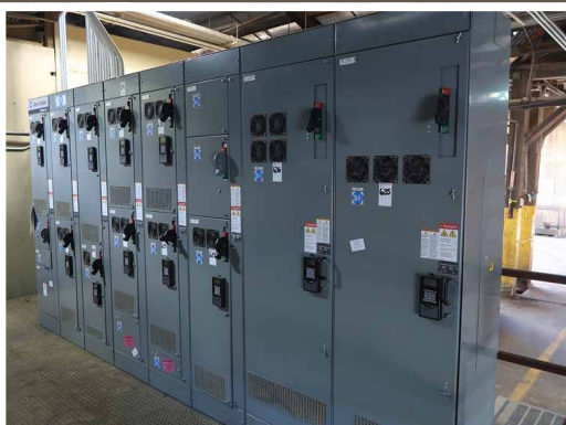
2018 ALLEN BRADLEY CENTERLINE MCC