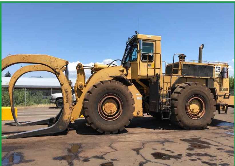
1980 CAT 988B