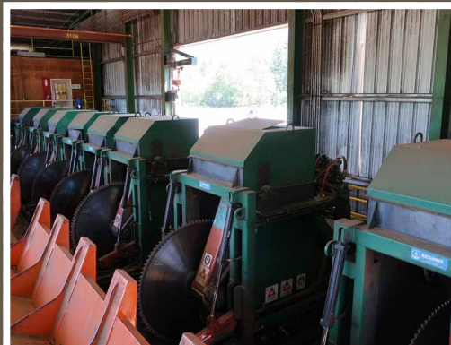
2000 USNR SERIES 7310 MERCHANDISER

BID LIVE OR BID ONLINE - NO MINIMUMS - NO RESERVES