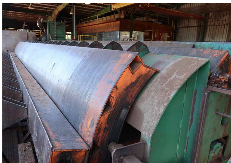
2004 LINDEN DQ436X55 60' DOUBLE ACTING QUADRANT FEEDER