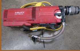
HILTI DD-160E CORE DRILLING MACHINE