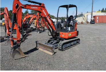
2018 KUBOTA KX033-4