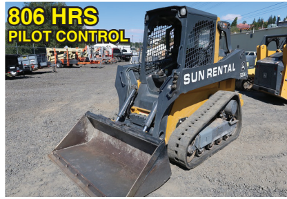
2017 JOHN DEERE 323E