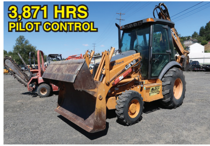
2007 CASE 580M SERIES II