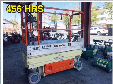
2011 JLG 1930ES