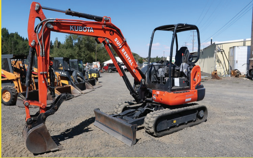
2019 KUBOTA KX040-4