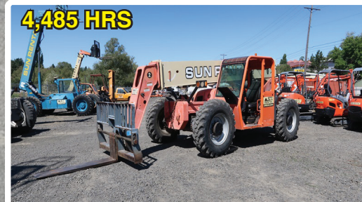
2003 JLG G9-43A