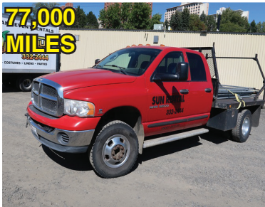
2004 DODGE RAM 3500