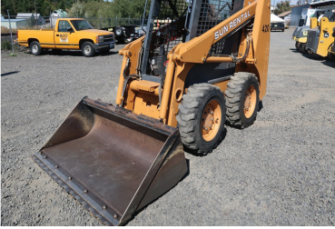
2007 CASE 420