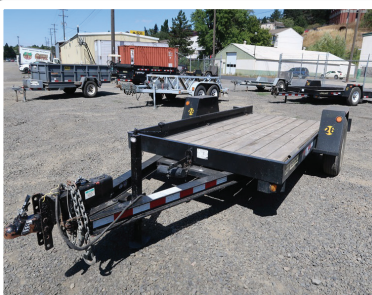
2016 TOWMASTER T-12DT