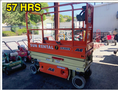
2018 JLG 1930ES