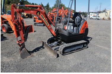
2009 KUBOTA KX41-3B-3