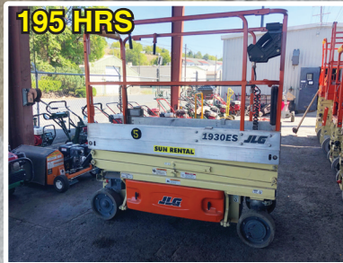
2008 JLG 1930ES