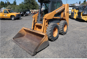
2007 CASE 430