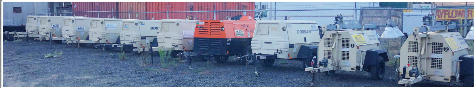
(12) 2003 - 2017 TRAILER MOUNTED AIR COMPRESSORS & (2) LIGHT TOWERS