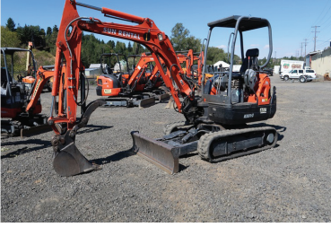
2014 KUBOTA KX91-3SS