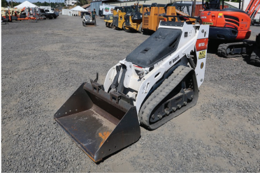
2018 BOBCAT MT85