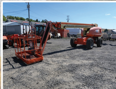
2001 JLG 660SJ