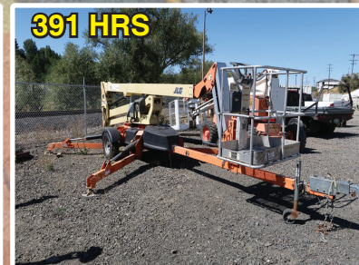
2012 JLG T500J