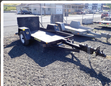
2019 REDI HAUL RH2001