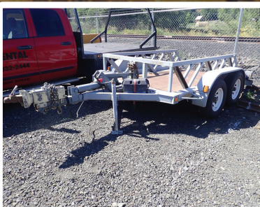
2003 BILJAX ET500W