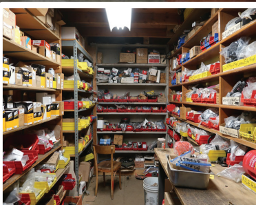
ASSORTMENT OF PARTS