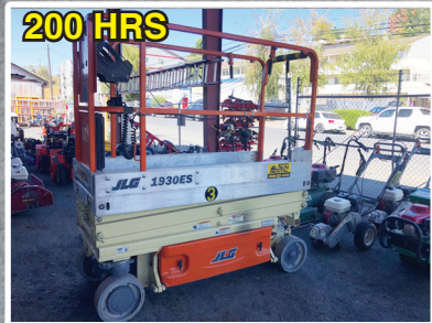
2007 JLG 1930ES