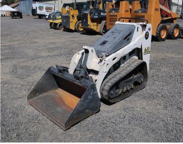
2014 BOBCAT MT55