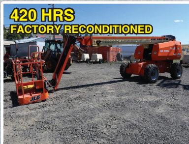
2011 JLG 660SJ