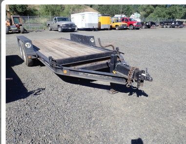
(2) 2005 TOWMASTER T-12DT