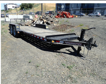
2020 TOWMASTER T-12DT