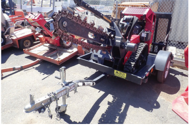
2020 TORO TRX250