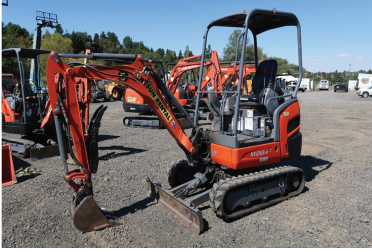
2015 KUBOTA KX018-4