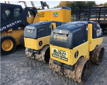
(2) BOMAG BMP8500