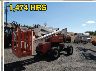
2011 SNORKEL UN041