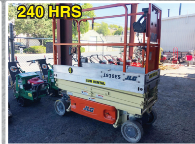
2008 JLG 1930ES