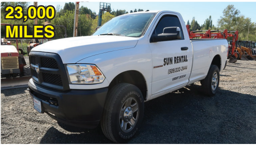
2018 DODGE RAM 2500