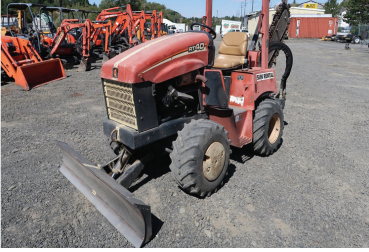
2005 DITCH WITCH RT40