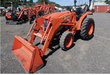
2017 KUBOTA L3301D