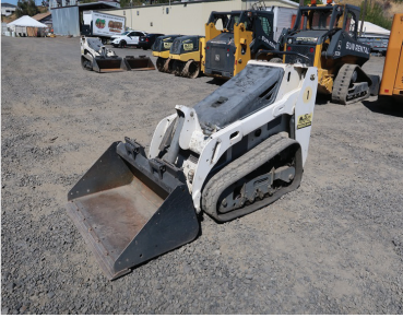
2007 BOBCAT MT55