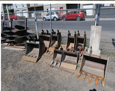
ASSORTED DIGGING BUCKETS