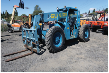
1994 GRADALL 534C-6