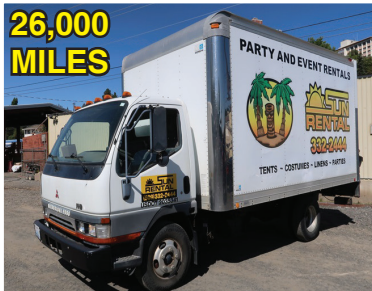
2004 MITSUBISHI FE HD