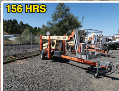
2018 JLG T500J