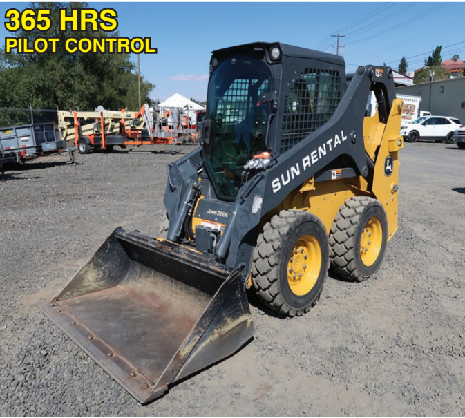
2019 JOHN DEERE 318G