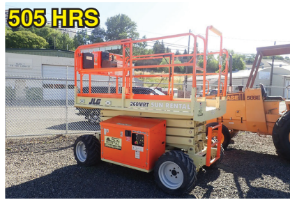
2018 JLG 260MRT