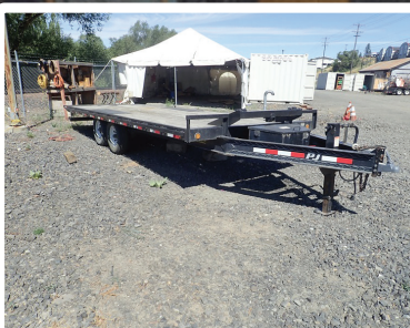
2012 PJ T8222