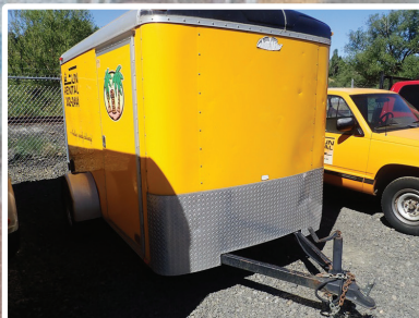
2005 FOREST RIVER