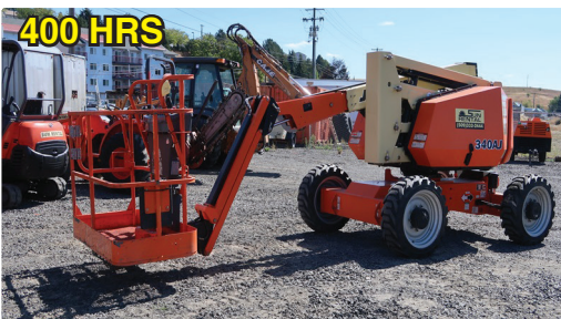
2019 JLG 340AL