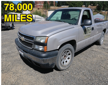
2006 CHEV 1500