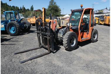
2008 JLG G5-18A