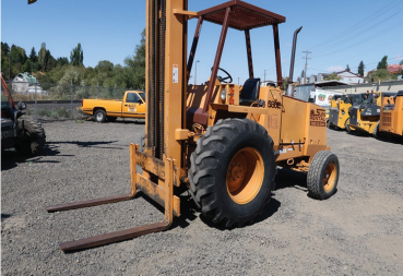
1994 CASE 586E