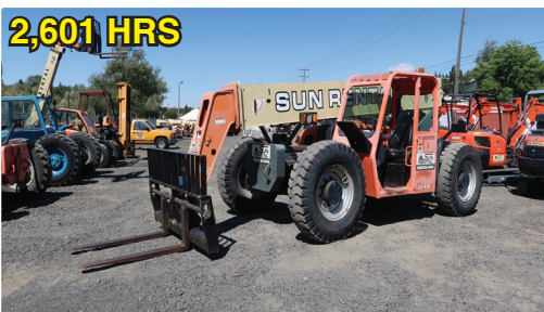
2006 JLG G9-43A