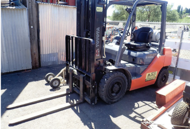
2017 TOYOTA 8FGU25