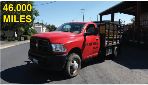
2012 DODGE RAM 3500