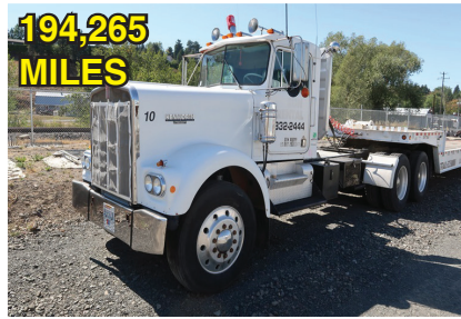
1974 KENWORTH W925