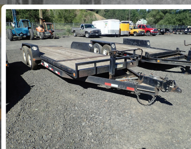
2012 PJ 6202