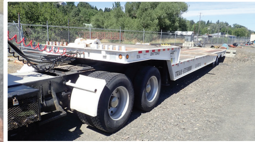
2001 TRAILZEZE DHT7048