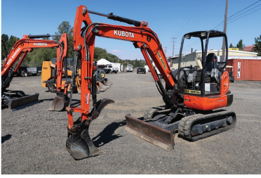
2016 KUBOTA KX040-4