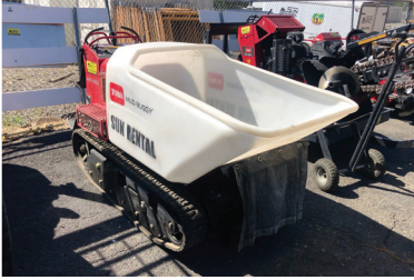
2020 TORO MBTX250