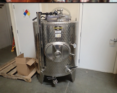
SPEIDEL FS-M0-100 850L&R