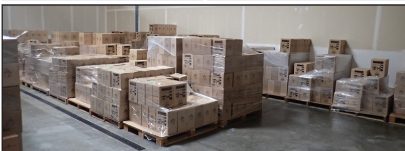
LARGE ASSORTMENT OF INVENTORY