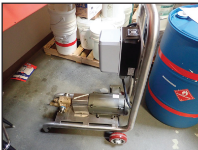
1.5HP EXPLOSIVE PROOF PUMP