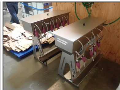
(2) TOCUNA B6BC6