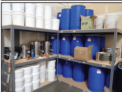
ORGANIC HERB INVENTORY