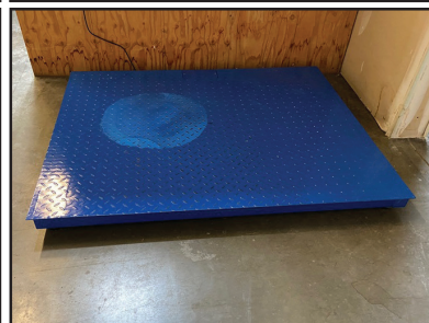
48"X60" PALLET SCALE