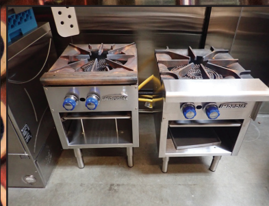
(2) IMPERIAL ISPA-15