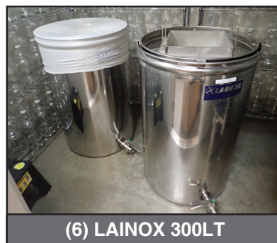
(6) LAINOX 300LT