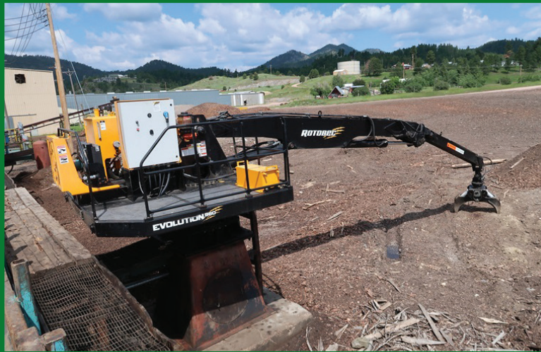
2017 ROTOBEC EVOLUTION 960-SMW HYDRAULIC OPERATED PEDESTAL MOUNT LOG LOADER

Preview: 8AM to 4PM | September 22 or by appointment