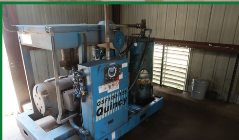
QUINCY QSF100-125 SERIES ROTARY SCREW COMPRESSOR