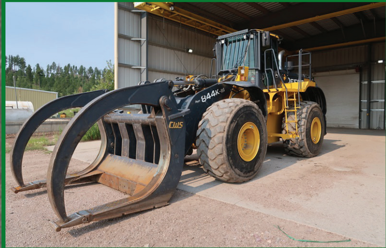
2017 JOHN DEERE 844K-III