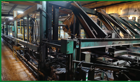
HEMCO SERIES 43 16' LH 51-BIN SAWMILL SLING SORTER