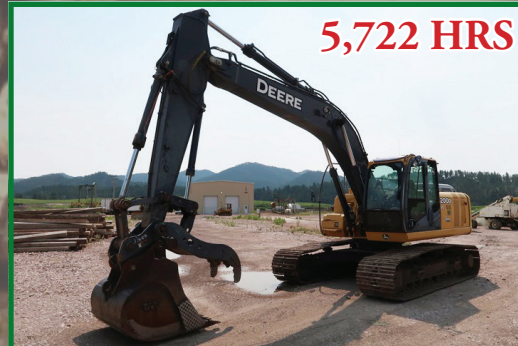
2008 JOHN DEERE 200DLC