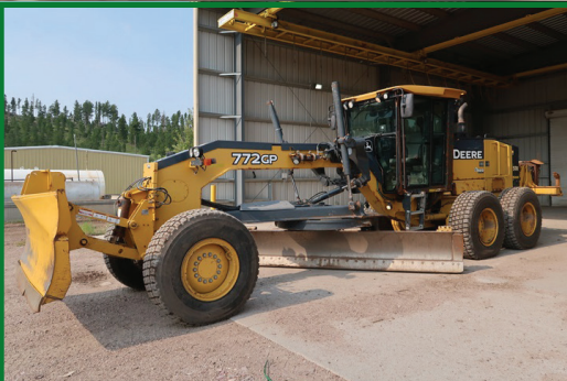
2010 JOHN DEERE 772GP