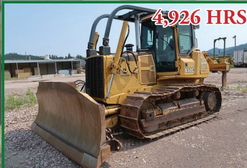
2004 JOHN DEERE 850C SERIES II