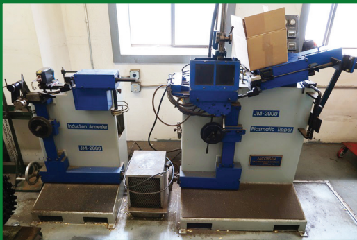
2018 JACOBSEN JM2000 PLASMATIC TIPPER W/ANNEALER & BERNARD CHILLER