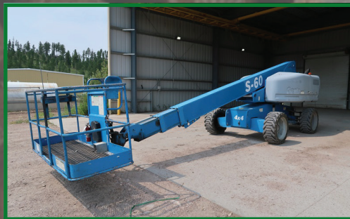
2008 GENIE S60