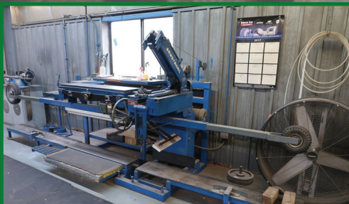
ARMSTRONG #6 STRETCHER ROLL

ALLEN BRADLEY CENTERLINE 13-SECTION MCC W/(24) SWITCHES (HEADRIG) ALLEN BRADLEY CENTERLINE 11-SECTION MCC W/(24) SWITCHES (SHARP CHAIN) ALLEN BRADLEY CENTERLINE 10-SECTION MCC W/(40) SWITCHES (SAWMILL TRIMMER) ALLEN BRADLEY CENTERLINE 10-SECTION MCC W/(27) SWITCHES (BARKER) SQUARE D 7-SECTION MCC W/(19) SWITCHES (MCDONOUGH) ALLEN BRADLEY CENTERLINE 7-SECTION MCC W/(18) SWITCHES (HEADRIG) ALLEN BRADLEY CENTERLINE 5-SECTION MCC W/(24) SWITCHES (CHIP SCREEN) ALLEN BRADLEY CENTERLINE 5-SECTION MCC W/(20) SWITCHES (GANG) ALLEN BRADLEY CENTERLINE 3-SECTION MCC W/(15) SWITCHES (SAWMILL TRIMMER) ALLEN BRADLEY CENTERLINE 2-SECTION MCC W/(13) SWITCHES (SAWMILL STACKER) ALLEN BRADLEY POWERFLEX 700L 200 HP LIQUID COOLED DRIVE (CARRIAGE) (2) 2019 ALLEN BRADLEY POWERFLEX 755 60 HP DRIVES (GANG) 2019 ALLEN BRADLEY POWERFLEX 755 25 HP DRIVE (GANG) 2019 ALLEN BRADLEY POWERFLEX 755 15 HP DRIVE (GANG) ALLEN BRADLEY SMC DIALOG PLUS 400 HP DRIVE (GANG) (2) ALLEN BRADLEY SMC DIALOG PLUS 300 HP DRIVES (GANG) 2019 ALLEN BRADLEY 5582E PLC W/(4) MODULES (GANG) ALLEN BRADLEY 5550 PLC W/(8) MODULES (SAWMILL SORTER) LARGE QUANTITY OF MOTORS TO 400 HP, UNUSED REX & CYCLO REDUCERS, UNUSED ALLEN BRADLEY POWERFLEX DRIVES TO 20 HP, LARGE QUANTITY OF TEMPOSONIC VALVES & WANDS, LARGE STORE OF ASSORTED ELECTRICAL