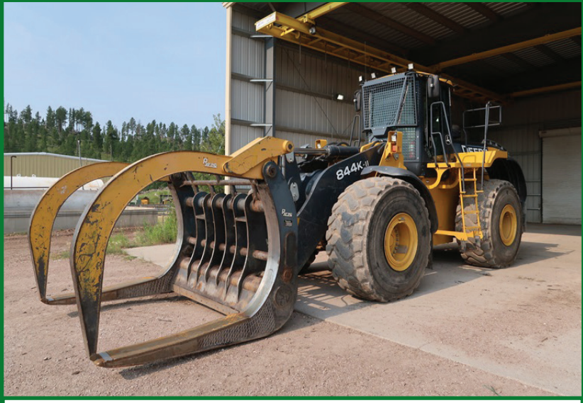
2015 JOHN DEERE 844K-II

START DATE: 9AM | SEPTEMBER 16 END DATE: 9AM | SEPTEMBER 23