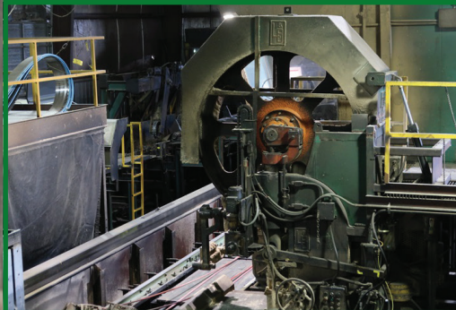
LETSON BURPEE HS-3 6' RH VERTICAL BANDMILL HEADRIG