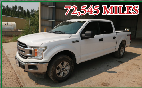
2019 FORD F150 XLT