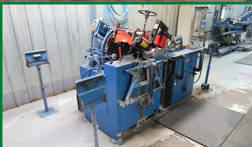
ARMSTRONG #4 LH W/LINEAL & SHAPE UP ARM