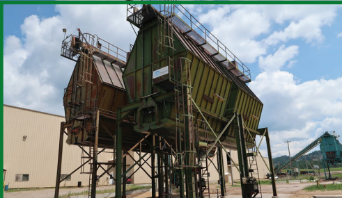
LSI PEERLESS APPROX. 80-UNIT MONO BARK BIN W/CROSS TOP AUGER