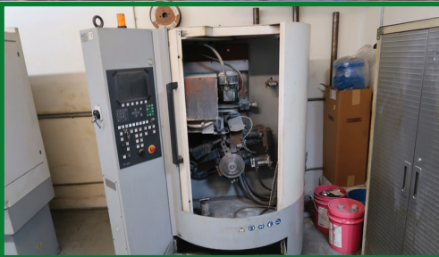
2011 VOLLMER TYPE CPF200 SIDE GRINDER