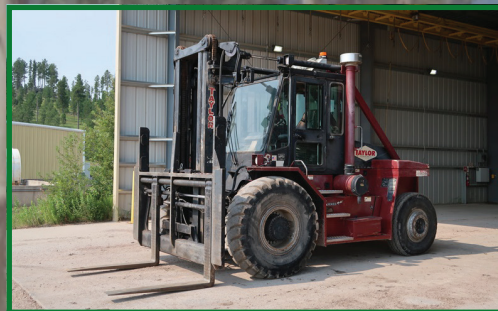
2012 TAYLOR TXB250M