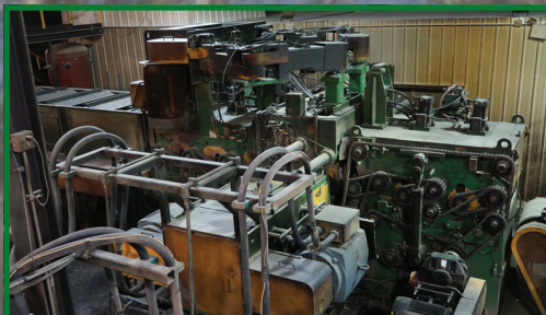
USNR/COE NEWNES/MCGEHEE 8" SPLINED BOTTOM ARBOR CURVE SAWING GANG