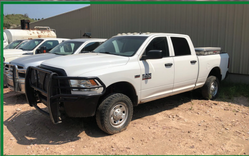
2016 DODGE RAM 2500HD