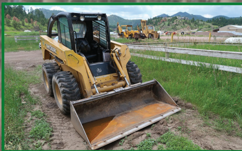
2004 JOHN DEERE 260