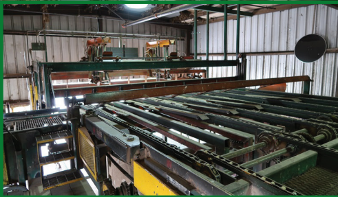
USNR/LUNDEN 16' LH HYDRAULIC OPERATED SAWMILL STACKER