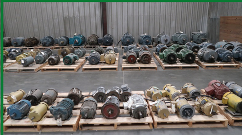
LARGE ASSORTMENT OF MOTORS