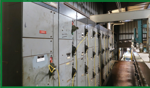
ALLEN BRADLEY CENTERLINE 10-SECTION MCC W/(40) SWITCHES