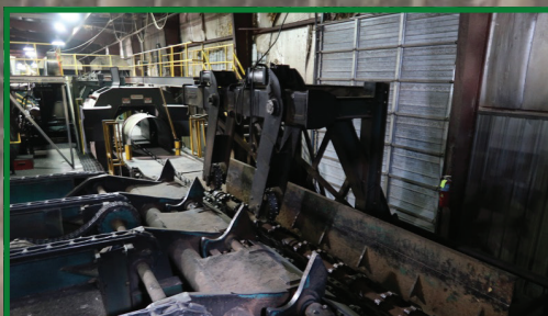
(2) KOCKUMS 6' OHW TEMPOSONIC POSITIONED VERTICAL TWIN BANDMILLS