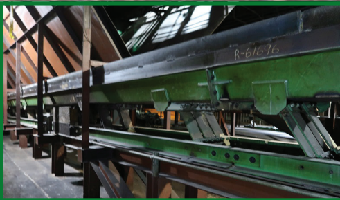
PRECISION HUSKY 20" X APPROX. 80' VIBRATORY CONVEYOR