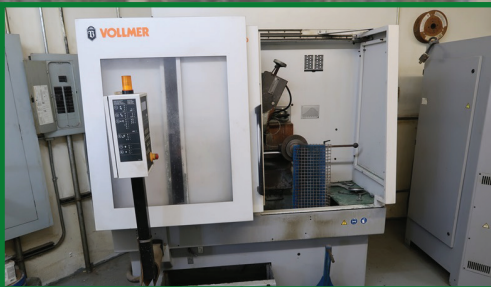
2012 VOLLMER CHC EC0 FACER/TOPPER