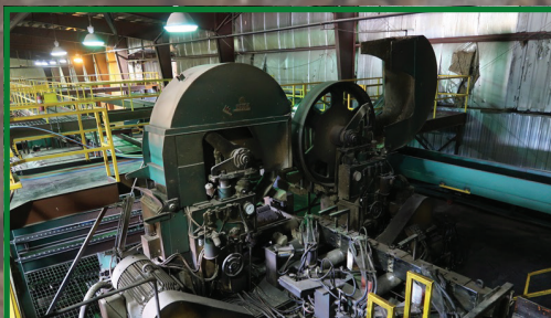
(2) MCDONOUGH MODEL 6-7 TEMPOSONIC POSITIONED 6' VERTICAL BAND RESAWS