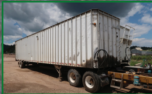
1991 IMCO T/A 53' LIVE FLOOR ALUMINUM CHIP TRAILER

1986 TAYLOR BIGFOOT TY250 25,000 LB. CAPACITY FORKLIFT, DETROIT 5.3L ENGINE, 2-STAGE MAST W/FORK PLACERS, SIDE SHIFT, 7"X48" FORKS, PNEUMATIC TIRES, HOUR METER READS: 11,000, S/N: 17122