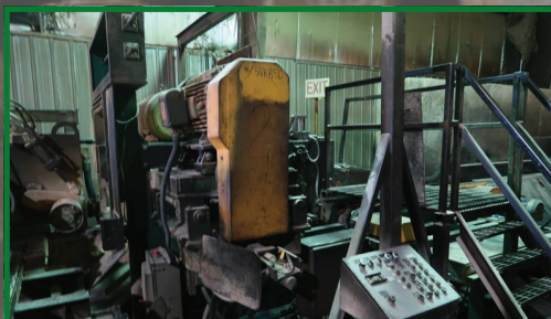
HEMCO 2"X20" RH 2-SAW BOARD EDGER