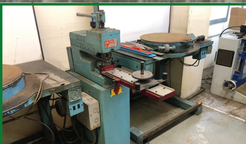
ARMSTRONG 3-10C CIRCLE SAW STRETCHER ROLL W/LINEAR SLIDE